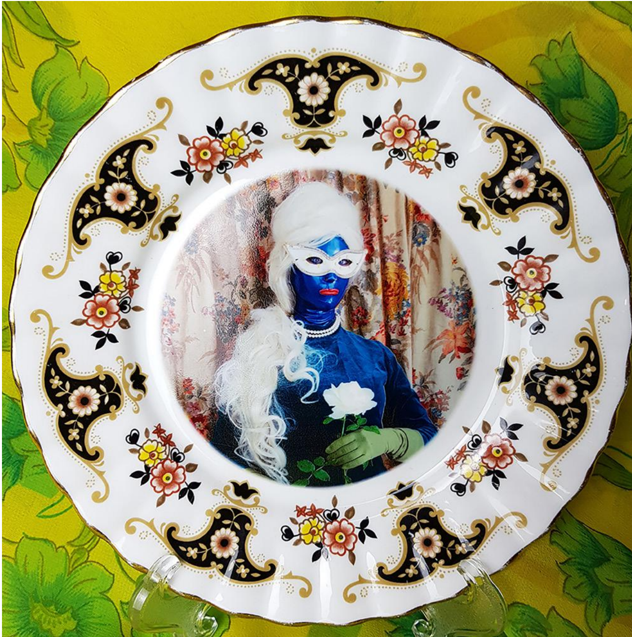
Miss Meatface: Desiree's Rose No. 2, 2018 Vintage china plate with photo transfer Unique 7" diameter