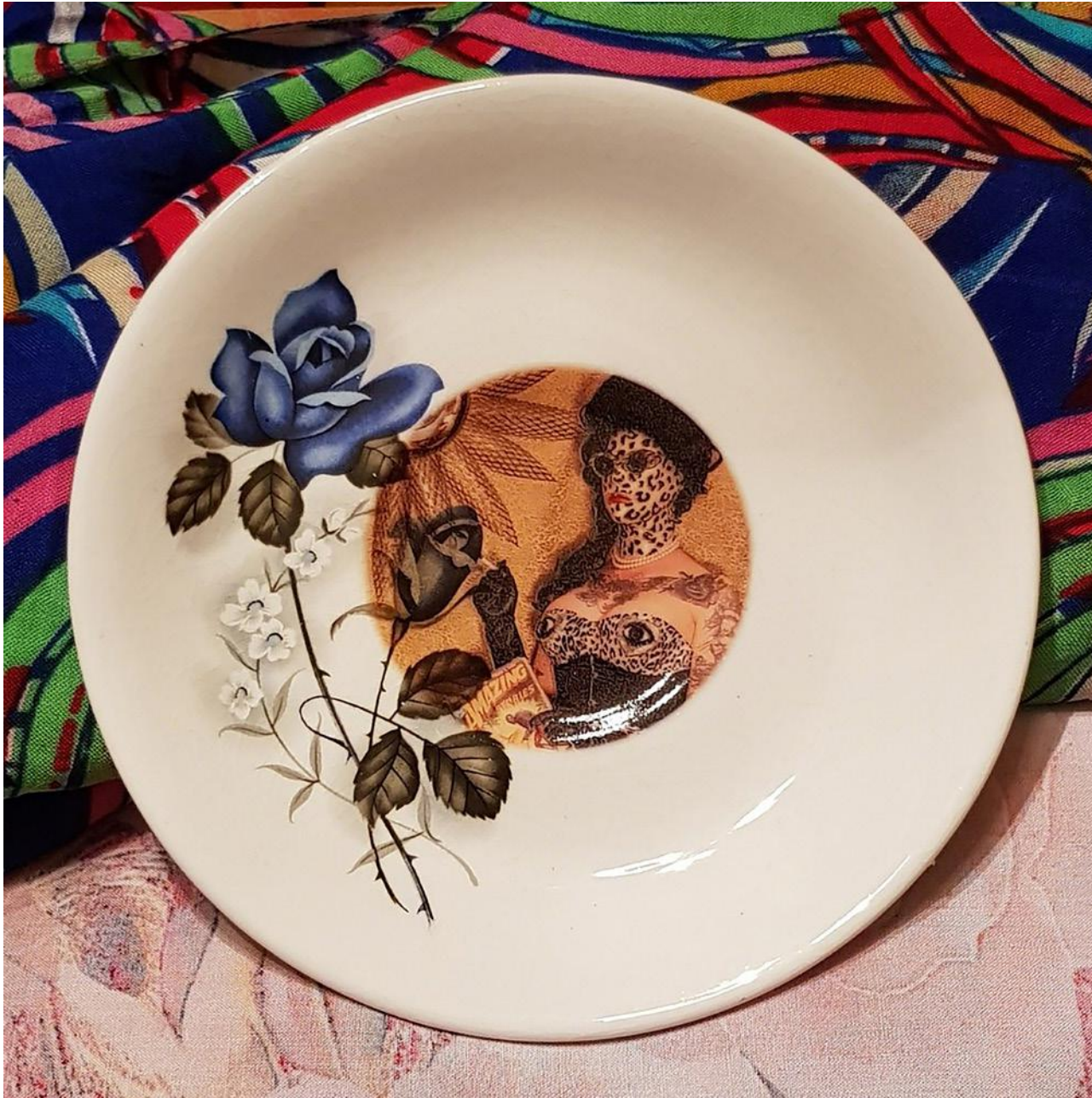
Miss Meatface: Amazing Stories, 2018 Vintage china plate with photo transfer Unique 5.375" diameter