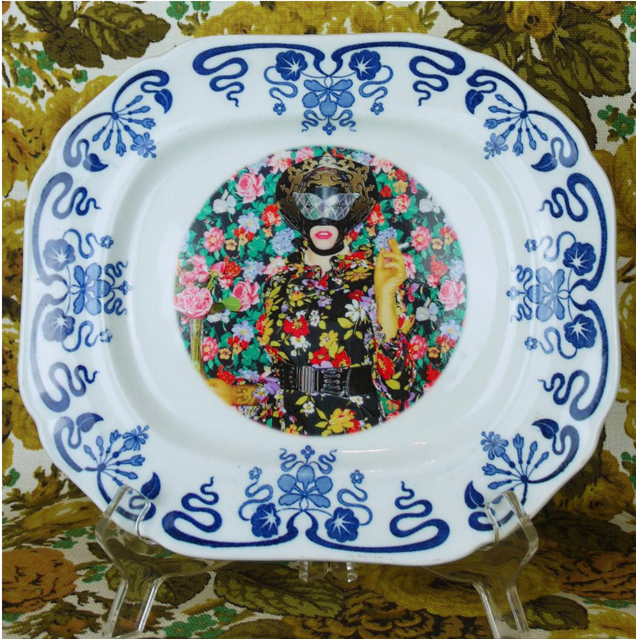
Miss Meatface: Floral, 2018 Vintage china plate with photo transfer Unique 9.375" diameter