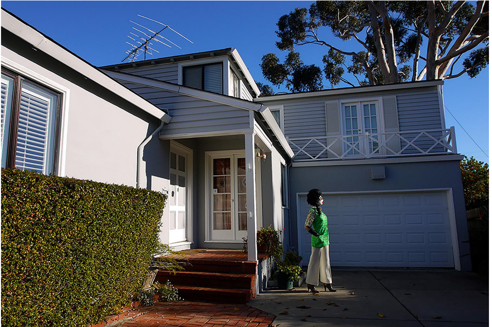
Queen Of Suburbia (#1), 2019 Photography Printed on Aluminum with Archival Ink Limited Edition of 10 16" x 20"