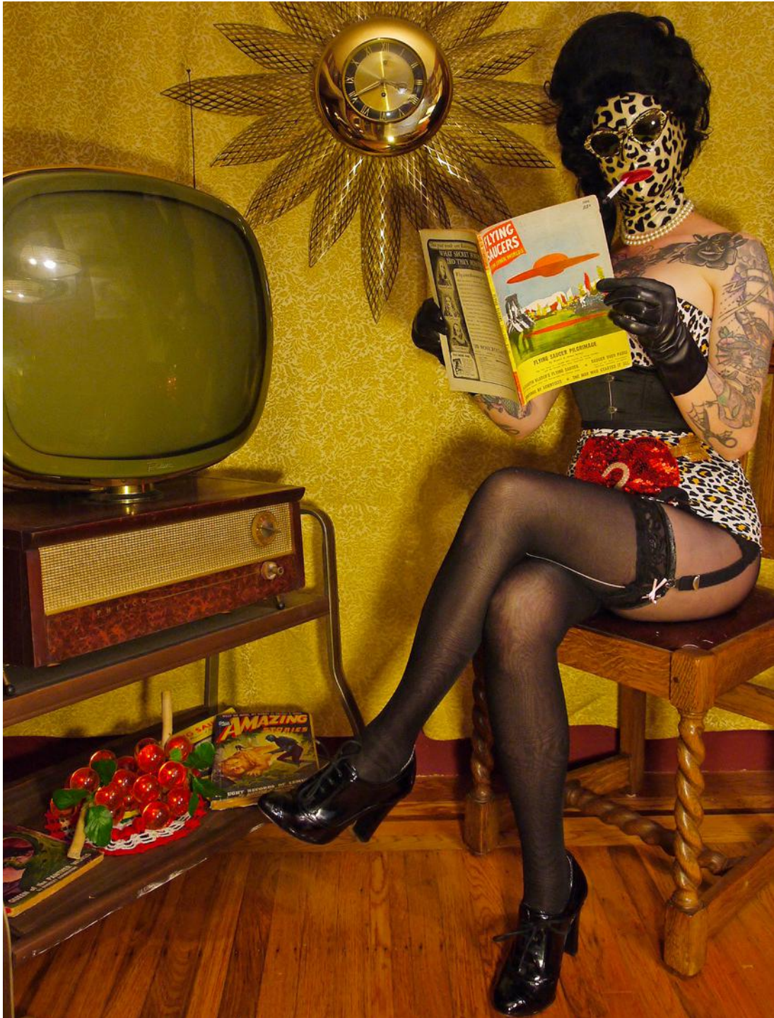
Flying Saucers, 2016 Photography Printed on Aluminum with Archival Ink Limited Edition of 3 16" x 20"