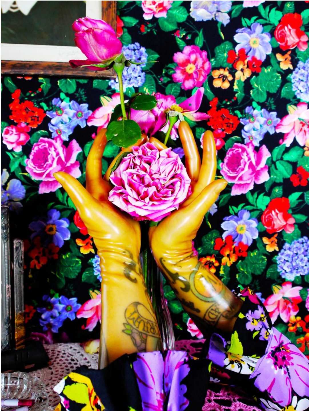
Pink Rose Archival Ink Jet Print on Metallic Paper Limited Edition of 10 Art 10" x 8", Framed 16" x 12"