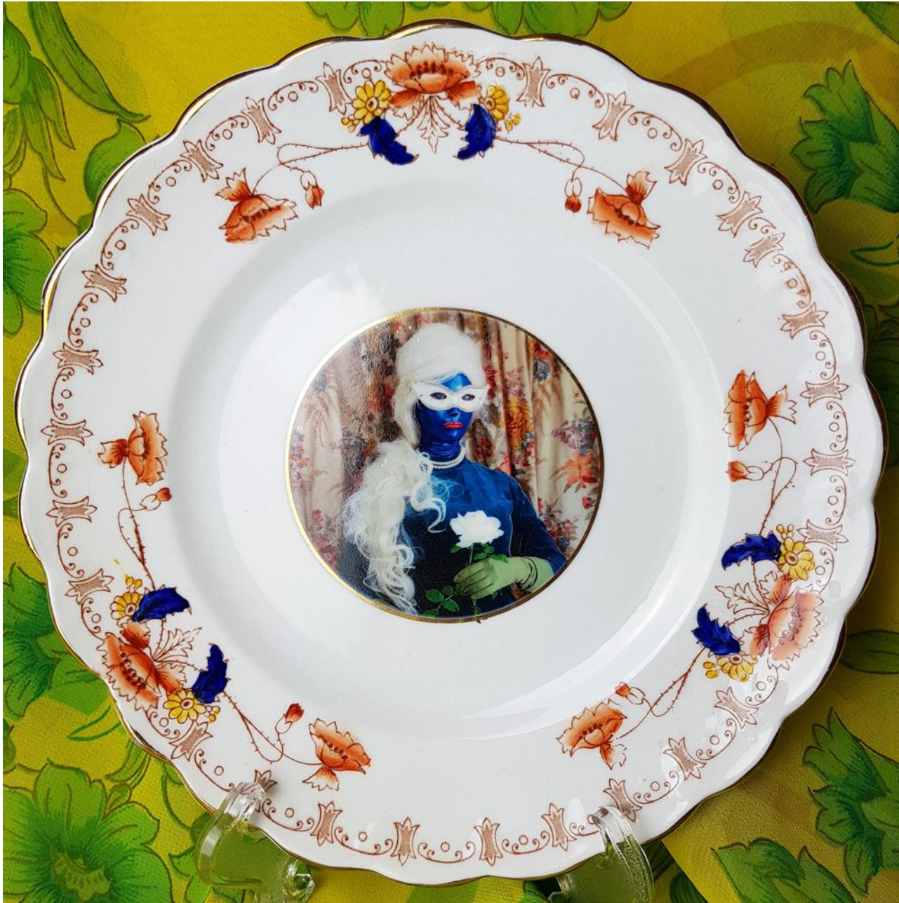
Miss Meatface: Desiree's Rose No. 3, 2019 Vintage china plate with photo transfer Unique 7" diameter