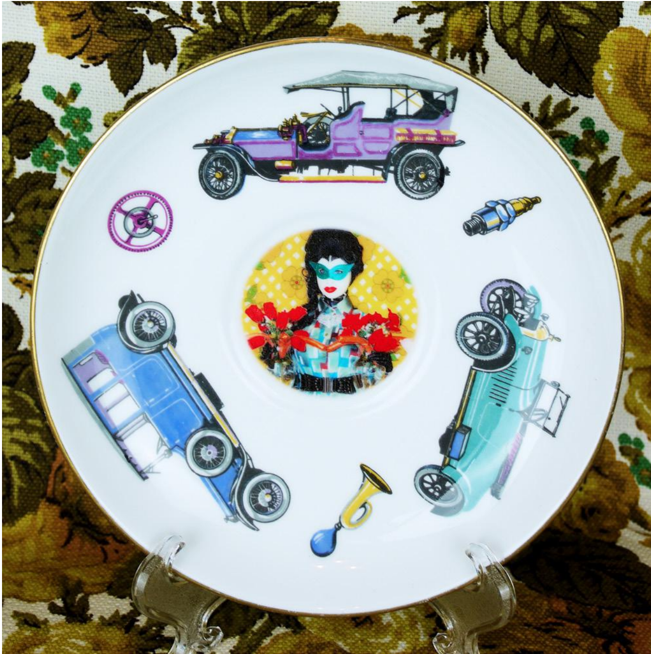
Miss Meatface: A Dozen Roses, 2019 Vintage china plate with photo transfer Unique 6.375" diameter