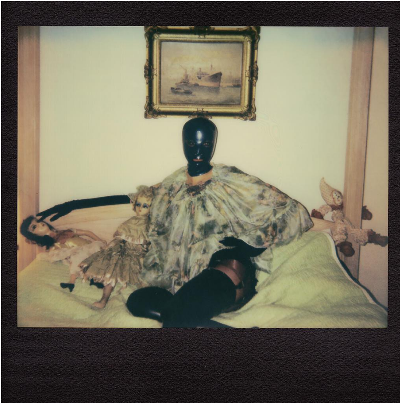
Miss Meatface: Boudoir Dolls, 2015 Polaroid photograph in vintage frame Unique Art 4.051" x 3.996", Framed 8" x 8"