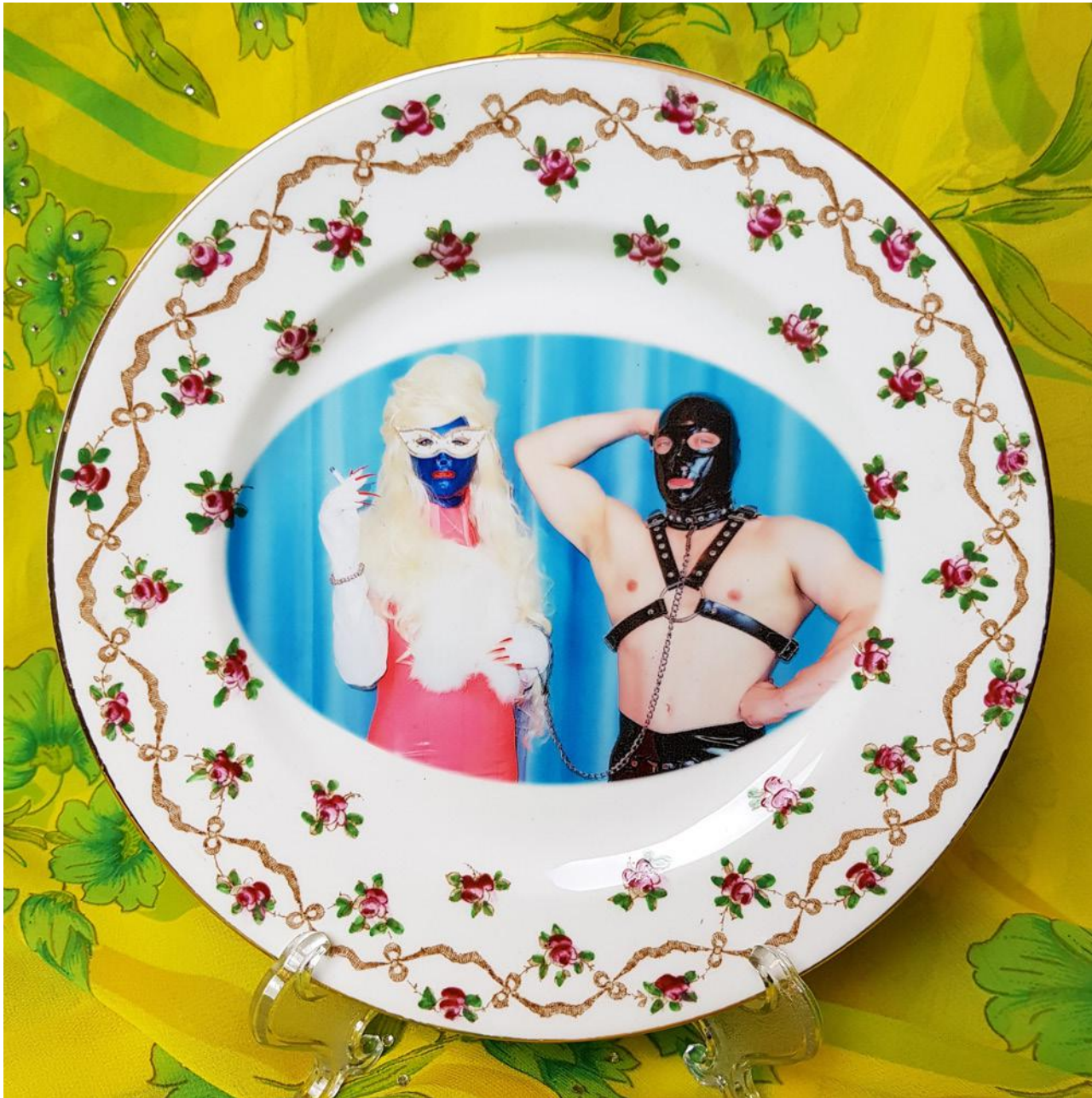
Miss Meatface & MeatMaid, 2019 Vintage china plate with photo transfer Unique 7" diameter