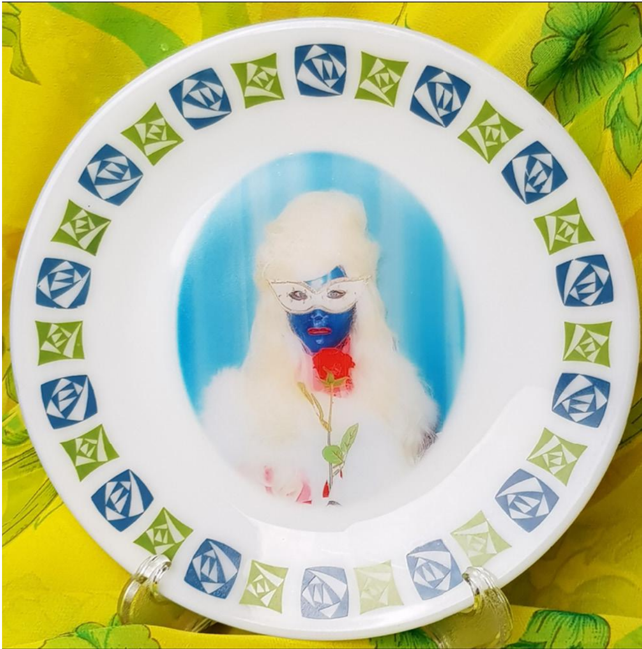
Miss Meatface: Mae West No. 3, 2019 Vintage china plate with photo transfer Set of 2 6.5" diameter