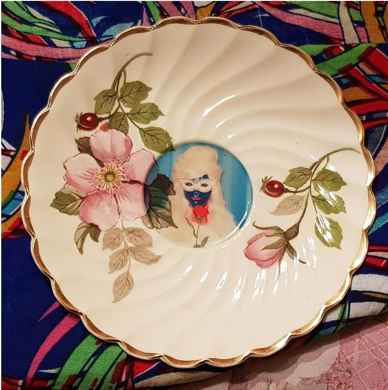
Miss Meatface: Mae West No. 2, 2018 Vintage china plate with photo transfer Unique 5.5" diameter