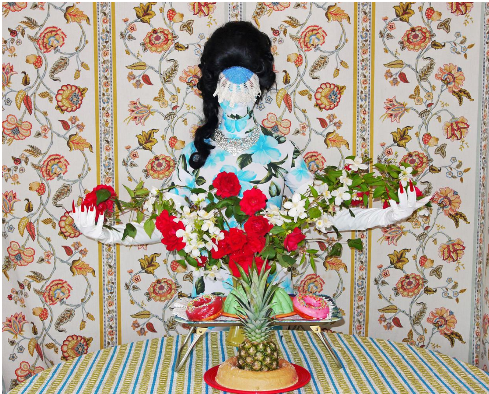
Demure Debutante, 2017 Photography Printed on Aluminum with Archival Ink Limited Edition of 3 16" x 20" -or- 24" x 30"