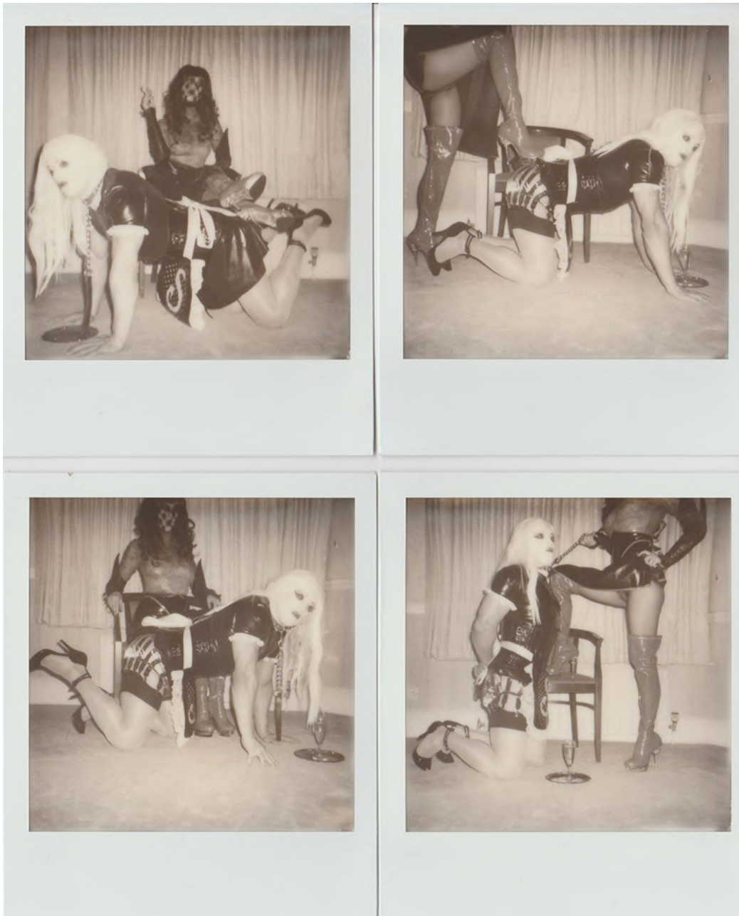
In Training Polaroid Group #3, 2017 Set of 4 Polaroid photographs Unique 4.25" x 3.5"