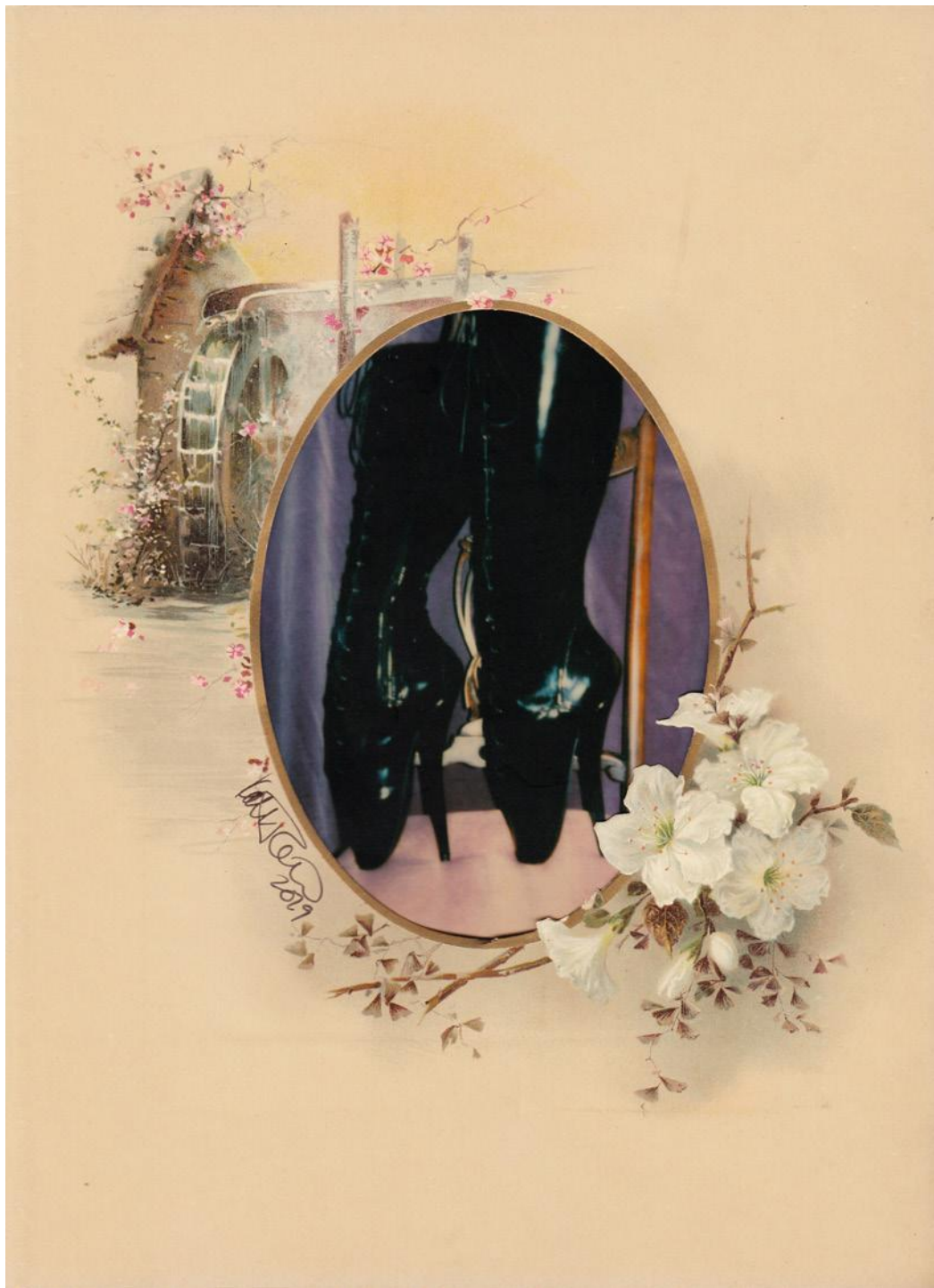
Tip-Toe, 2019 Antique Victorian photo album page with c-type print, framed Unique Art 8.25" x 11.6", Framed 13" x 17"