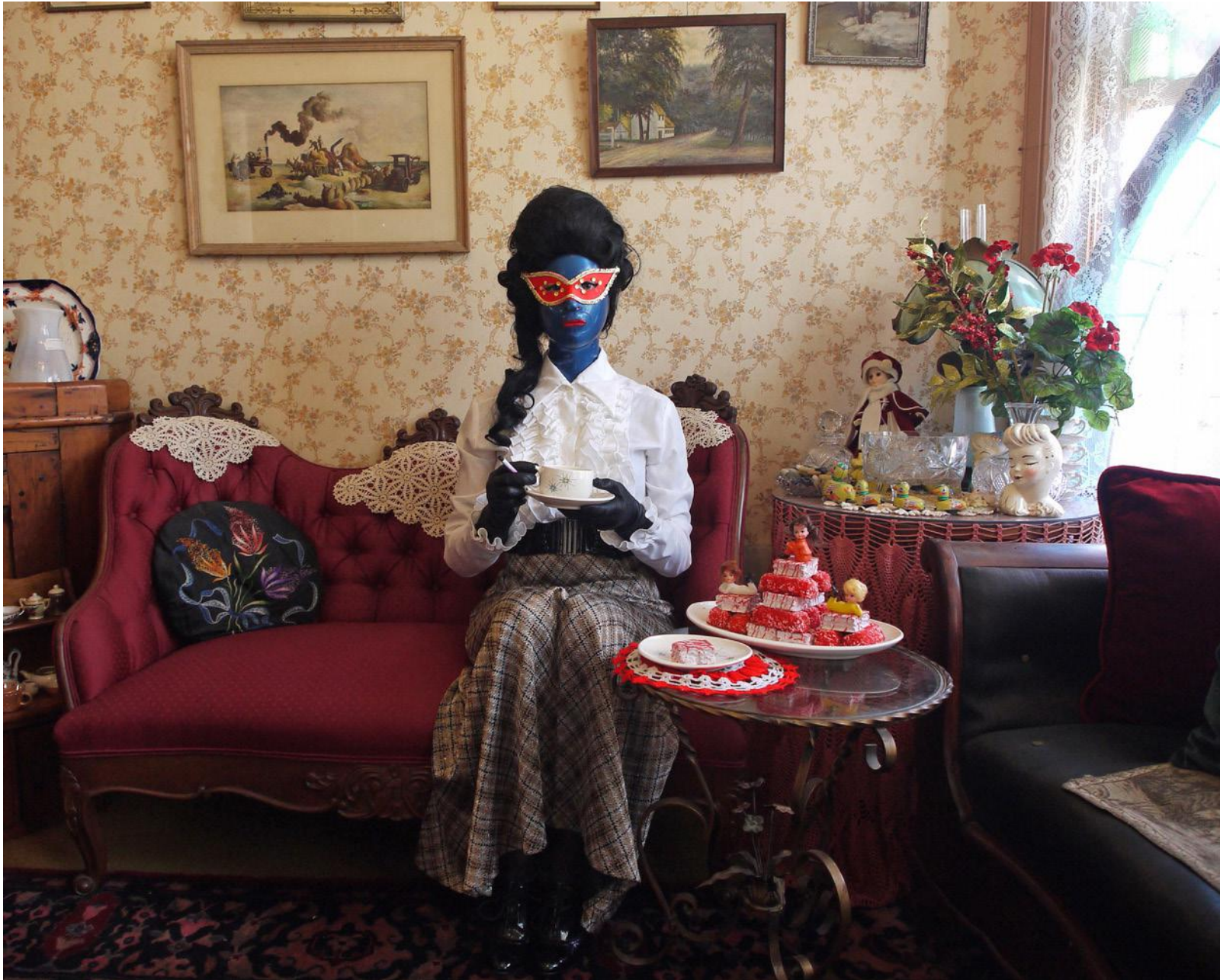
Parlour, 2016 Archival Ink Jet Print on Metallic Paper Limited Edition of 3 Art 20" x 24", Framed 21" x 25"