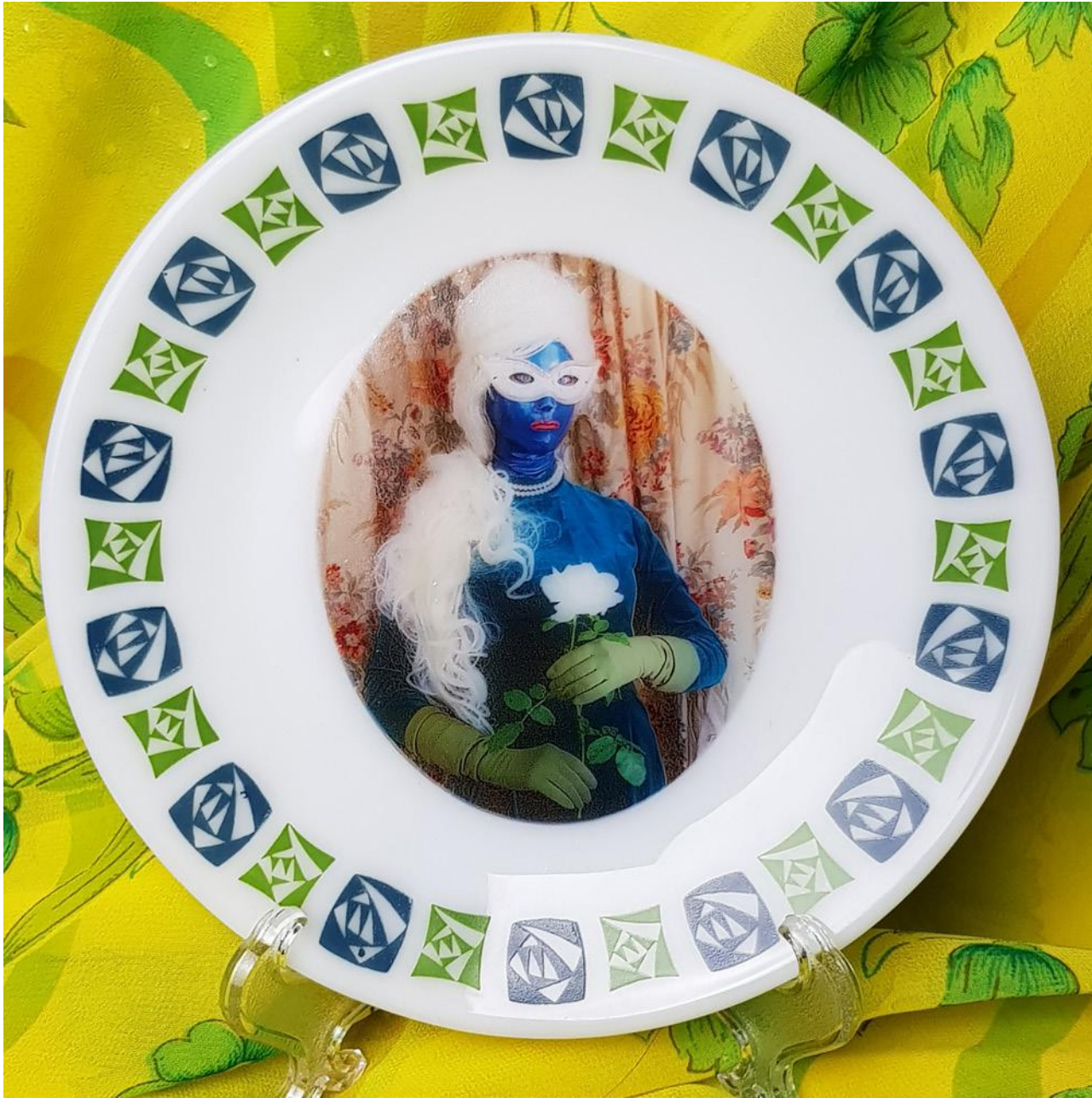
Miss Meatface: Desiree's Rose No. 4, 2019 Vintage china plate with photo transfer Set of 2 6.5" diameter