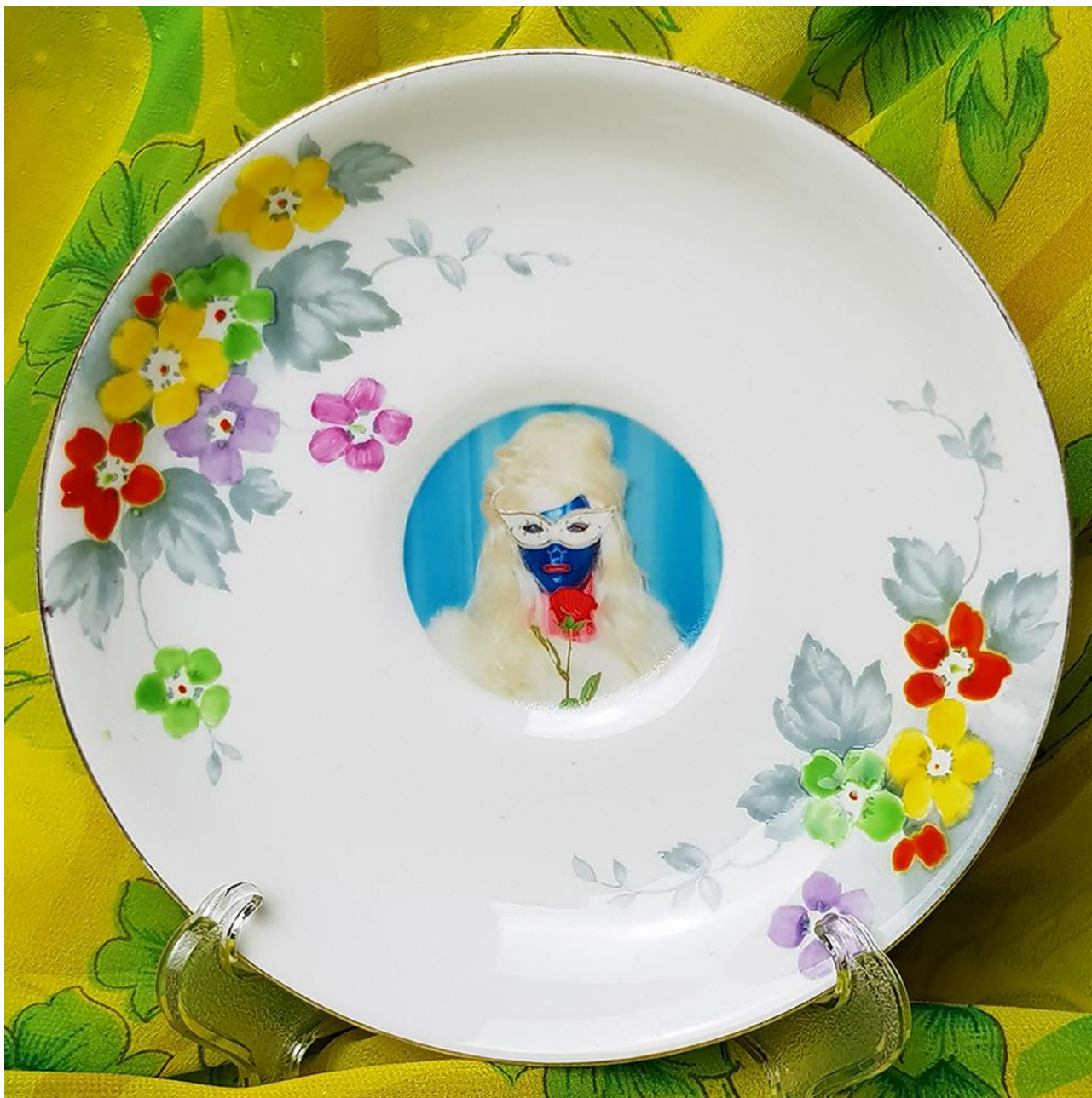
Miss Meatface: Mae West, 2018 Vintage china plate with photo transfer Unique 5.75" diameter