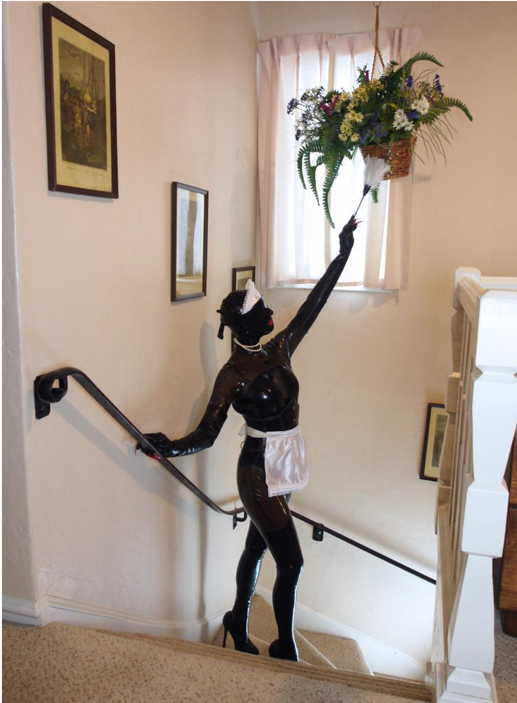
Dusting, 2017 Archival Ink Jet Print on Metallic Paper Limited Edition of 3 Art 12" x 16", Framed 17" x 21"