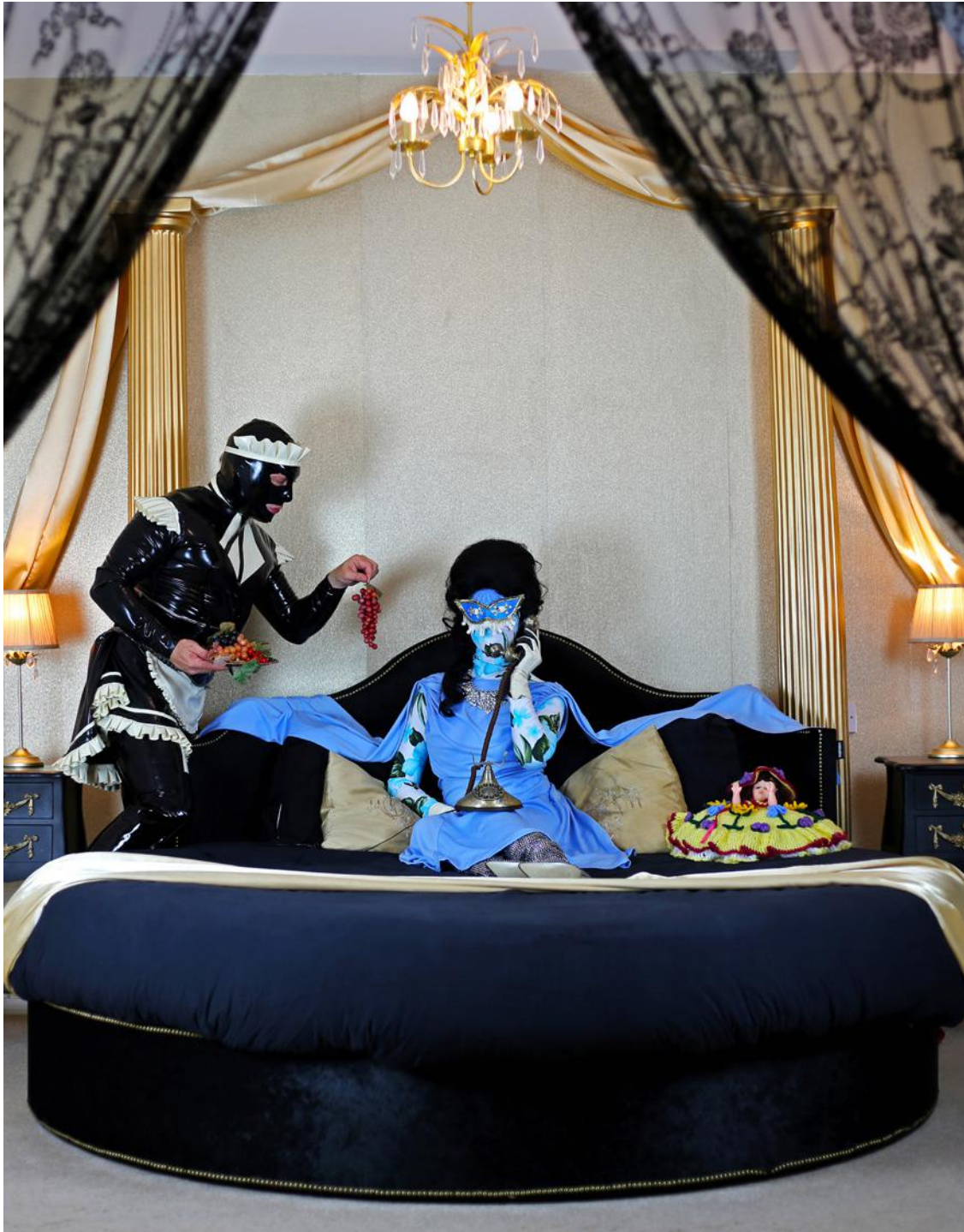
Working From Bed, 2019 Photography Printed on Aluminum with Archival Ink Limited Edition of 3 20" x 16"