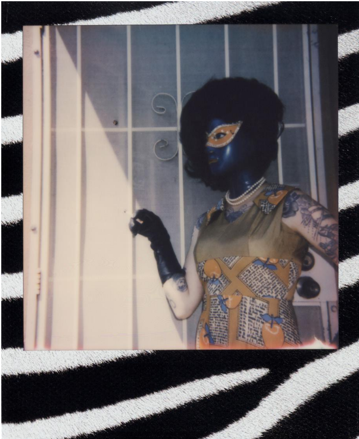
Miss Meatface: Summer, 2016 Polaroid photograph in vintage frame Unique 4.2" x 3.5", Framed 9.5" x 7.25"