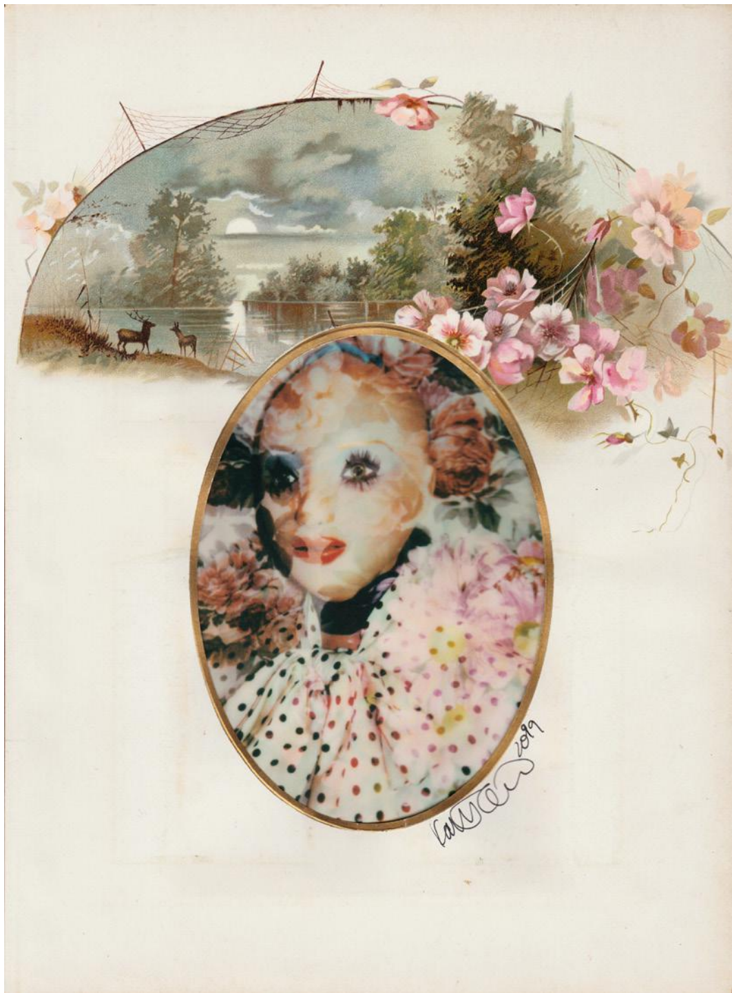
Stephanie Adored Polka Dots, 2019 Antique Victorian photo album page with c-type print, framed Unique Art 8.25" x 11.6", Framed 13" x 17"