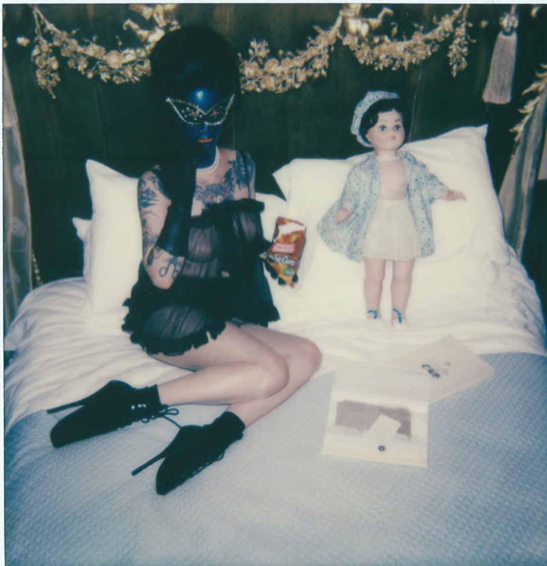
Miss Meatface: Sweets, 2016 Polaroid photograph in vintage frame Unique Art 4.233" x 3.483", Framed 10.5" x 9.5"