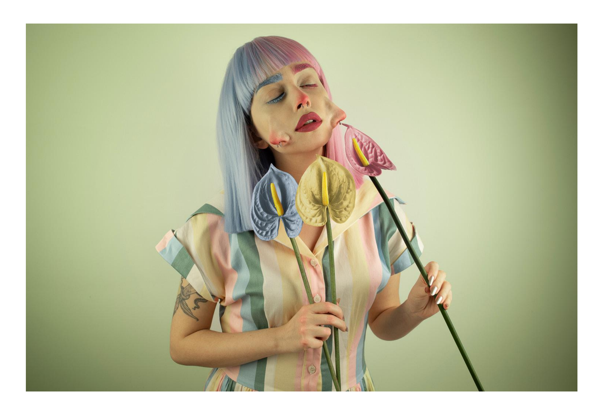
Triple Smell, 2021 Aluminium Dibond Mounted Print, Giclée Fuji Metallic Paper, High Gloss Lamination 24 x 16 in