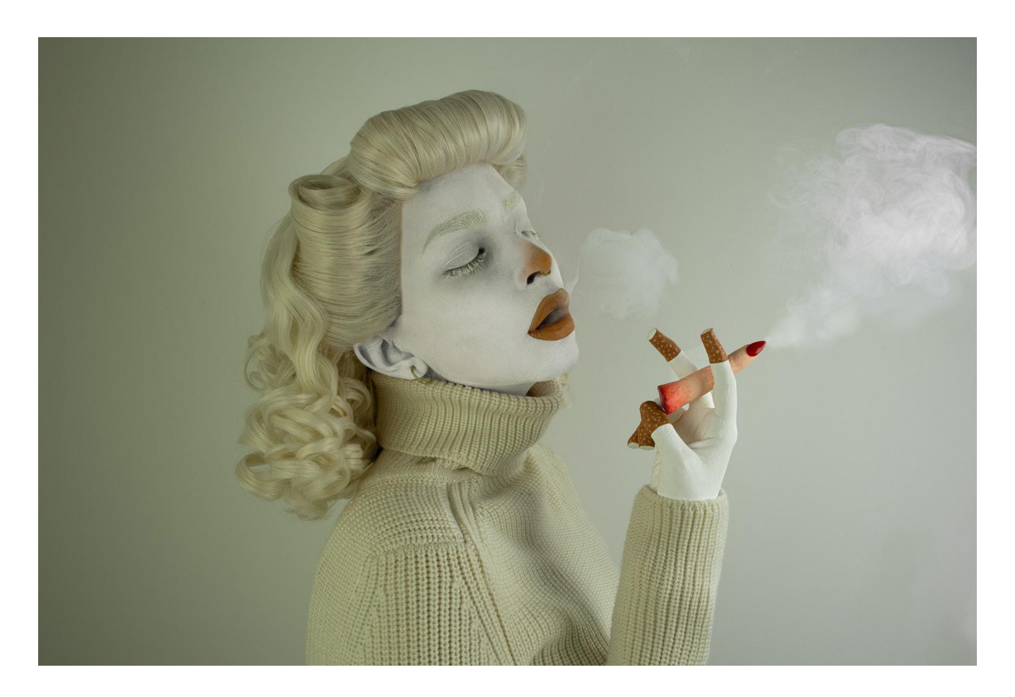
In a Parallel Universe, 2021 Aluminium Dibond Mounted Print, Giclée Fuji Metallic Paper, High Gloss Lamination 30 x 20 in