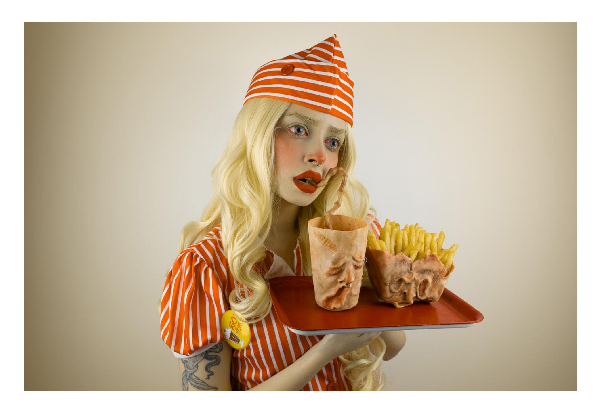
100% fresh meat, 2019 Aluminium Dibond Mounted Print, Giclée Fuji Metallic Paper, High Gloss Lamination 24 x 16 in