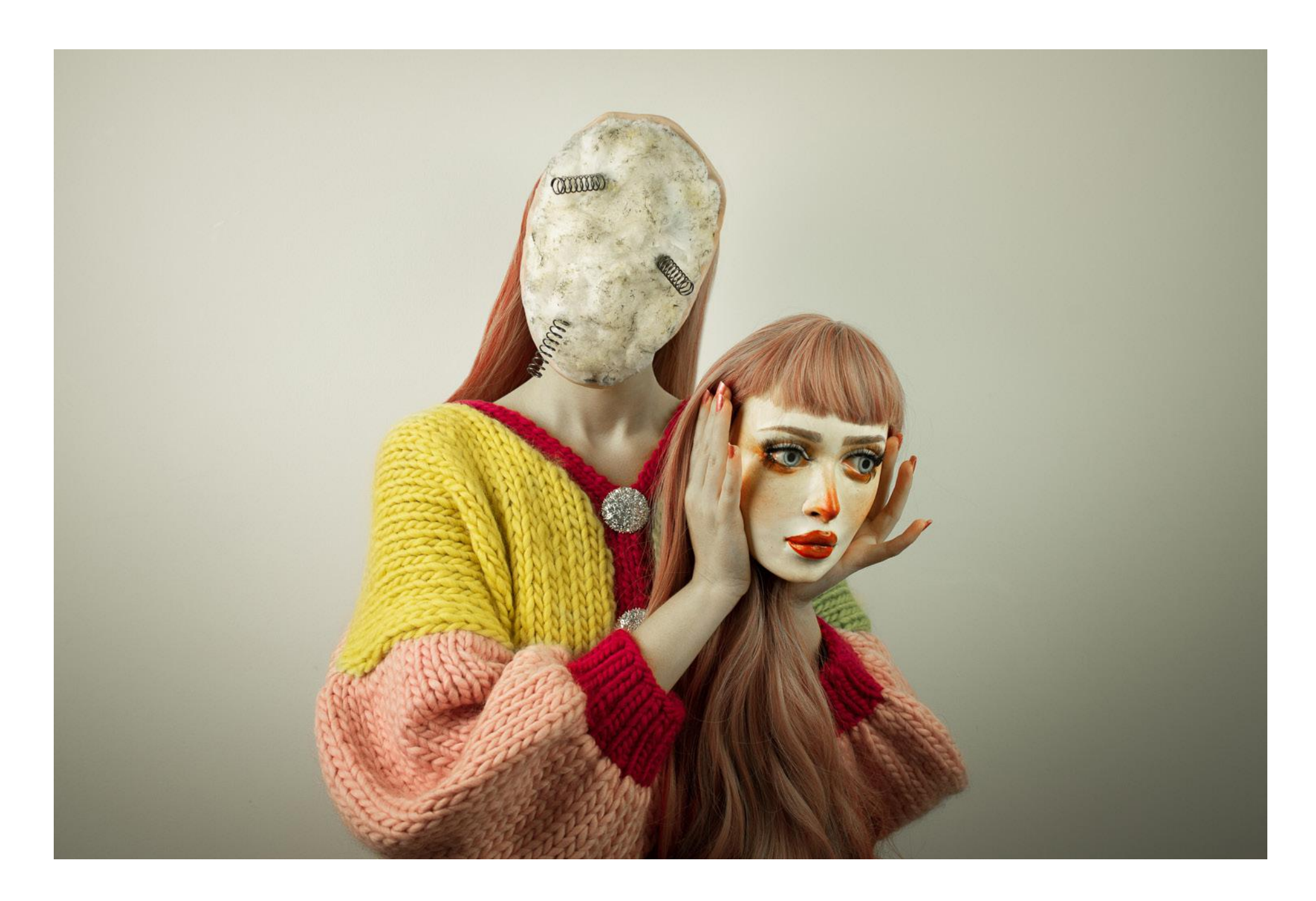
99% cotton 1% soul, 2020 Aluminium Dibond Mounted Print, Giclée Fuji Metallic Paper, High Gloss Lamination 24 x 16 in