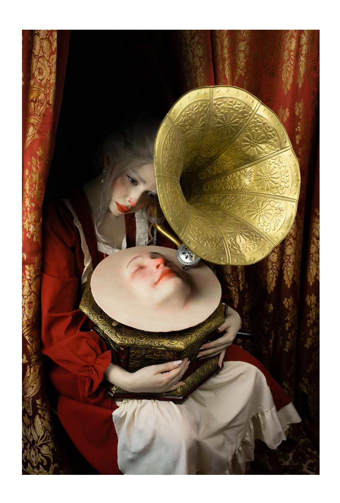
My Favourite Music, 2022 Aluminium Dibond Mounted Print, Giclée Fuji Metallic Paper, High Gloss Lamination 20 x 30 in