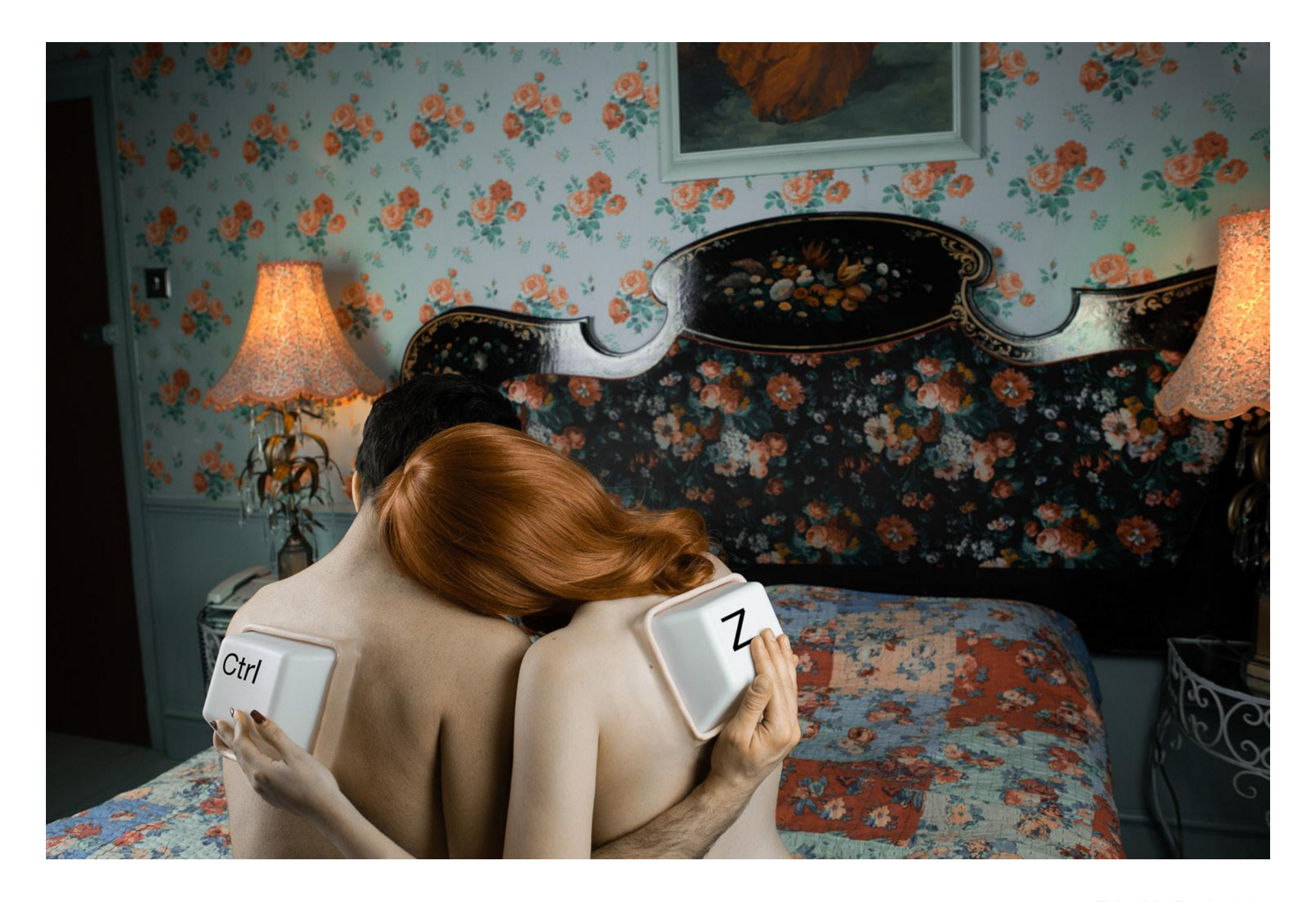
Take Me Back, 2020 Aluminium Dibond Mounted Print, Giclée Fuji Metallic Paper, High Gloss Lamination 30 x 20 in