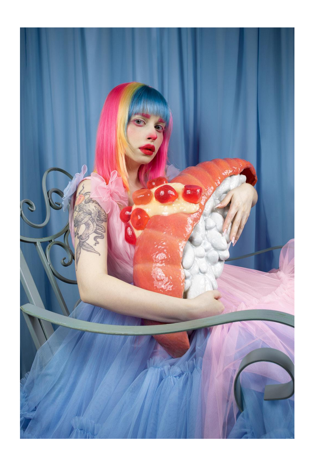
Tasty Dreams, 2022 Aluminium Dibond Mounted Print, Giclée Fuji Metallic Paper, High Gloss Lamination 16 x 24 in