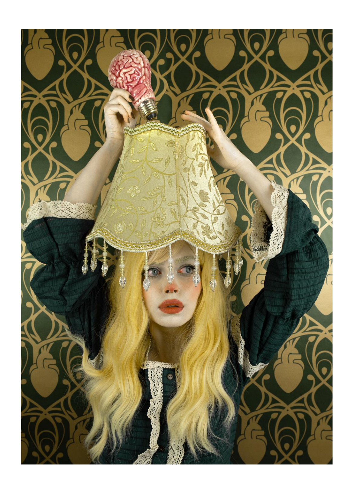
The Origin of Ideas, 2021 Aluminium Dibond Mounted Print, Giclée Fuji Metallic Paper, High Gloss Lamination 16 x 24 in