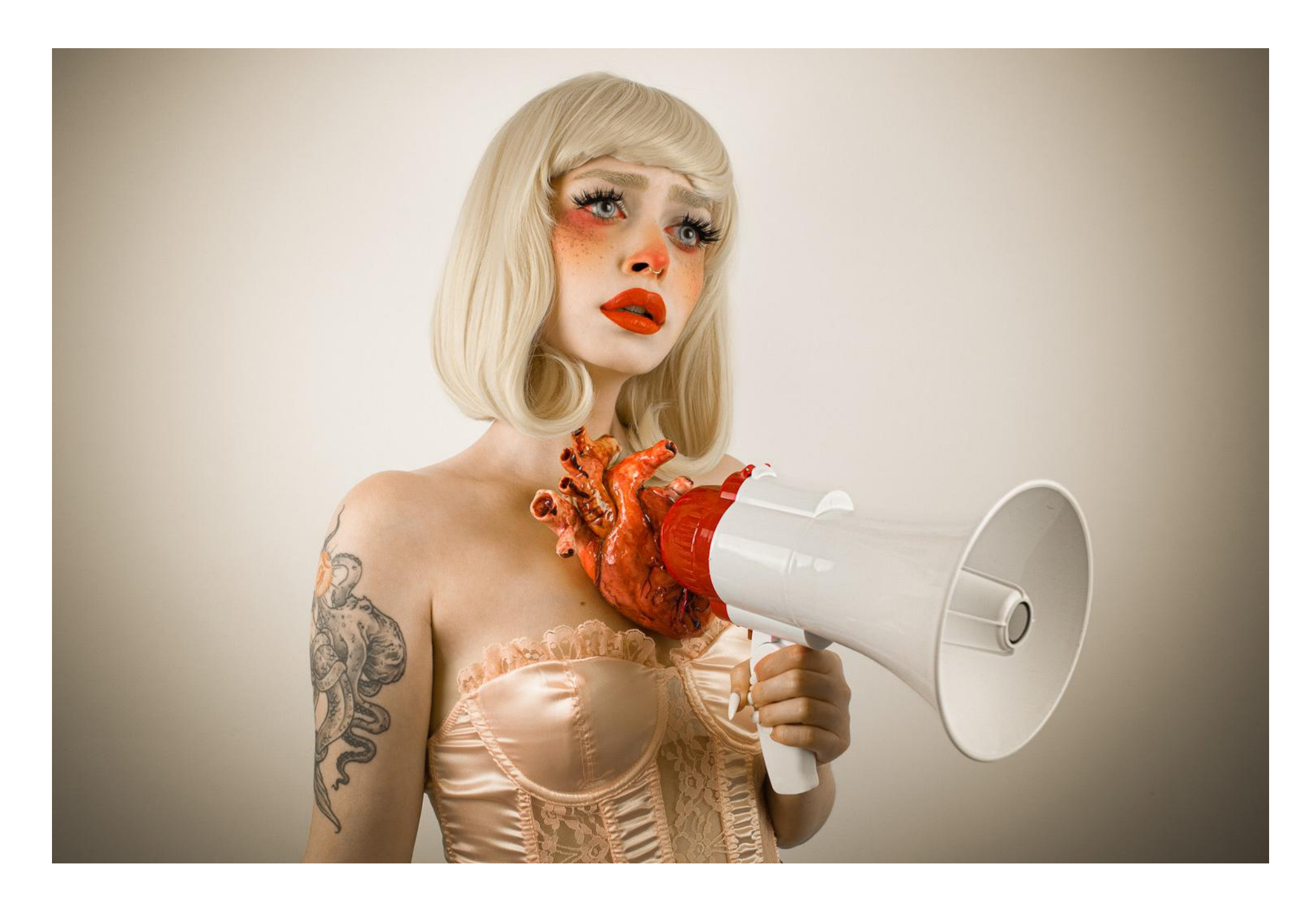
Speak from the Heart, 2019 Aluminium Dibond Mounted Print, Giclée Fuji Metallic Paper, High Gloss Lamination 24 x 16 in