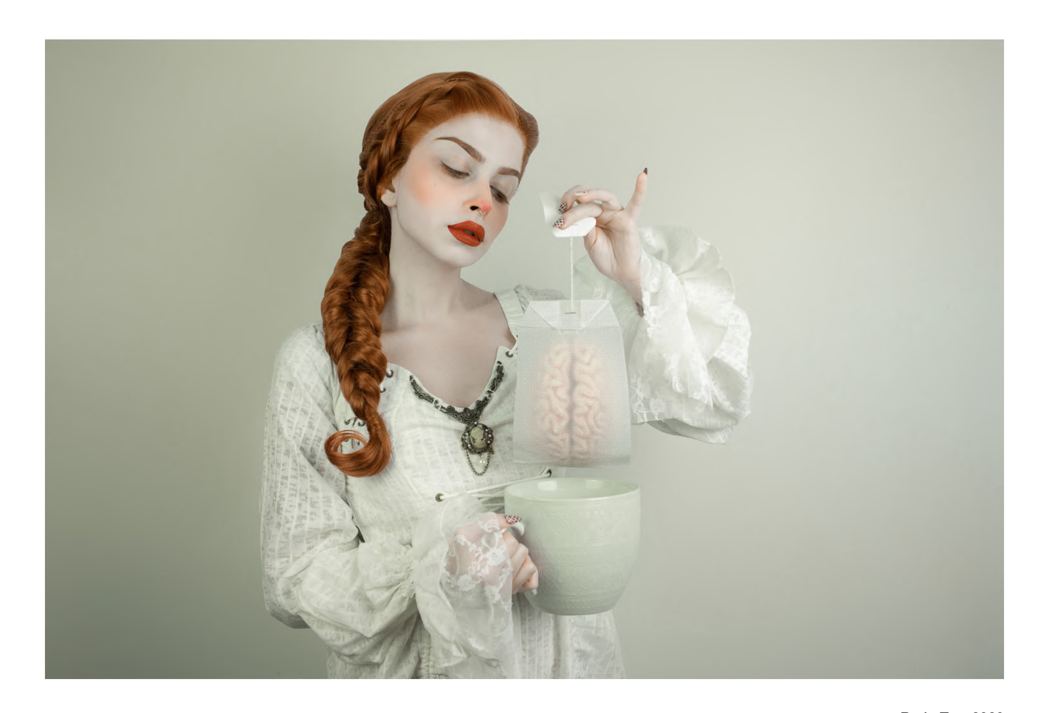
Brain Tea, 2020 Aluminium Dibond Mounted Print, Giclée Fuji Metallic Paper, High Gloss Lamination 24 x 16 in