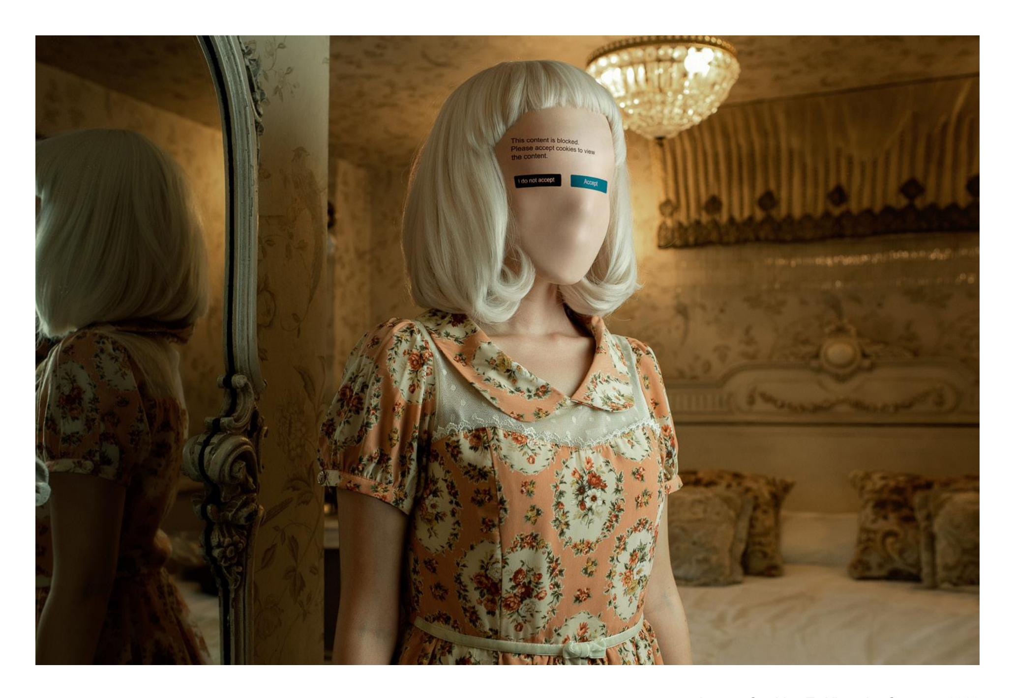
Accept Cookies To View the Content, 2020 Aluminium Dibond Mounted Print, Giclée Fuji Metallic Paper, High Gloss Lamination 24 x 16 in