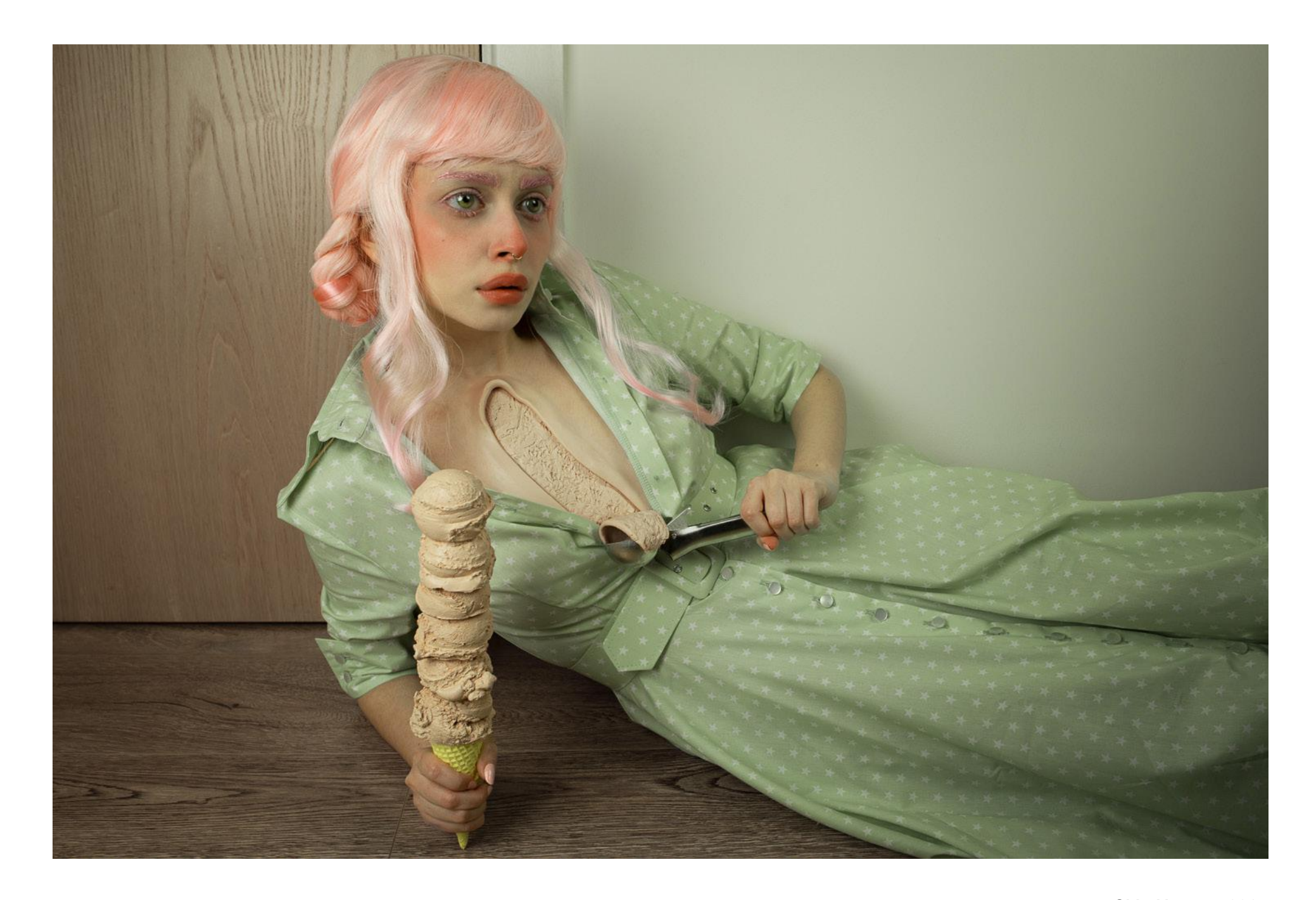
Skin Hunger, 2021 Aluminium Dibond Mounted Print, Giclée Fuji Metallic Paper, High Gloss Lamination 24 x 16 in