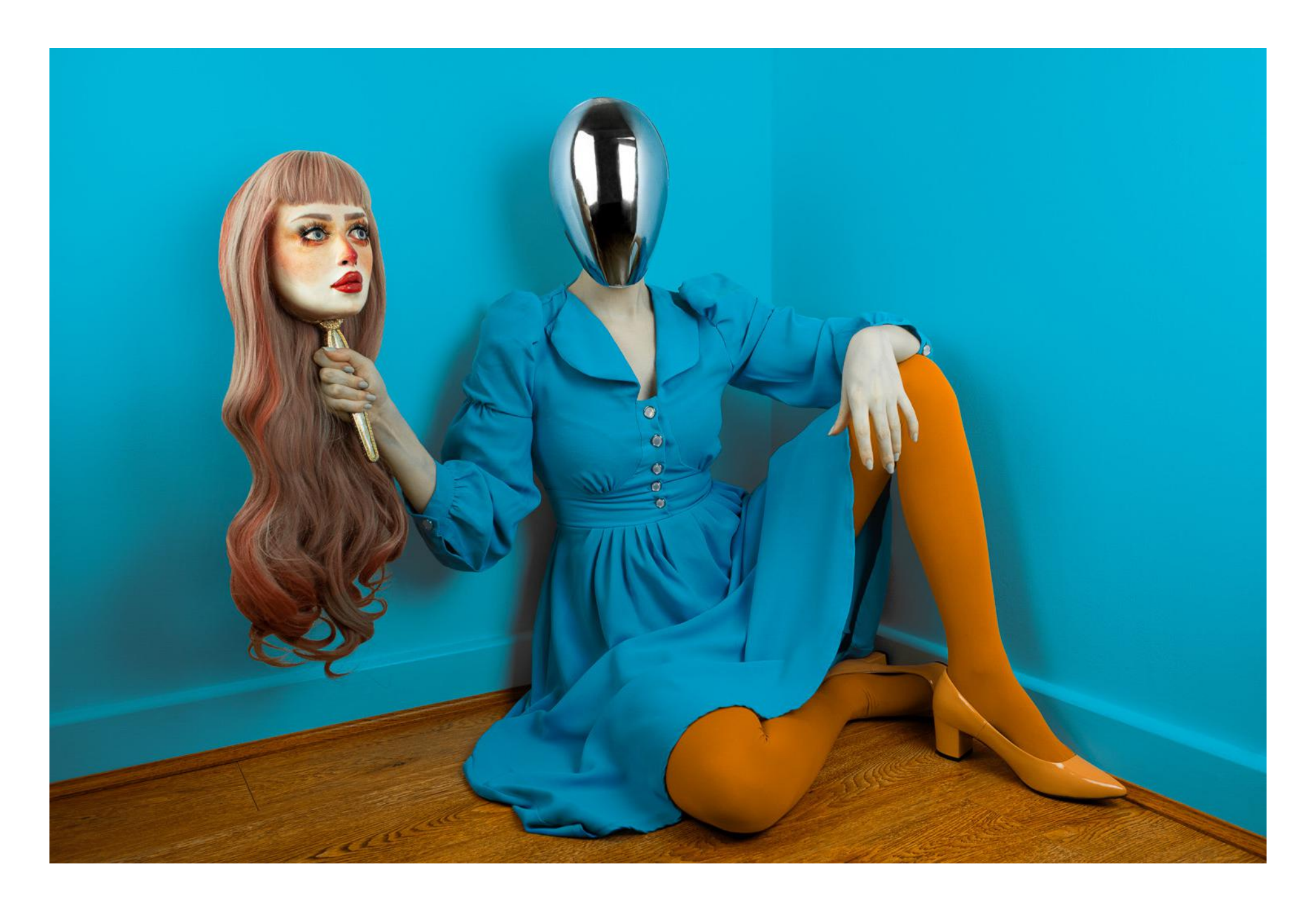
The Reflection of Yourself, 2021 Aluminium Dibond Mounted Print, Giclée Fuji Metallic Paper, High Gloss Lamination 24 x 16 in