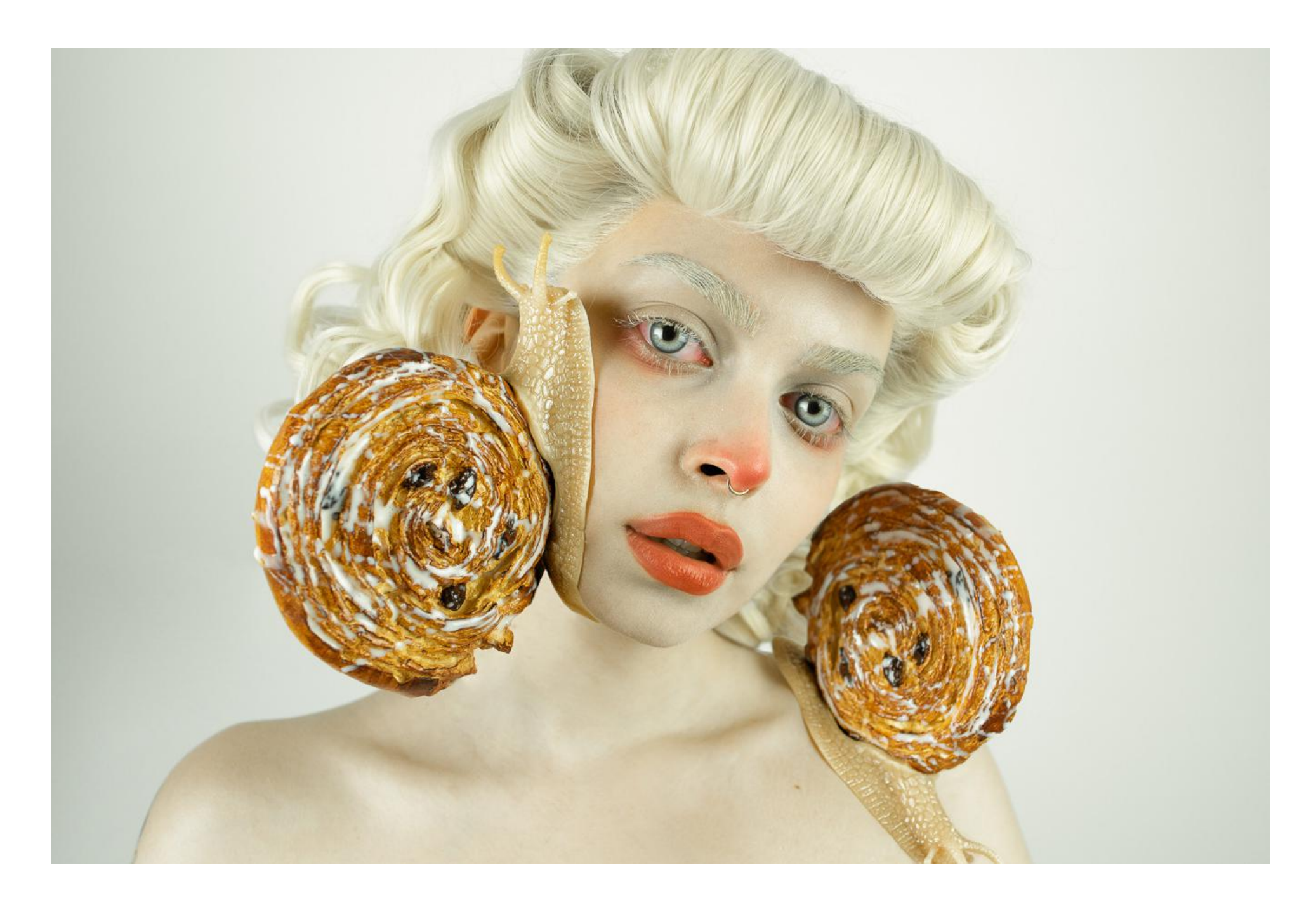
Glazed Look, 2021 Aluminium Dibond Mounted Print, Giclée Fuji Metallic Paper, High Gloss Lamination 24 x 16 in