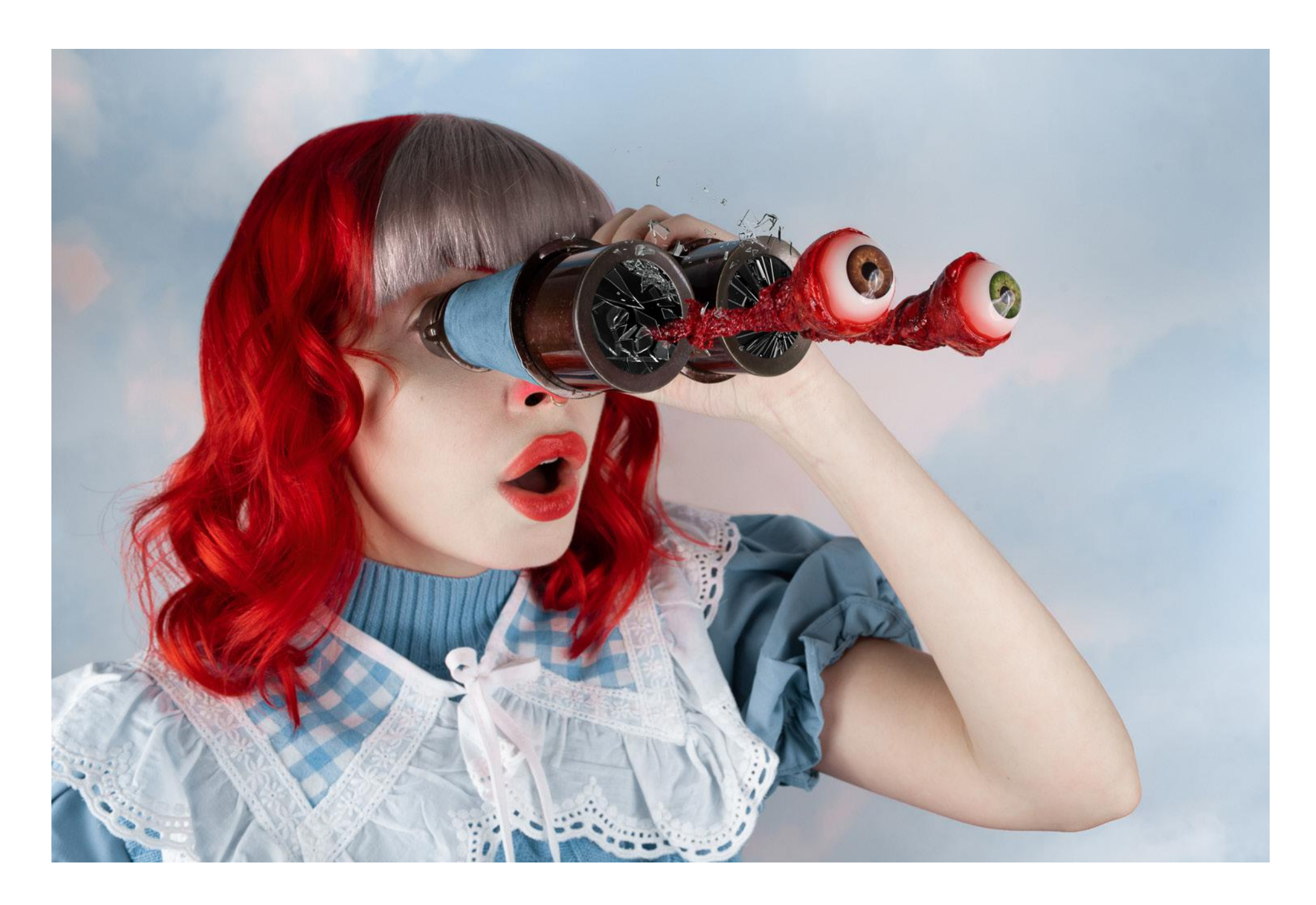
Can't believe my eyes, 2021 Aluminium Dibond Mounted Print, Giclée Fuji Metallic Paper, High Gloss Lamination 24 x 16 in