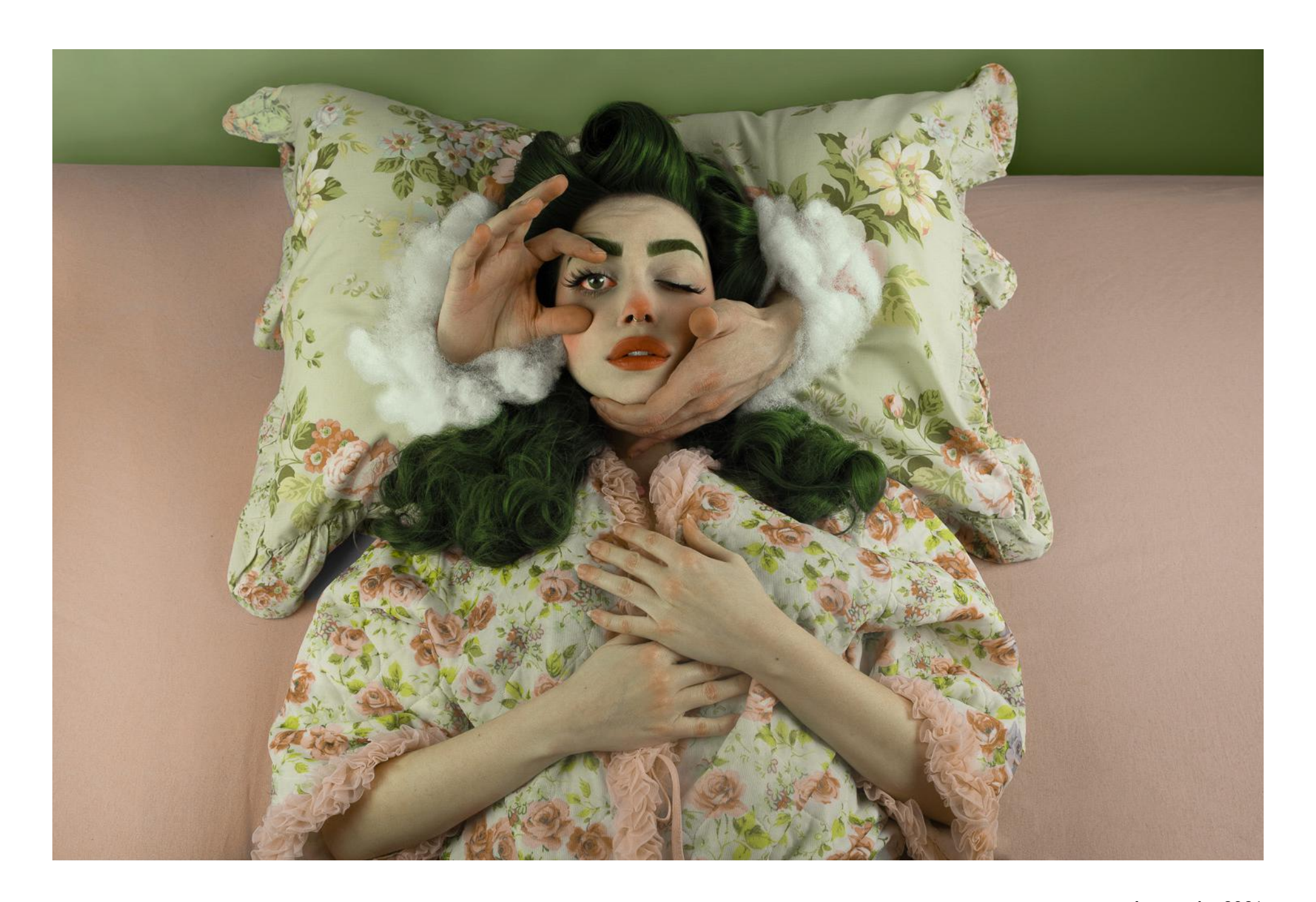
Insomnia, 2021 Aluminium Dibond Mounted Print, Giclée Fuji Metallic Paper, High Gloss Lamination 24 x 16 in