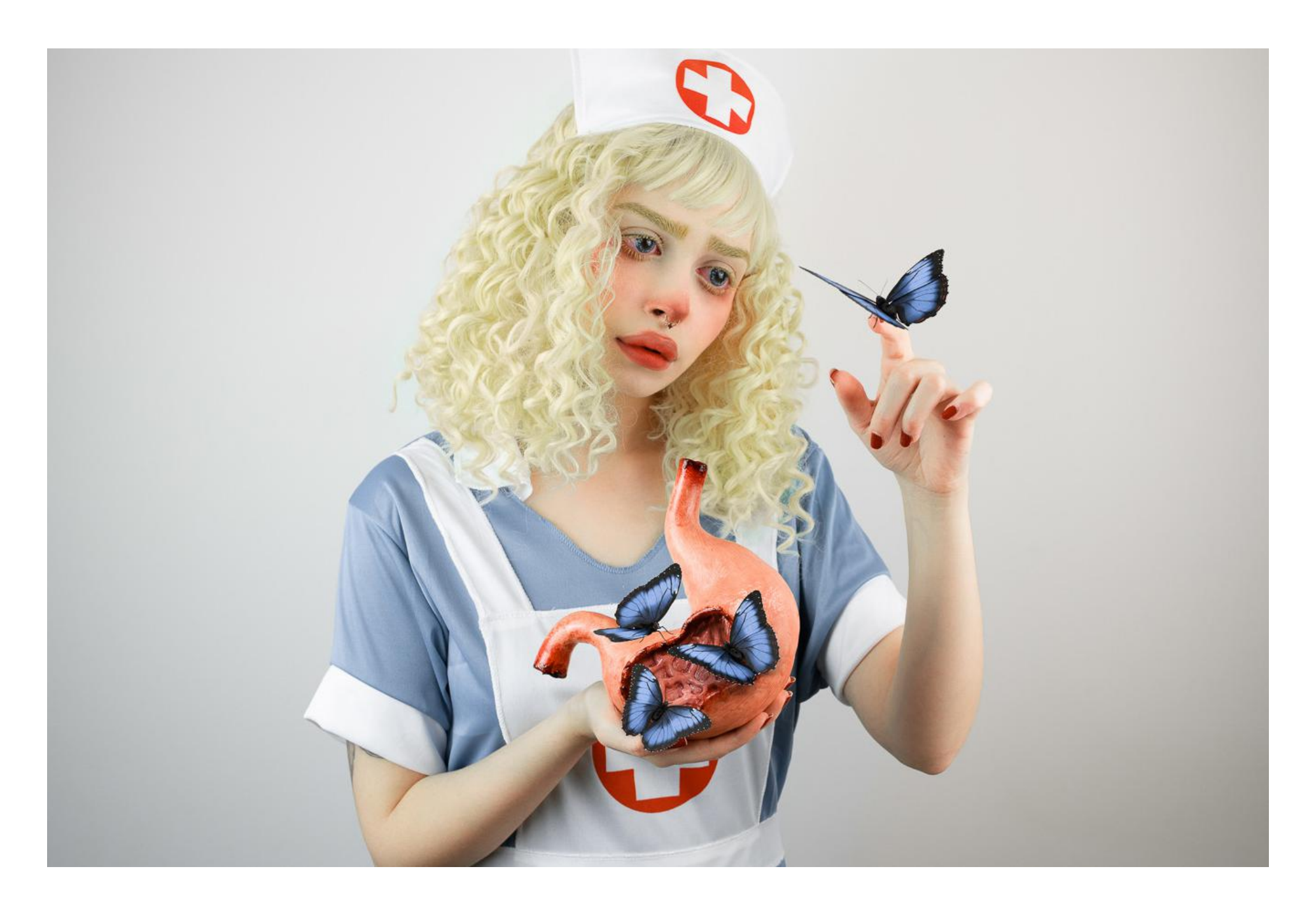
Butterflies in the Stomach, 2019 Aluminium Dibond Mounted Print, Giclée Fuji Metallic Paper, High Gloss Lamination 24 x 16 in