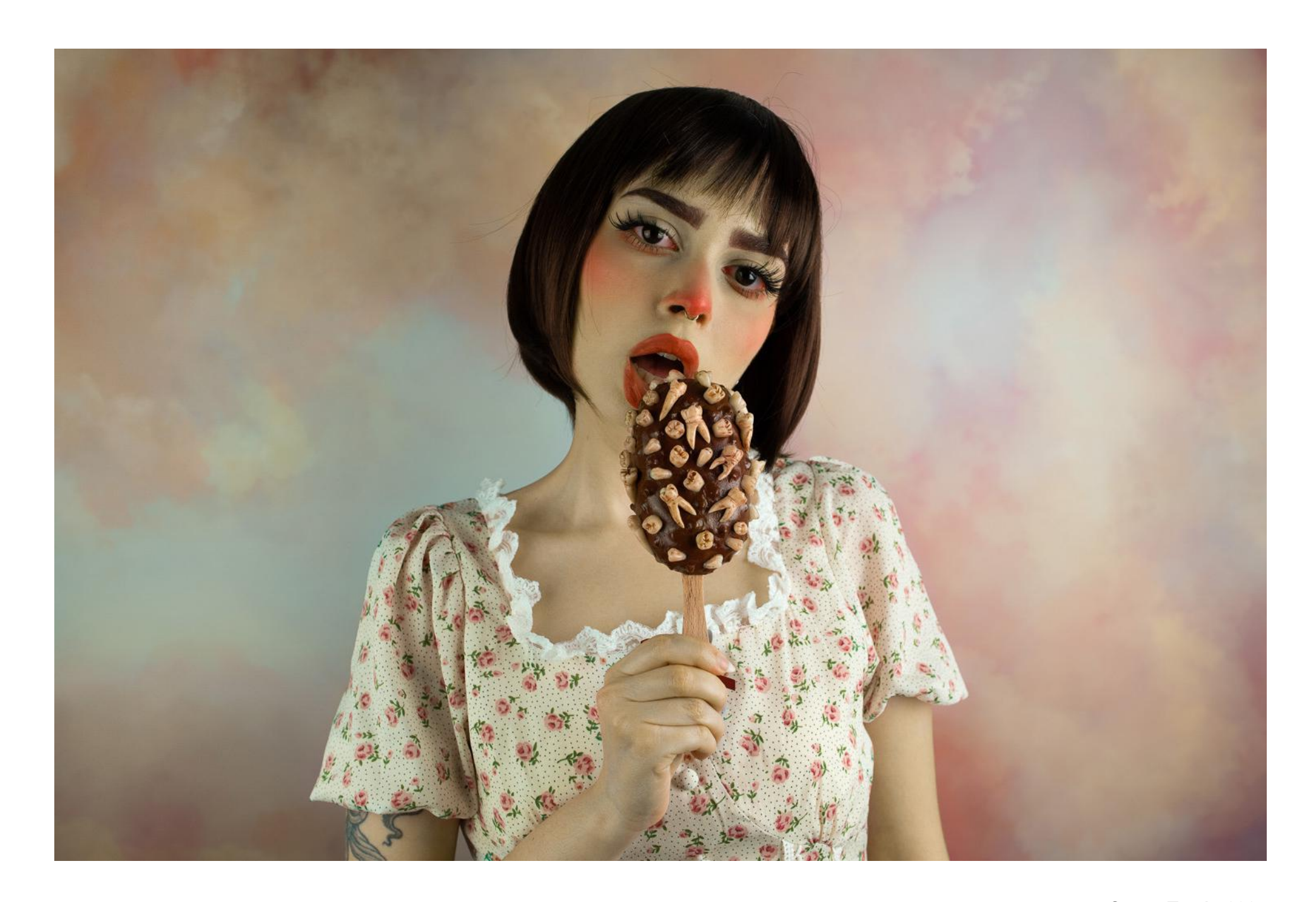
Sweet Tooth, 2021 Aluminium Dibond Mounted Print, Giclée Fuji Metallic Paper, High Gloss Lamination 24 x 16 in