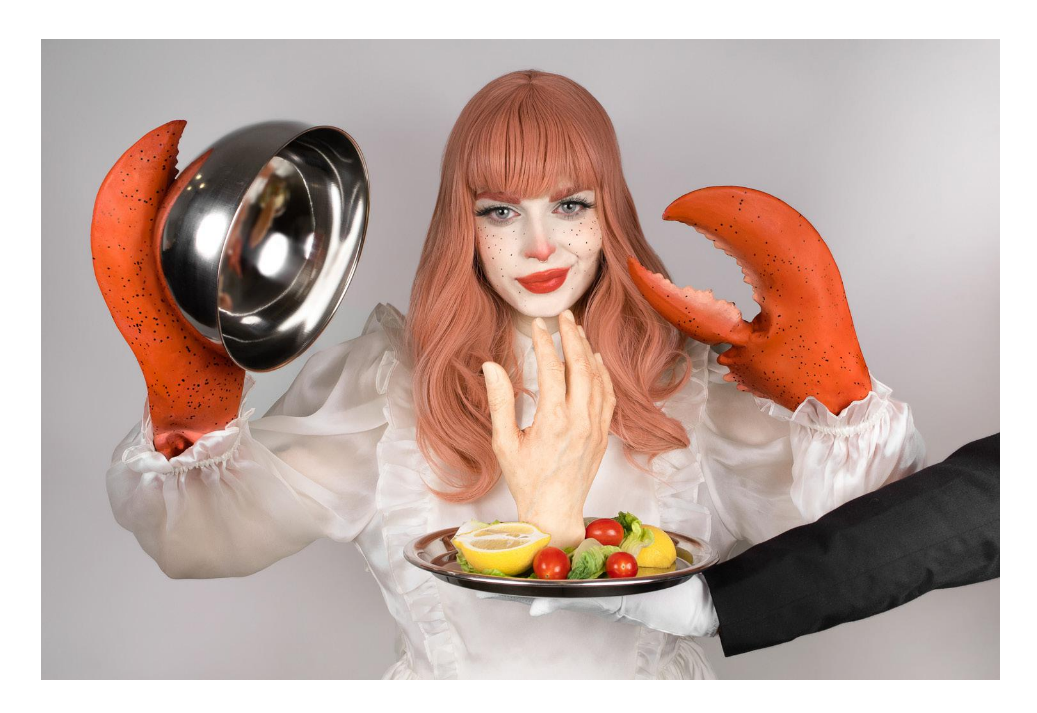
Enjoy your meal, 2022 Aluminium Dibond Mounted Print, Giclée Fuji Metallic Paper, High Gloss Lamination 24 x 16 in