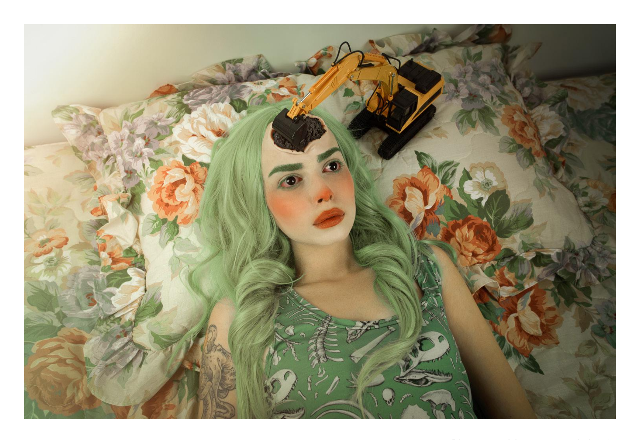
Dig out negativity from your mind, 2020 Aluminium Dibond Mounted Print, Giclée Fuji Metallic Paper, High Gloss Lamination 24 x 16 in