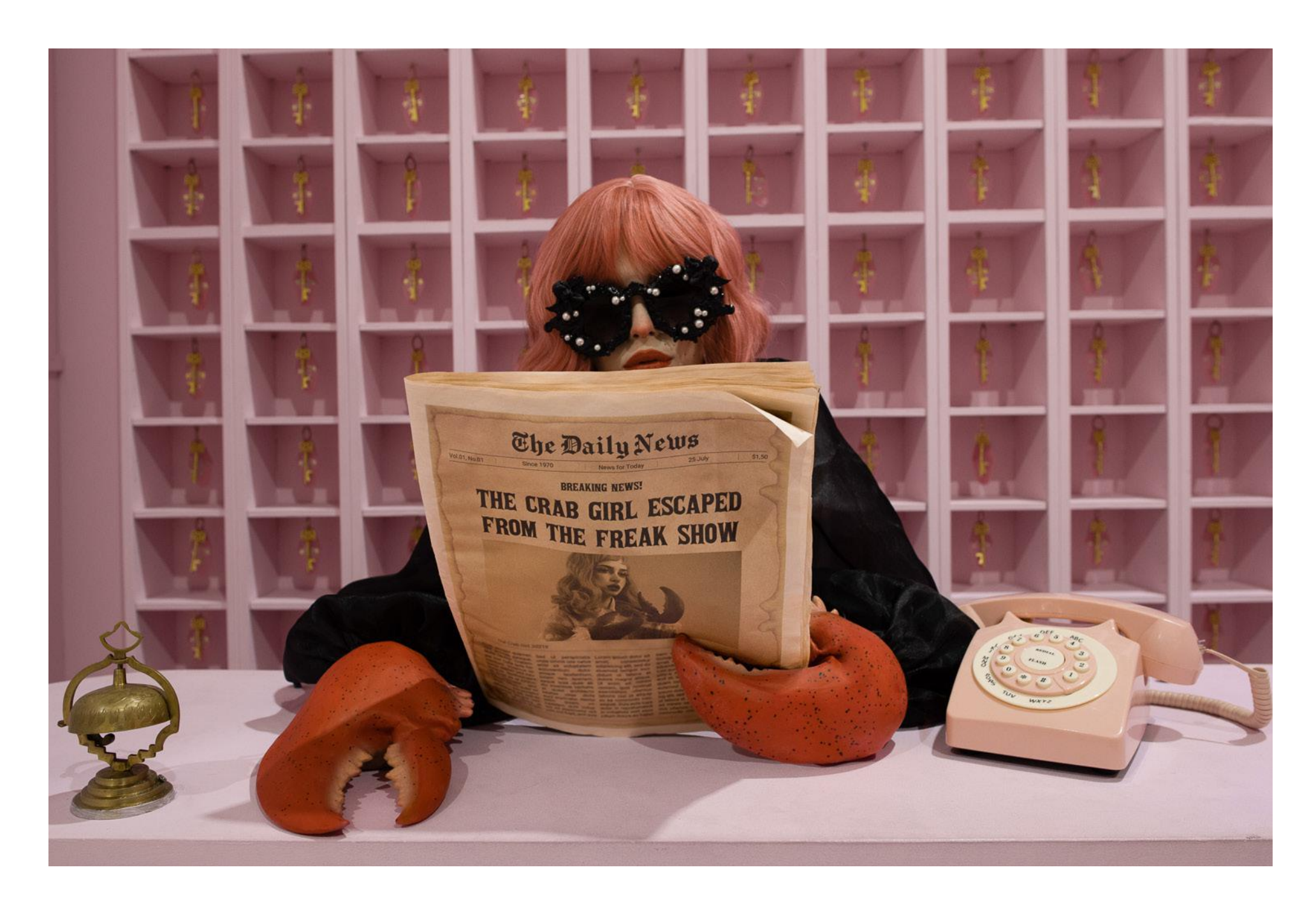
The Crab Girl Escaped from the Freak Show, 2022 Aluminium Dibond Mounted Print, Giclée Fuji Metallic Paper, High Gloss Lamination 24 x 16 in or 18 x 12 in