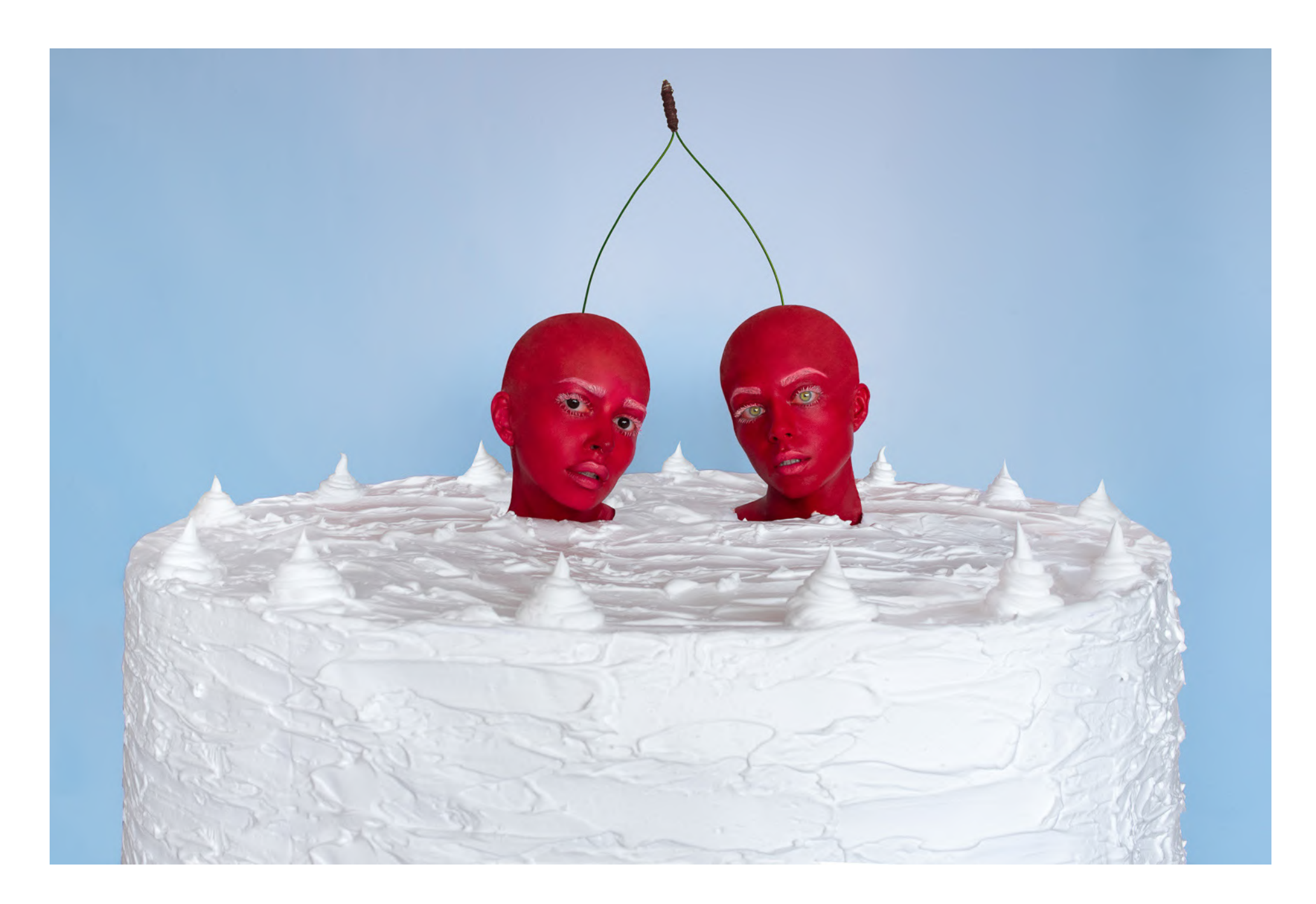
Cherries on Top, 2021 Aluminium Dibond Mounted Print, Giclée Fuji Metallic Paper, High Gloss Lamination 24 x 16 in