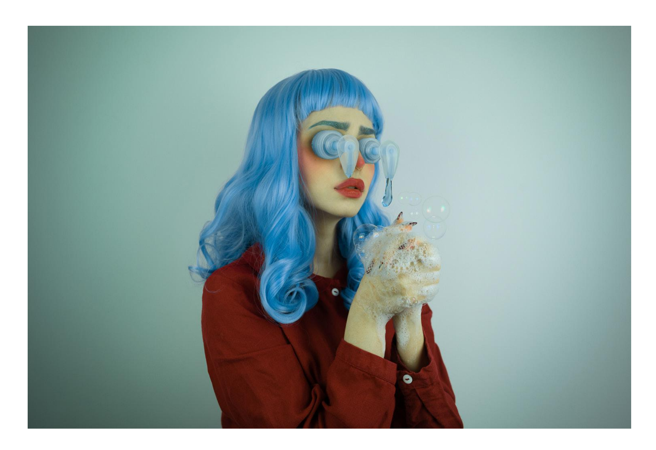
Wash your hands, 2020 Aluminium Dibond Mounted Print, Giclée Fuji Metallic Paper, High Gloss Lamination 24 x 16 in