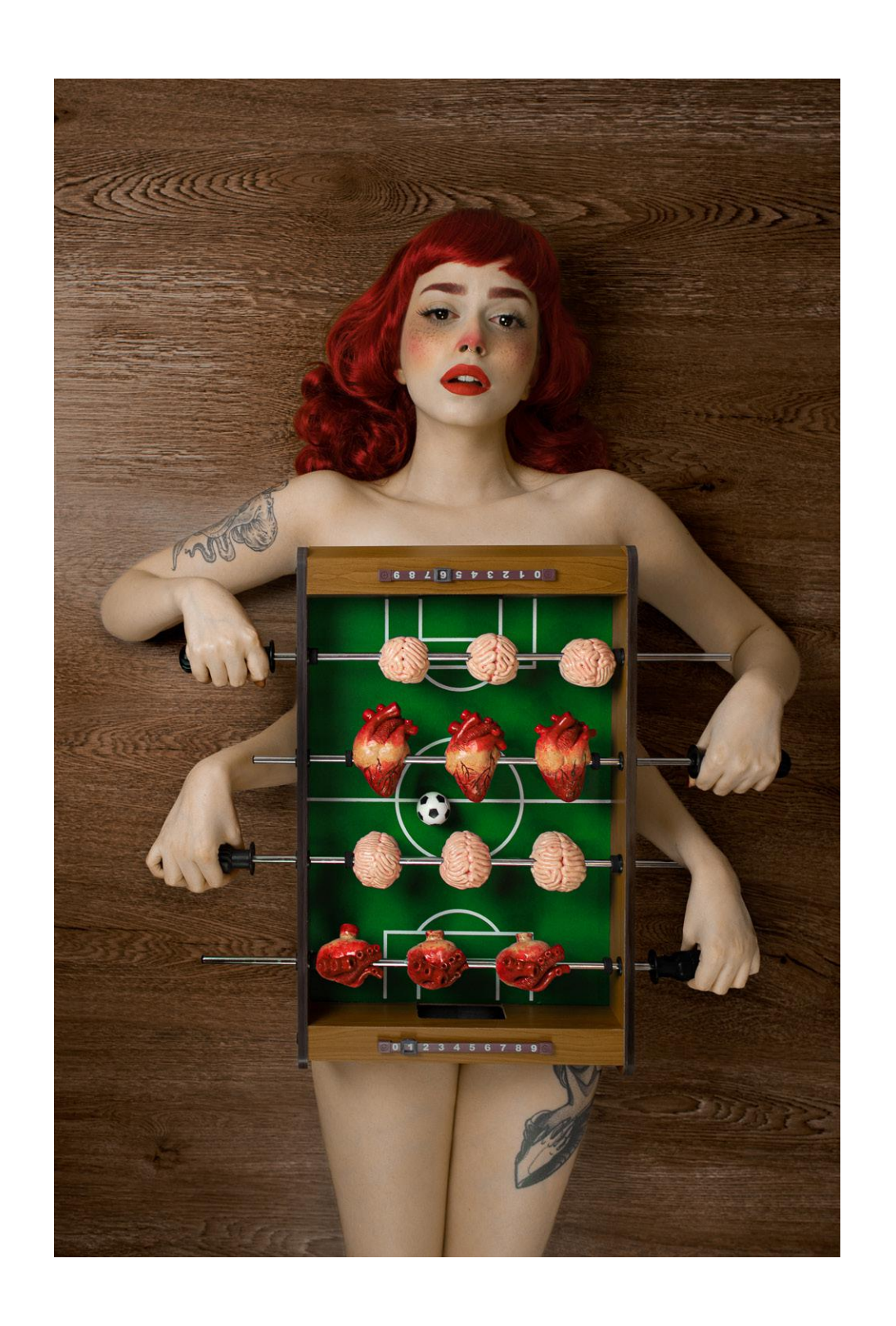
The Endless Game, 2020 Aluminium Dibond Mounted Print, Giclée Fuji Metallic Paper, High Gloss Lamination 16 x 24 in