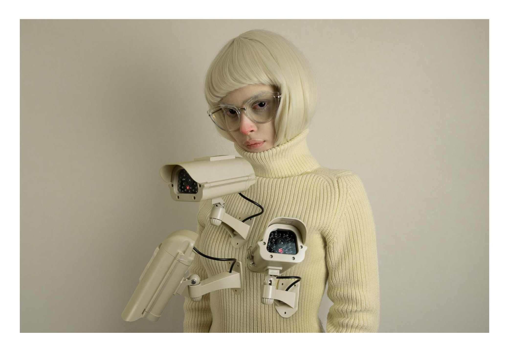
CCTV is in operation, 2020 Aluminium Dibond Mounted Print, Giclée Fuji Metallic Paper, High Gloss Lamination 24 x 16 in