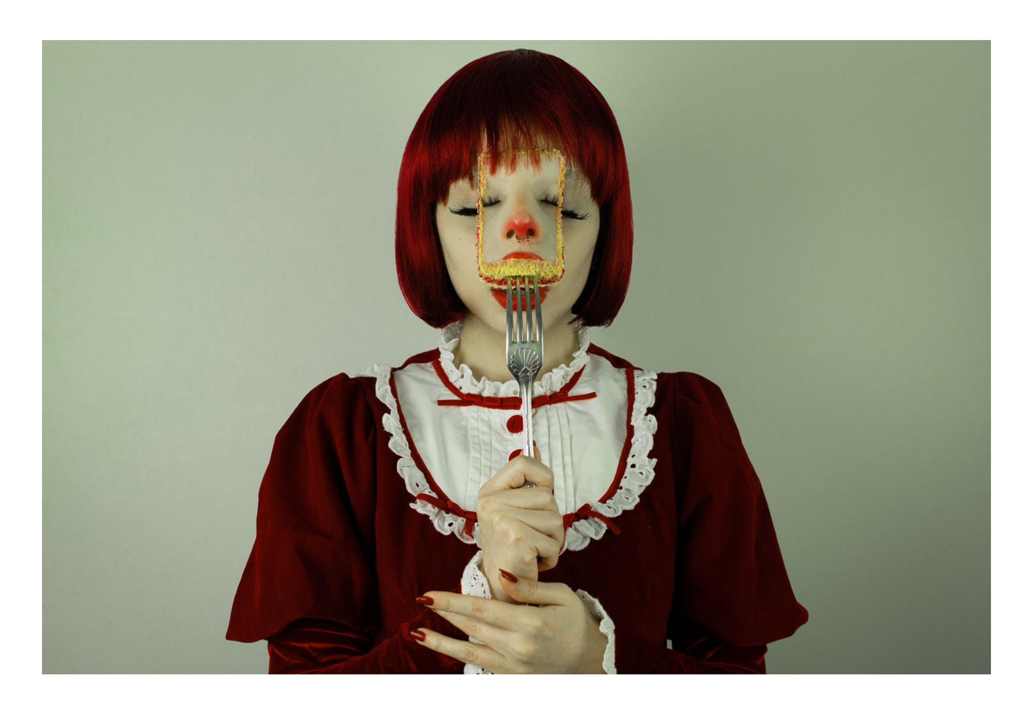
The Sweetest Piece, 2021 Aluminium Dibond Mounted Print, Giclée Fuji Metallic Paper, High Gloss Lamination 24 x 16 in