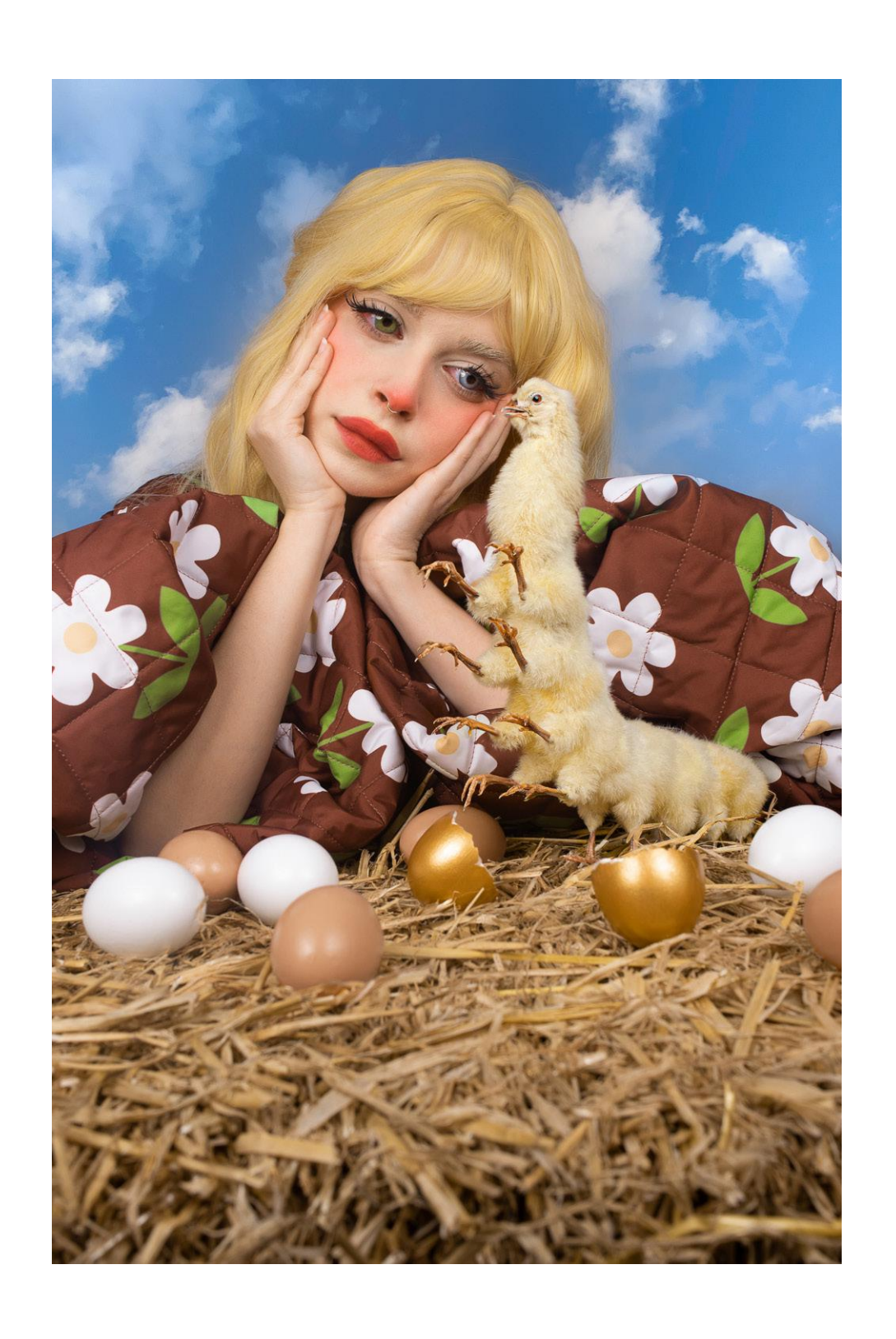
The Golden Egg, 2021 Aluminium Dibond Mounted Print, Giclée Fuji Metallic Paper, High Gloss Lamination 16 x 24 in