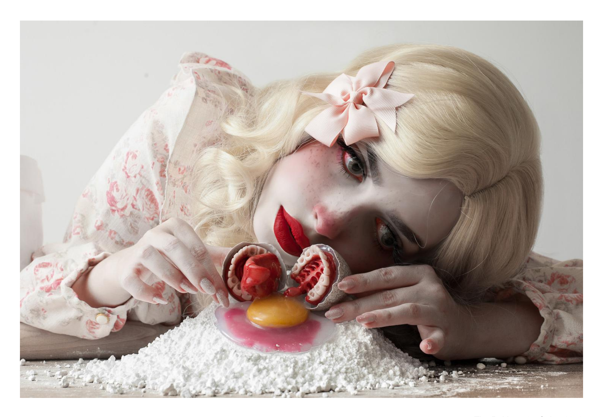
The Baking of a Cake, 2019 Aluminium Dibond Mounted Print, Giclée Fuji Metallic Paper, High Gloss Lamination 24 x 16 in