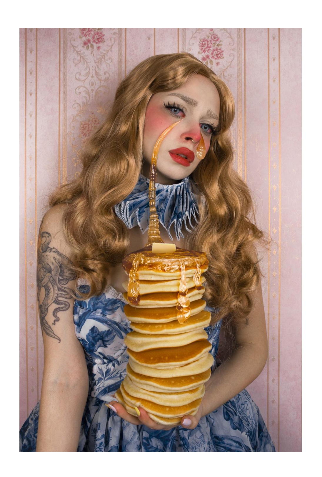
Sickly Sweet, 2021 Aluminium Dibond Mounted Print, Giclée Fuji Metallic Paper, High Gloss Lamination 16 x 24 in