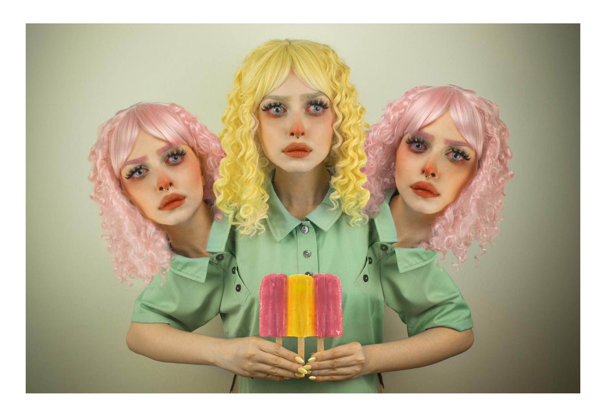
Triple Taste, 2019 Aluminium Dibond Mounted Print, Giclée Fuji Metallic Paper, High Gloss Lamination 24 x 16 in