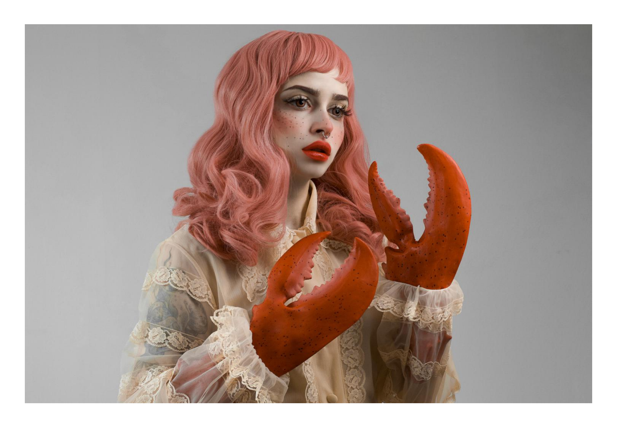
The Crab Girl, 2019 Aluminium Dibond Mounted Print, Giclée Fuji Metallic Paper, High Gloss Lamination 30 x 20 in