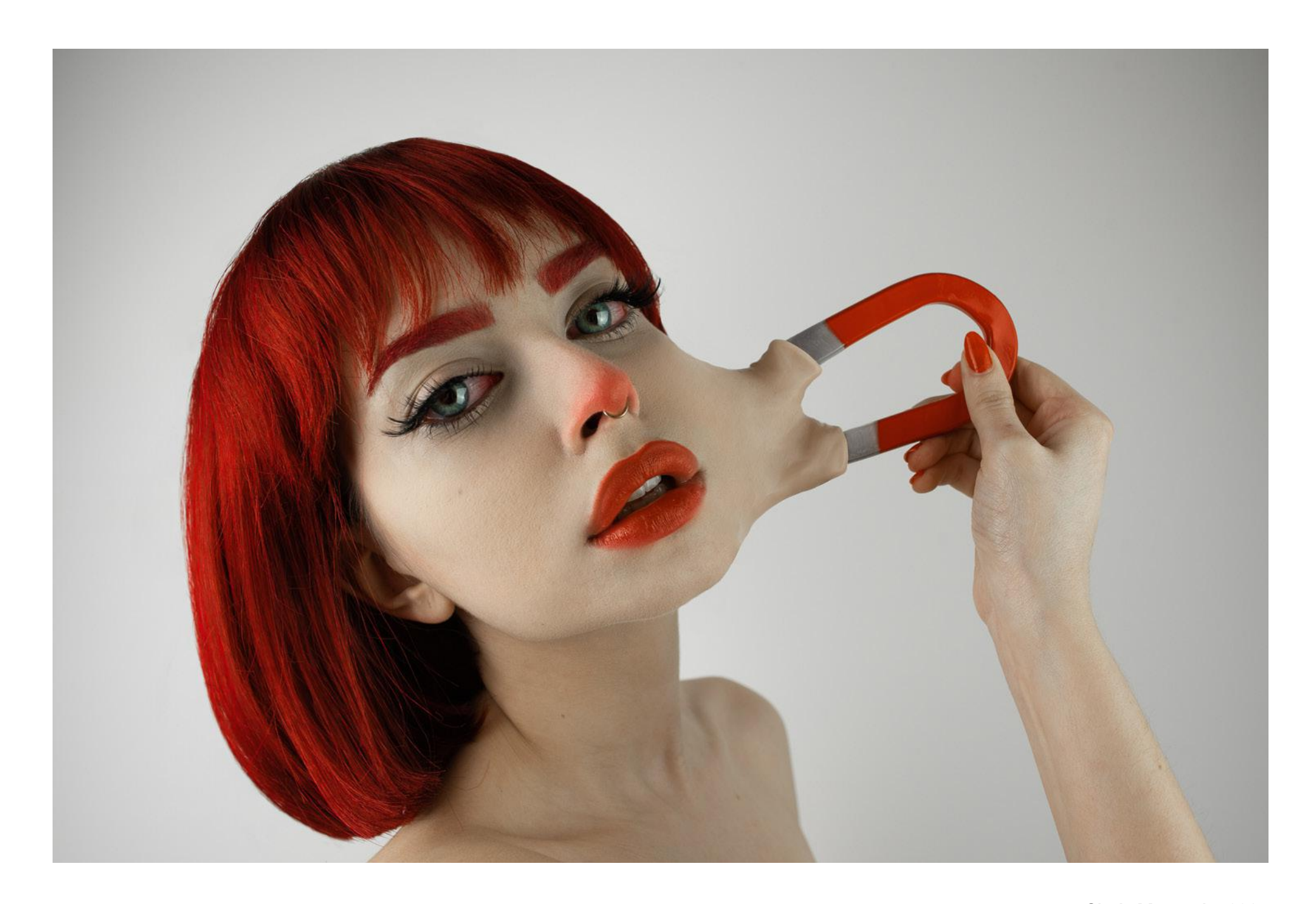
She's Magnetic, 2021 Aluminium Dibond Mounted Print, Giclée Fuji Metallic Paper, High Gloss Lamination 24 x 16 in