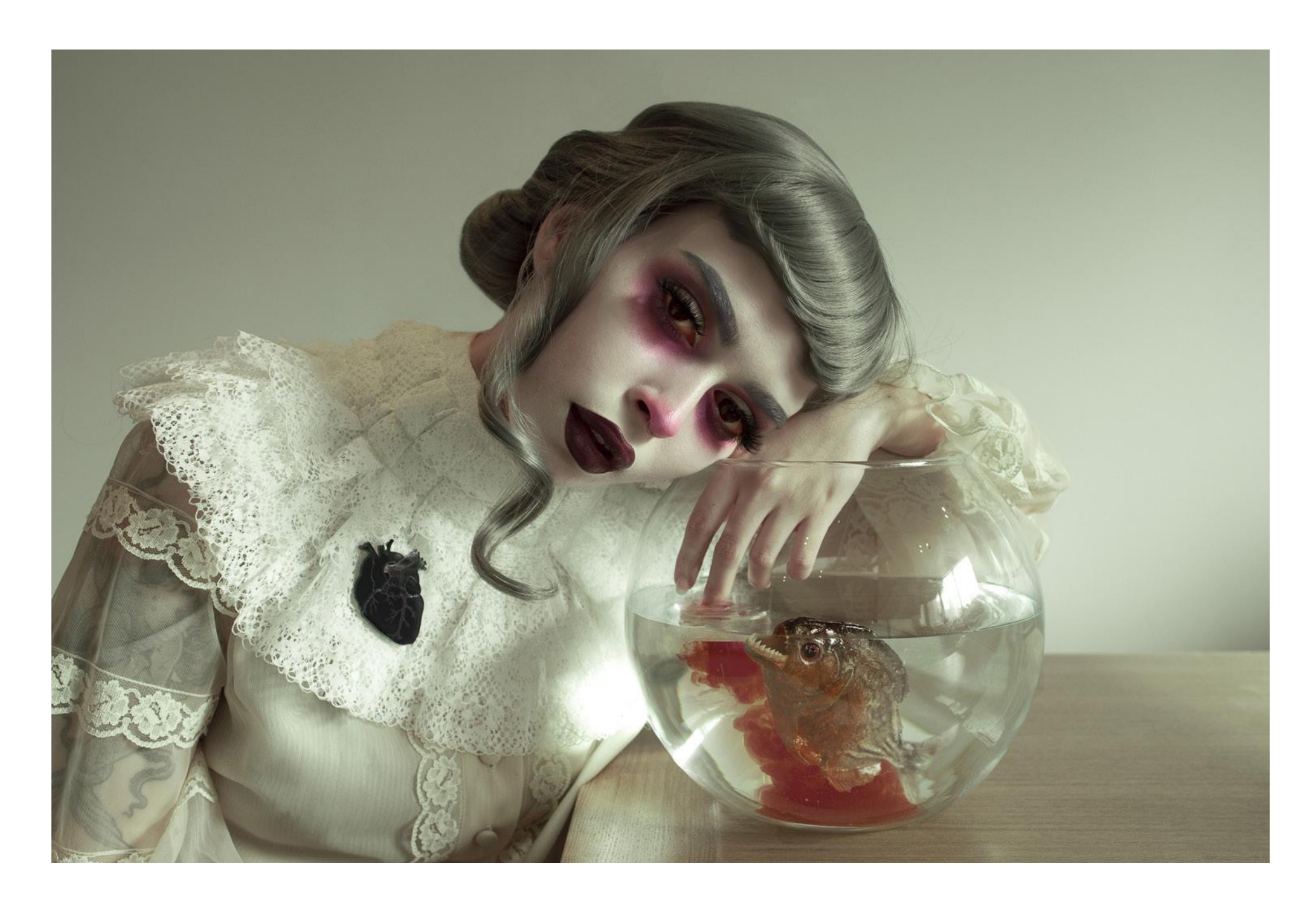
Precarious Affection, 2020 Aluminium Dibond Mounted Print, Giclée Fuji Metallic Paper, High Gloss Lamination 30 x 20 in