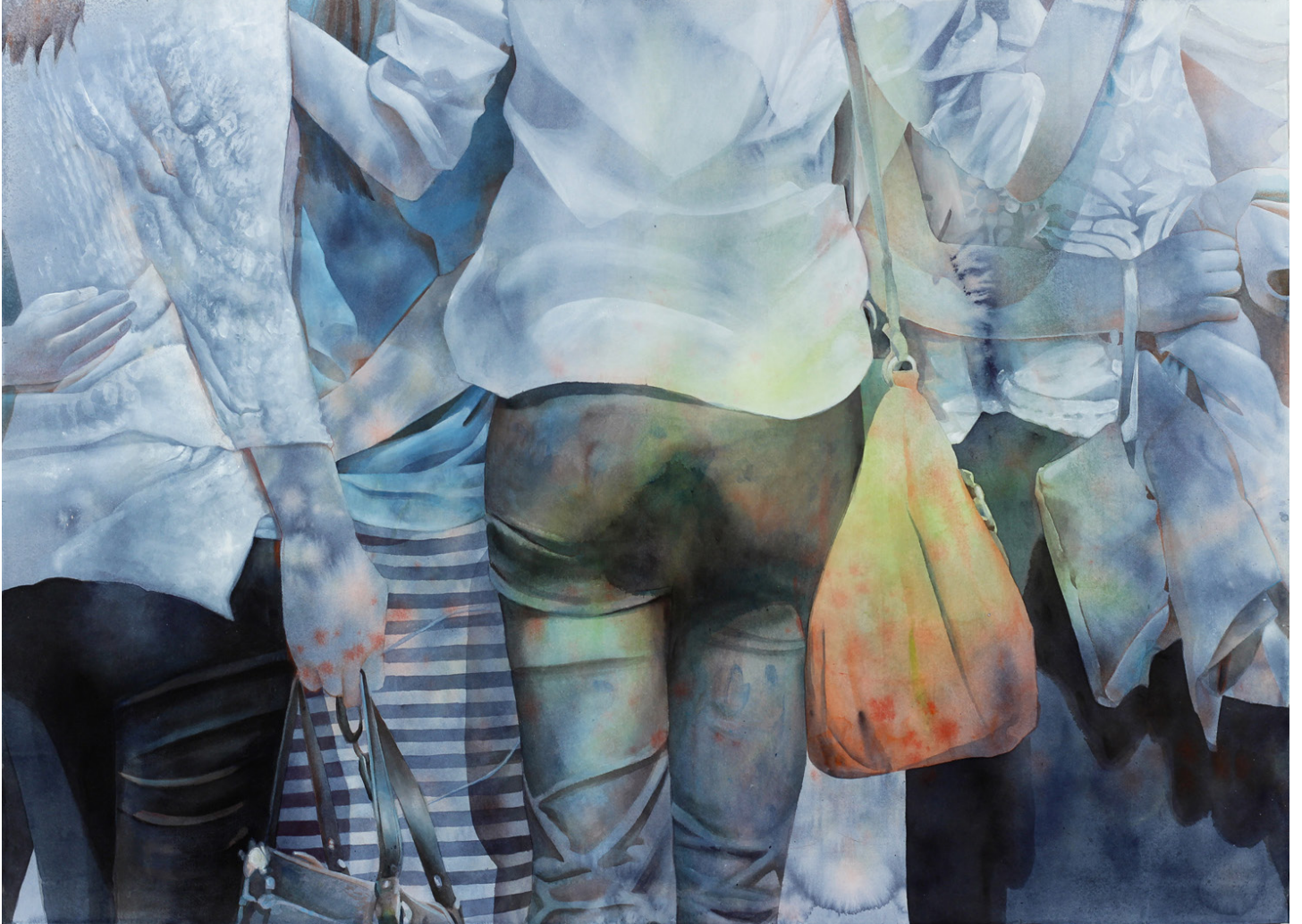
Rebecca Bird, "Circle Study"