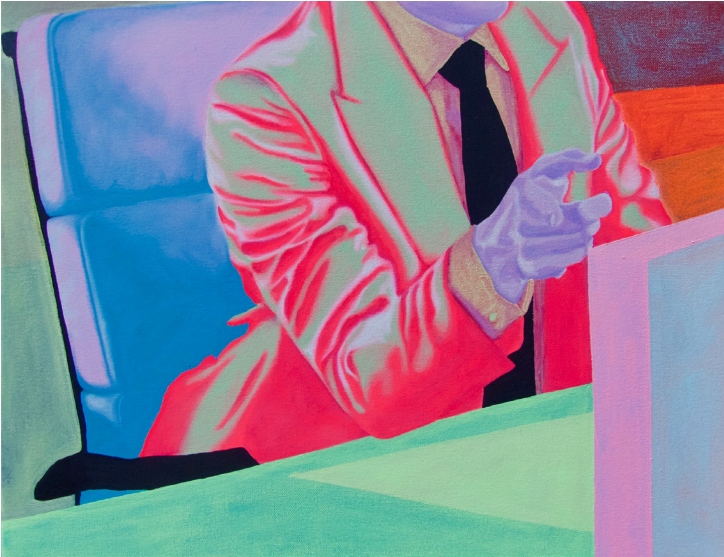
Louise Campion "Entitled"