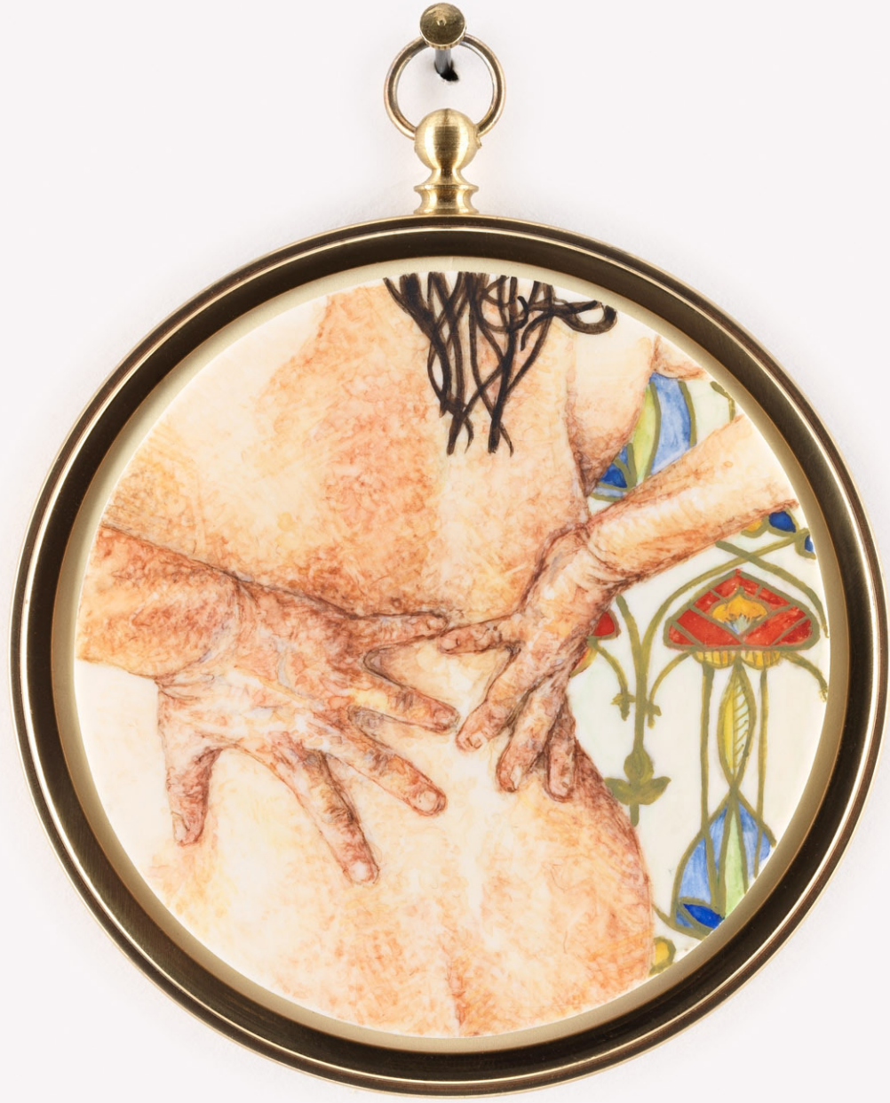
Katie Commodore, "Untitled (3)"