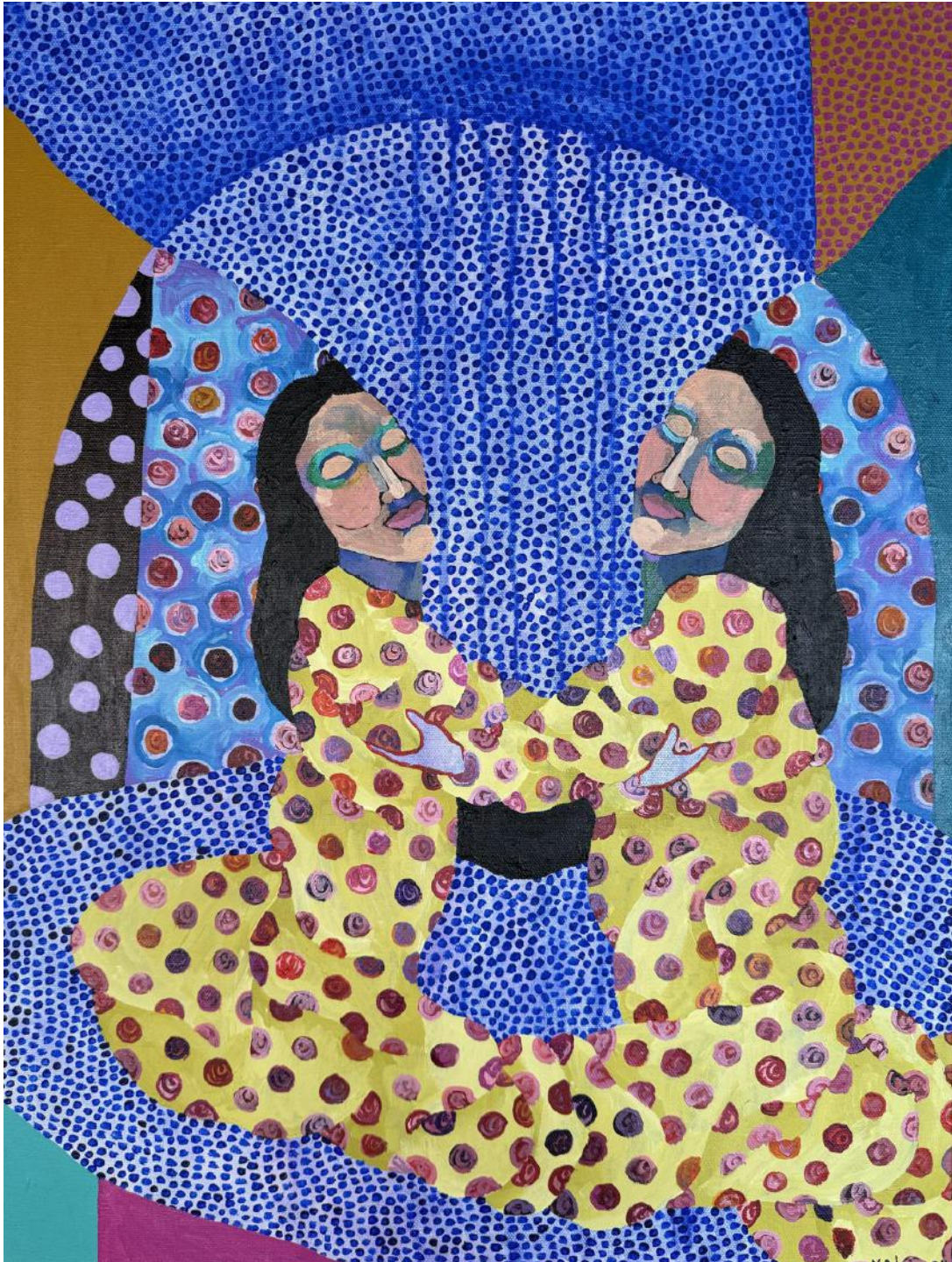
protector (protected), 2024 Acrylic on Canvas 24" x 30"