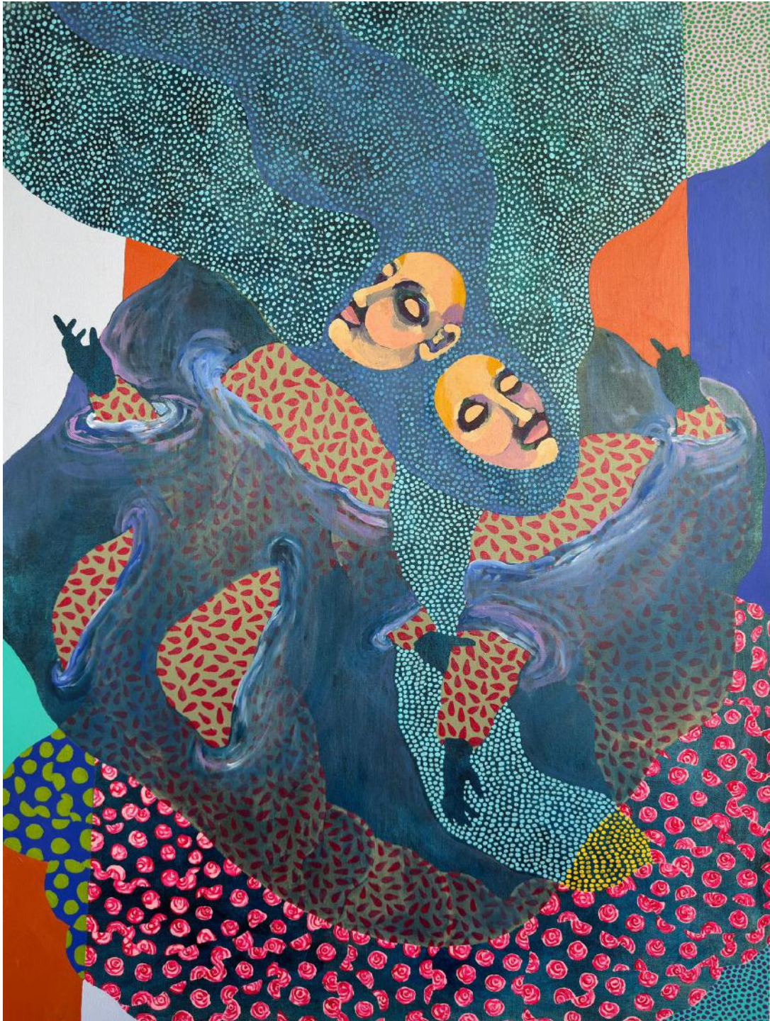
night swim (perhaps a dream), 2024 Acrylic on Canvas 30" x 40"