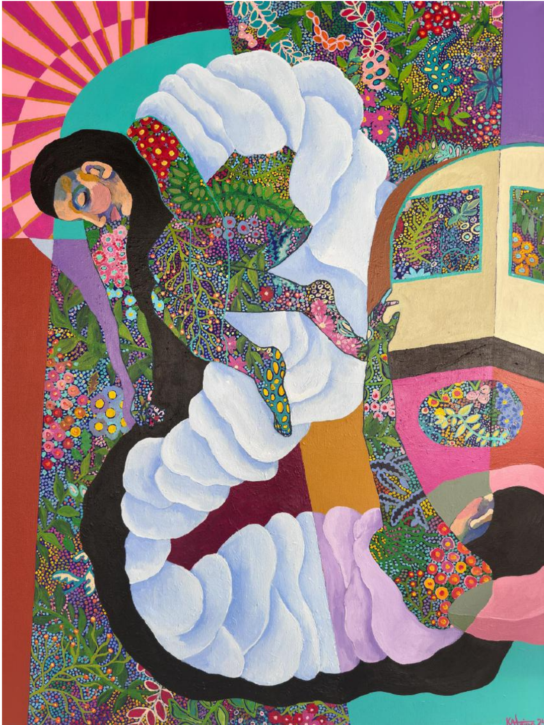
coming back to me, 2024 Acrylic on Canvas 30" x 40"