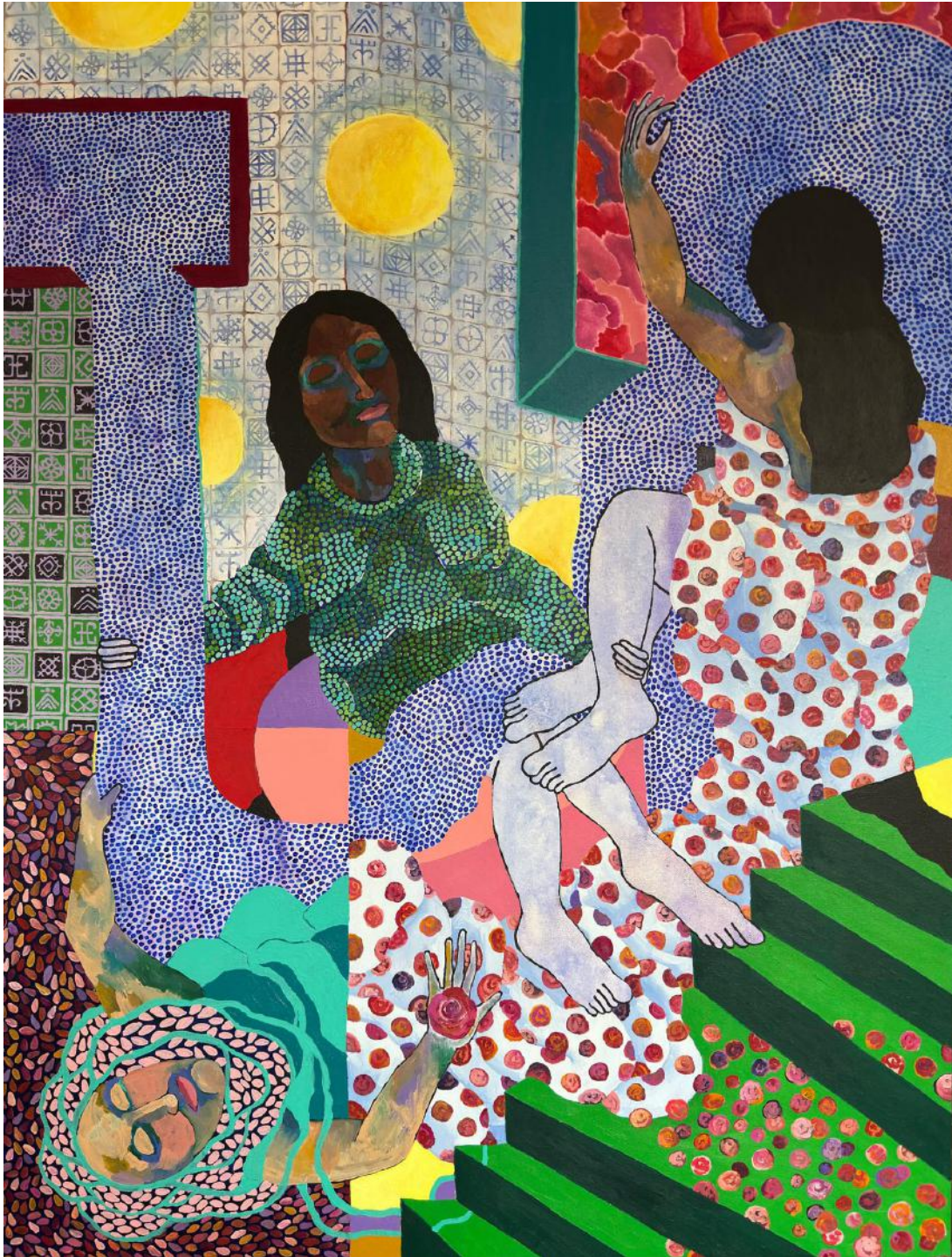
many moons my love, 2024 Acrylic on Canvas 36" x 48"