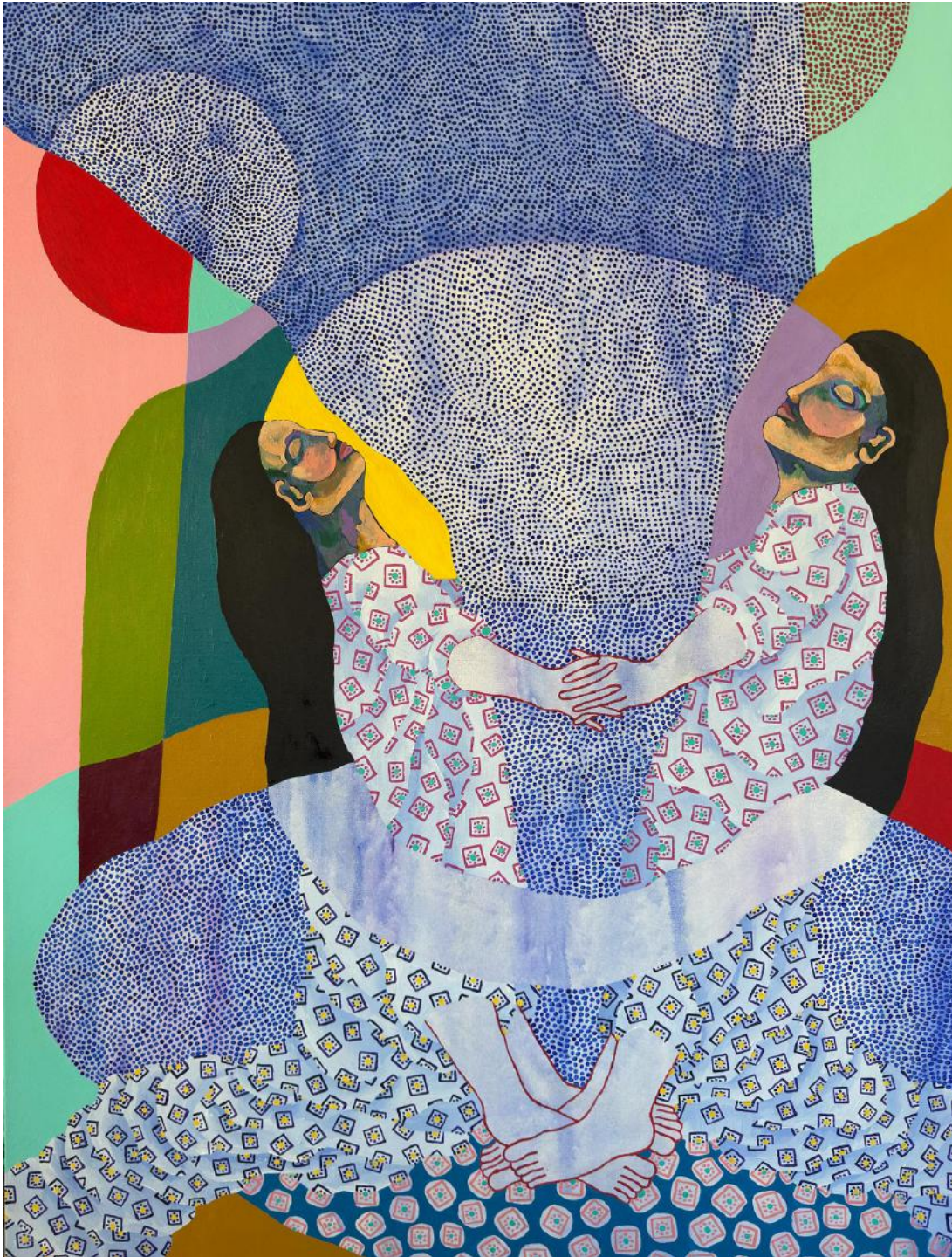
hold on (let go), 2024 Acrylic on Canvas 36" x 48"