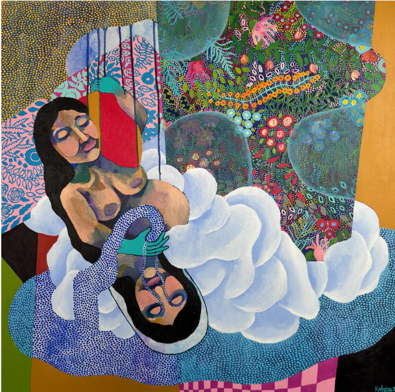
dreams of motherhood, more intense and frequent, 2024 Acrylic on Canvas 36" x 36"