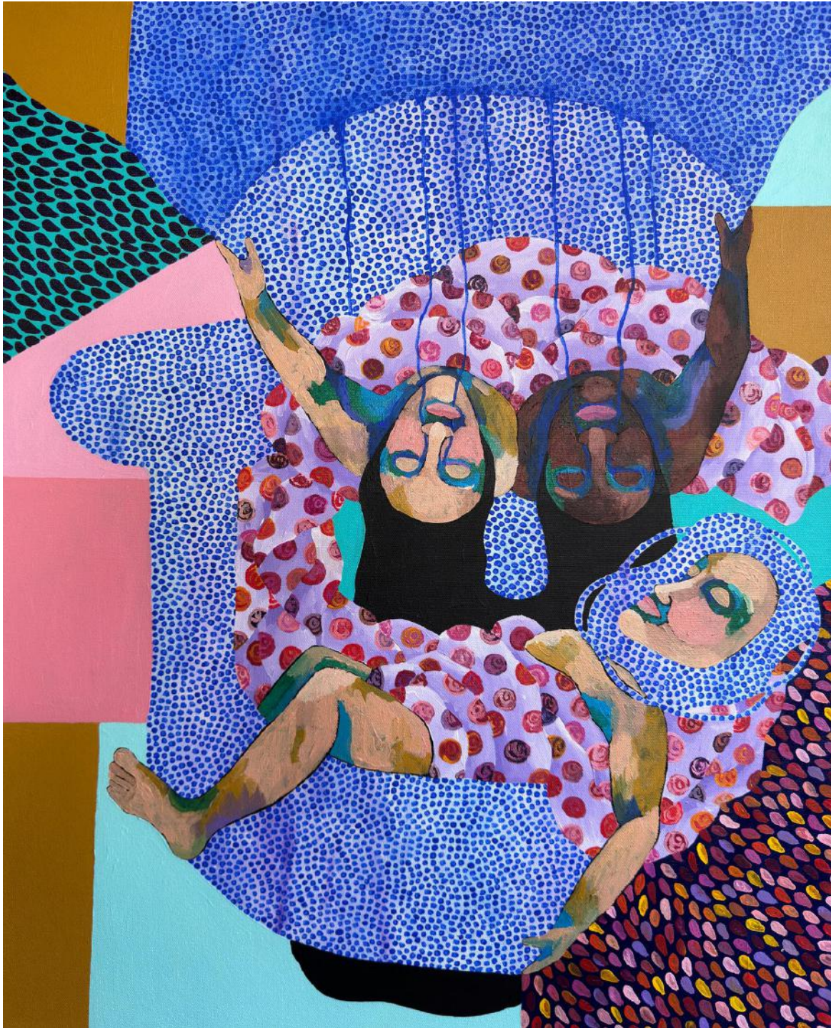
asleep in your garden, 2024 Acrylic on Canvas 24" x 30"