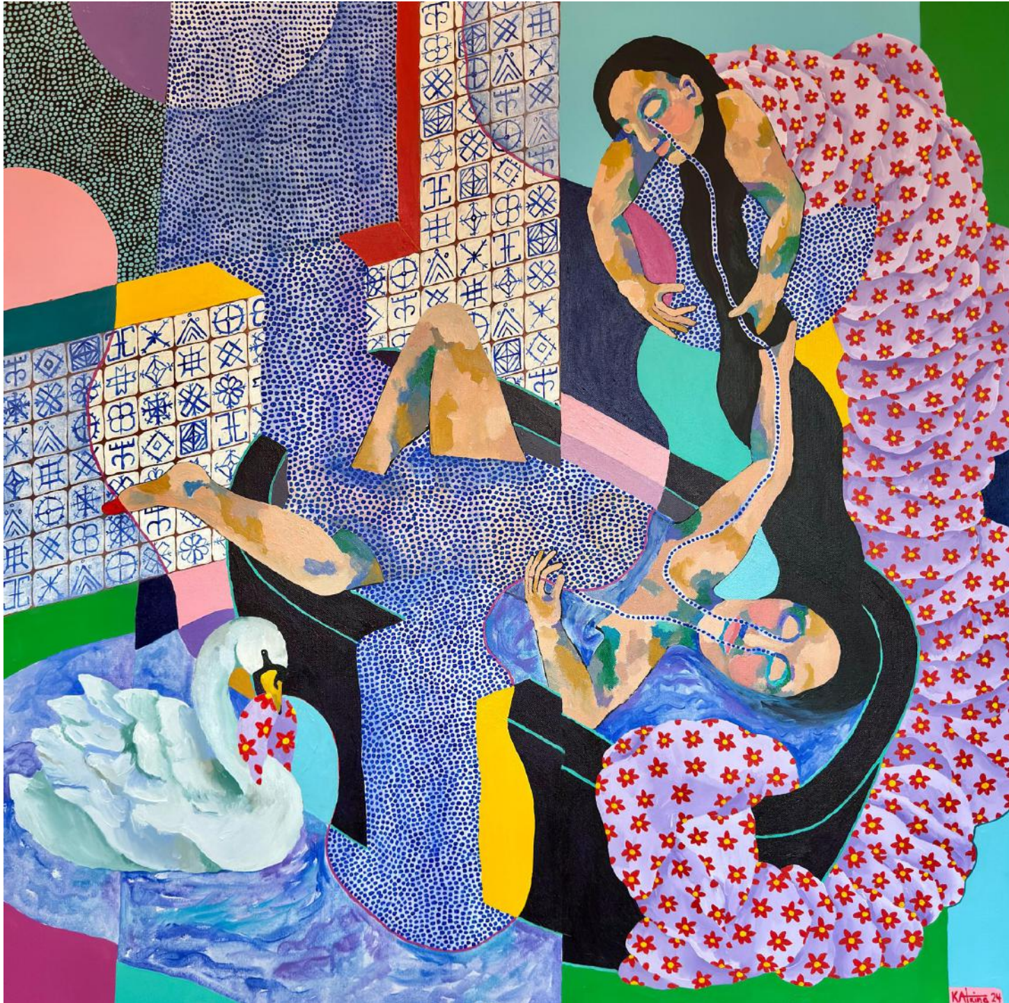
my imminent drowning, 2024 Acrylic on Canvas 36" x 36"