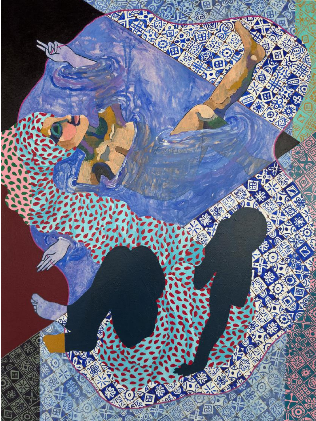
wake of your void, 2024 Acrylic on Canvas 30" x 40"