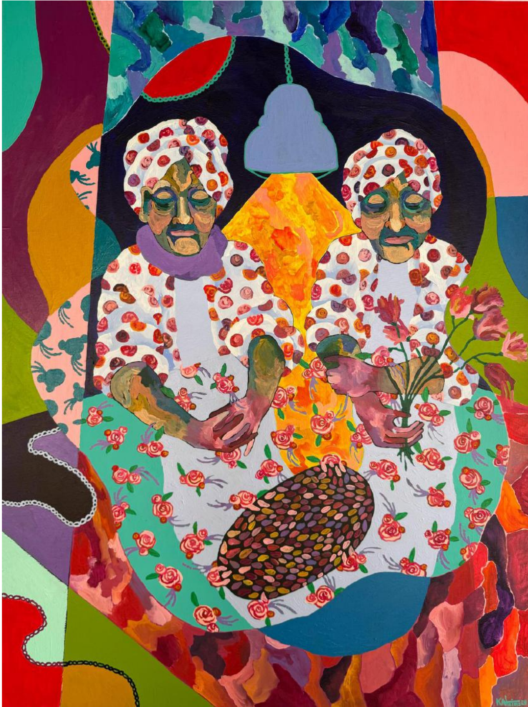
with you, 2024 Acrylic on Canvas 30" x 40"