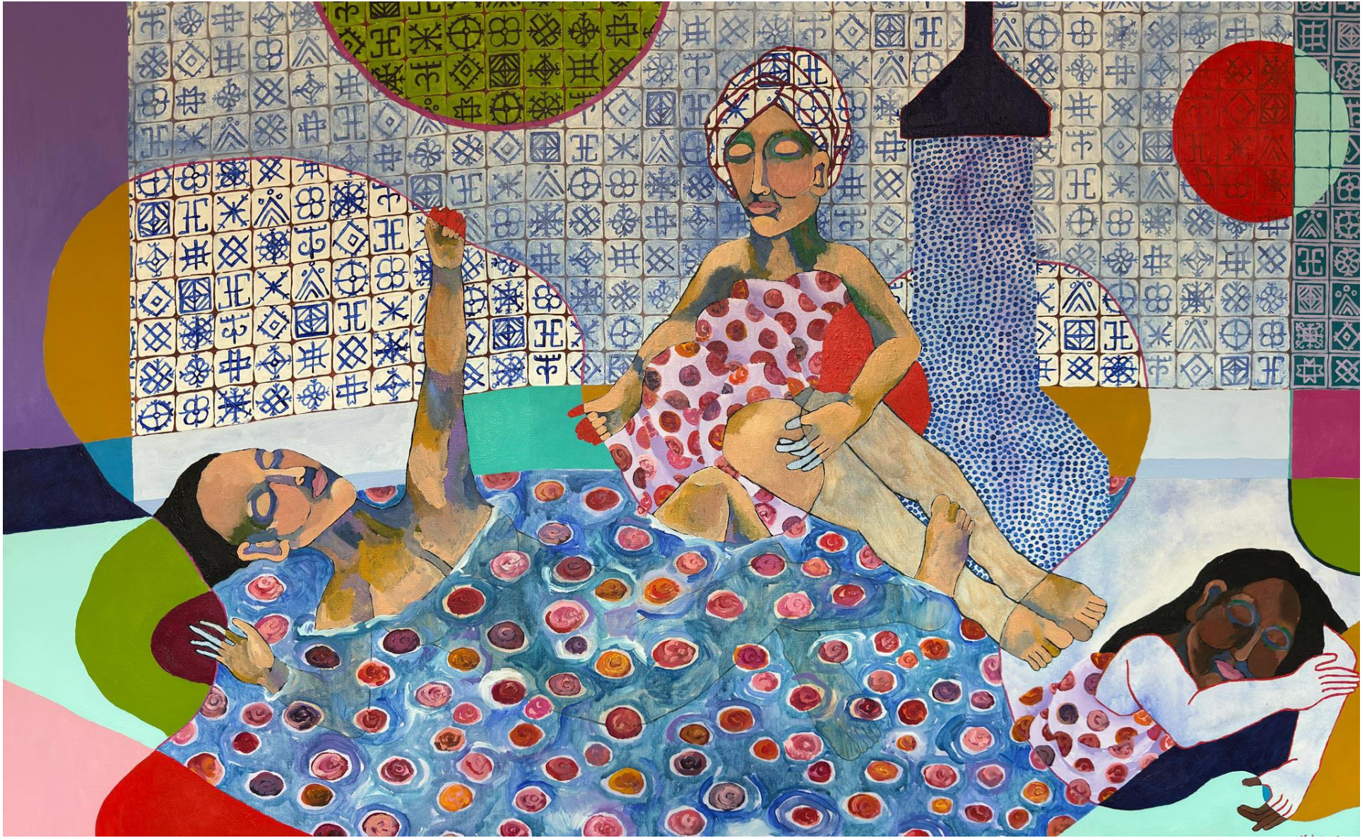
gathered at the pool of impermanence, 2024 Acrylic on Canvas 30" x 48"