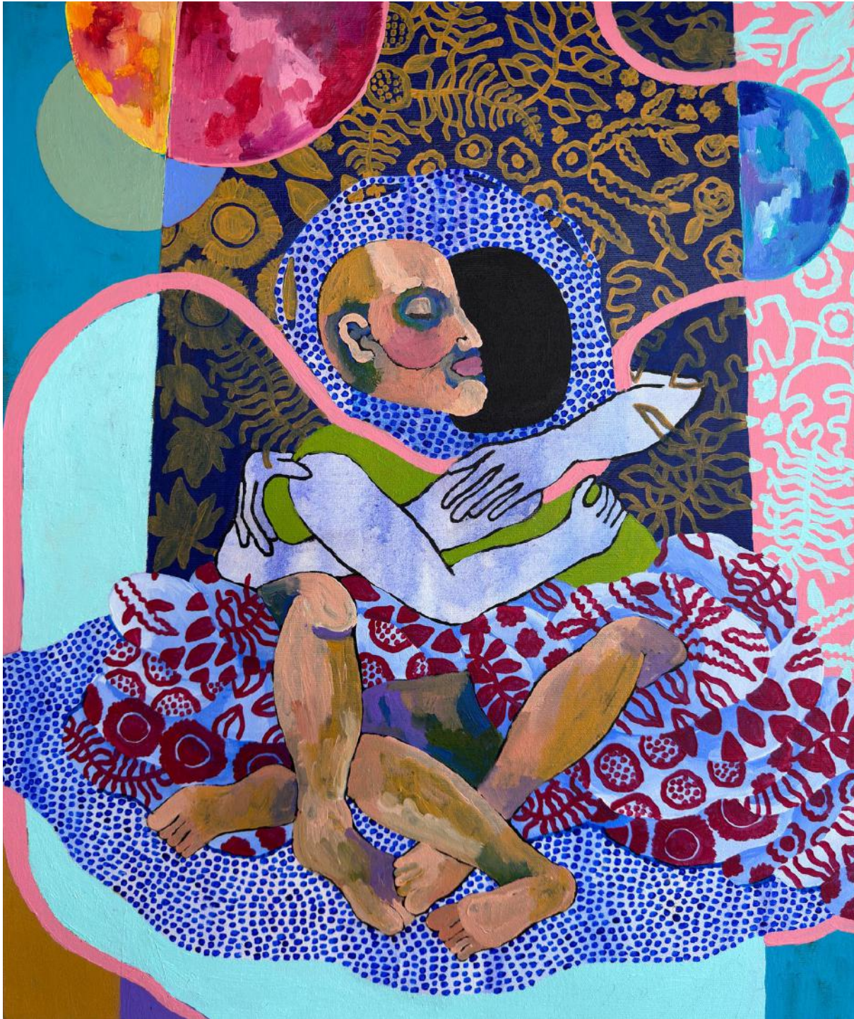
embrace, 2024 Acrylic on Canvas 20" x 24"