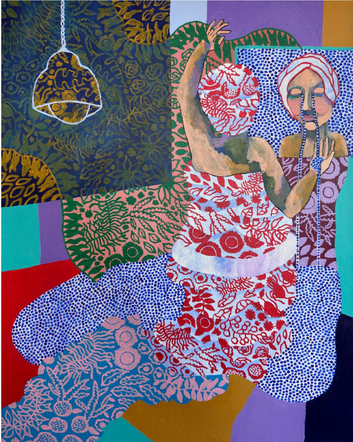
crying over you, 2024 Acrylic on Canvas 24" x 30"