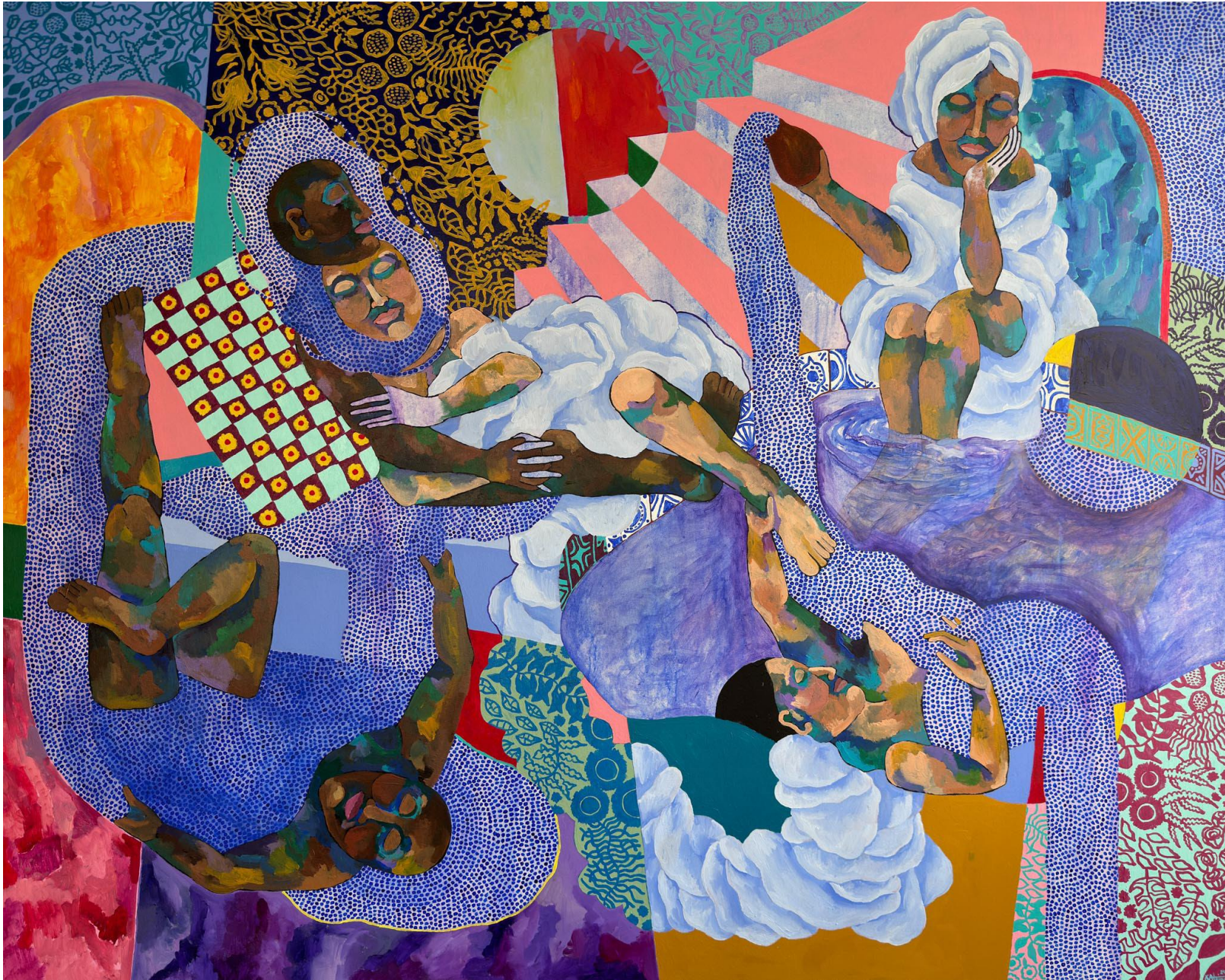
dream in rain (an abundant pool), 2023 Acrylic on Canvas 40" x 60"