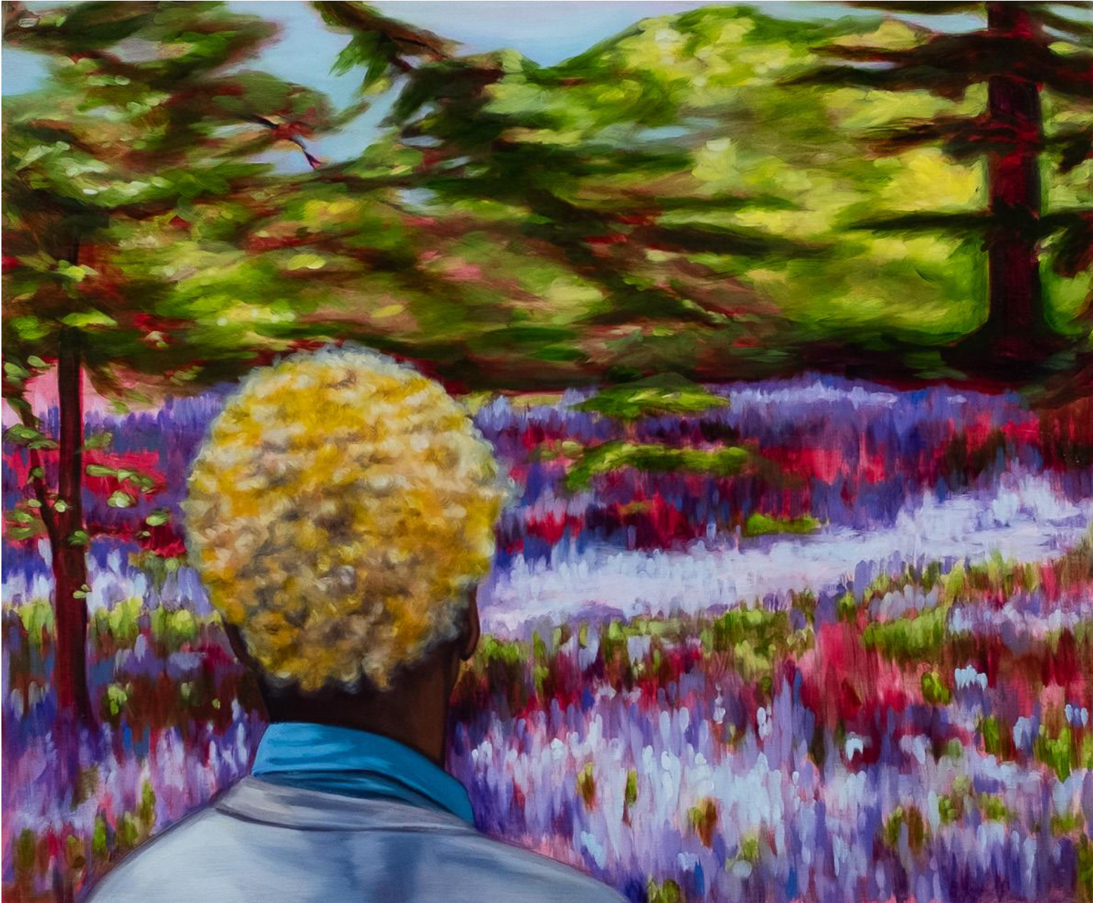
Bluebells, 2024 Oil on Panel 20" x 24"