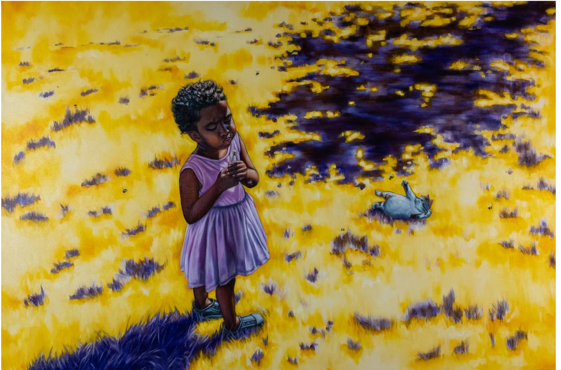
Thalia, 2024 Oil on Canvas 40" x 60"