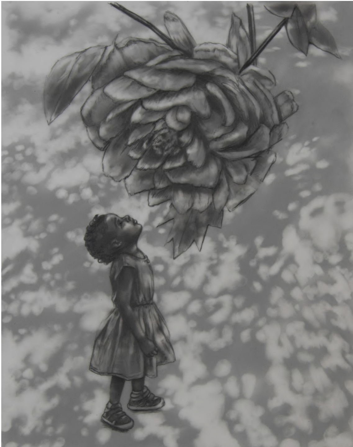
The Gardens Gift, 2024 Graphite on Drafting Film 11" x 8.5"