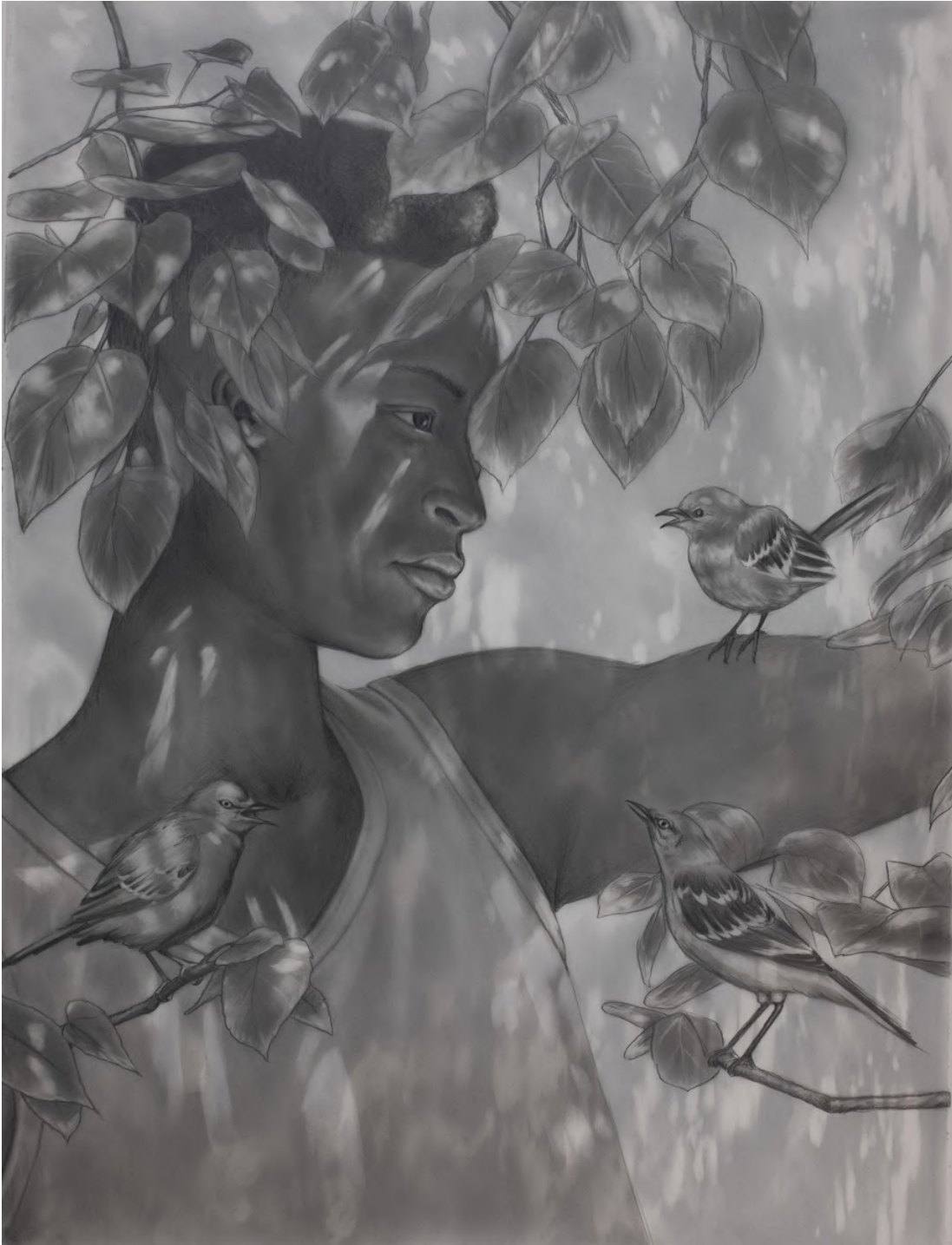
Sparrow, 2024 Graphite on Drafting Film 24" x 18"