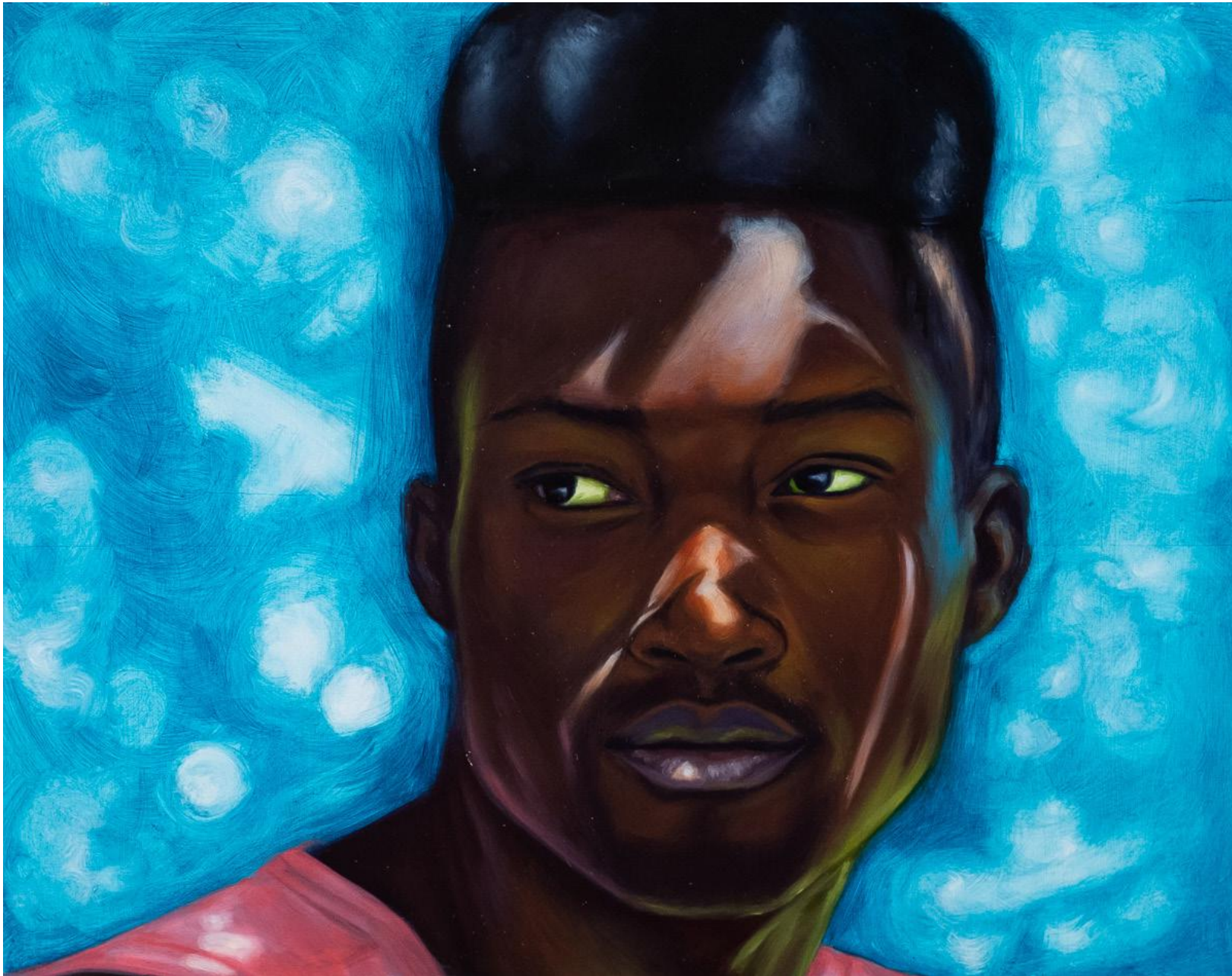
Timi, 2024 Oil on Panel 11" x 14"