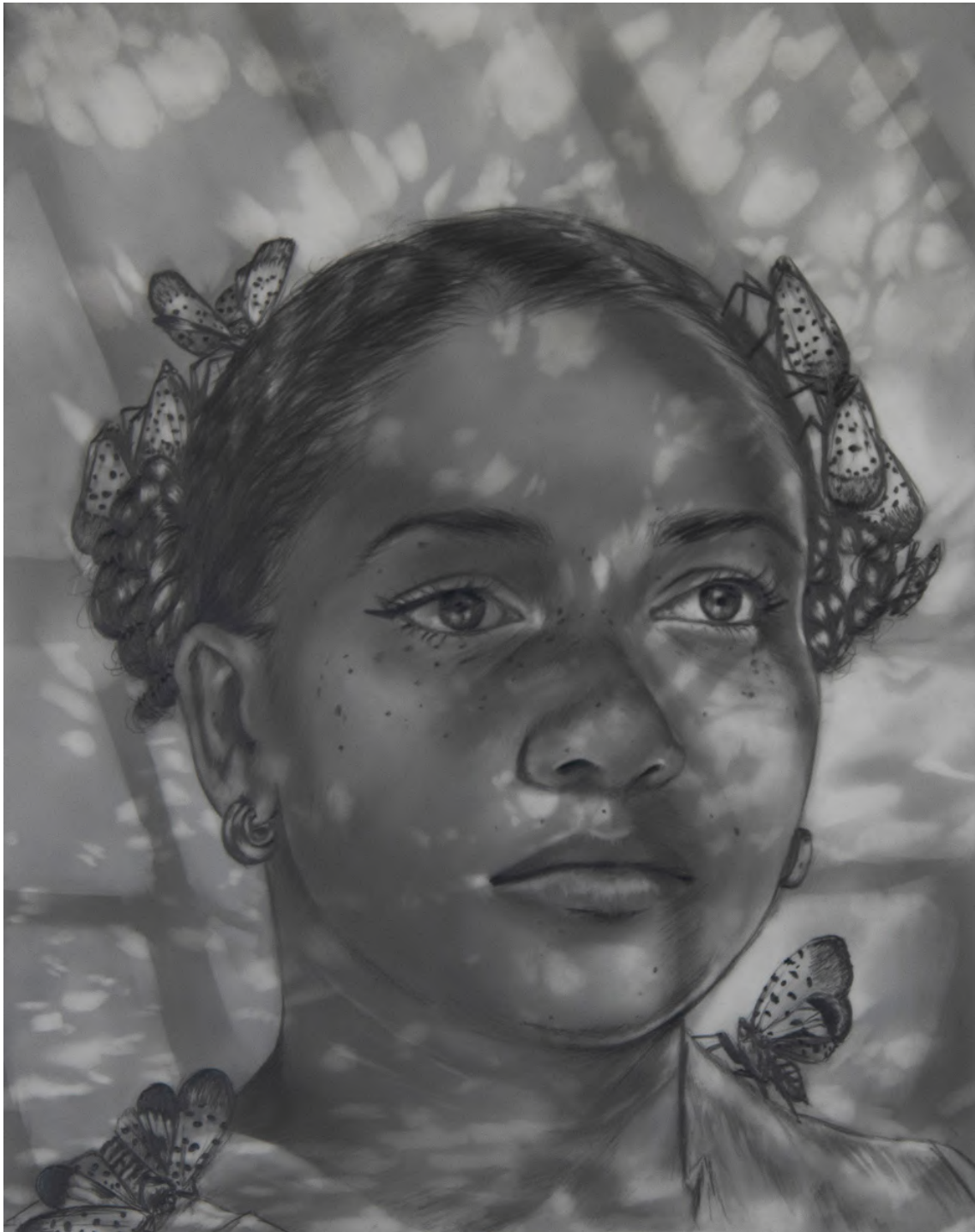
Summer Fly, 2024 Graphite on Drafting Film 11" x 8.5"