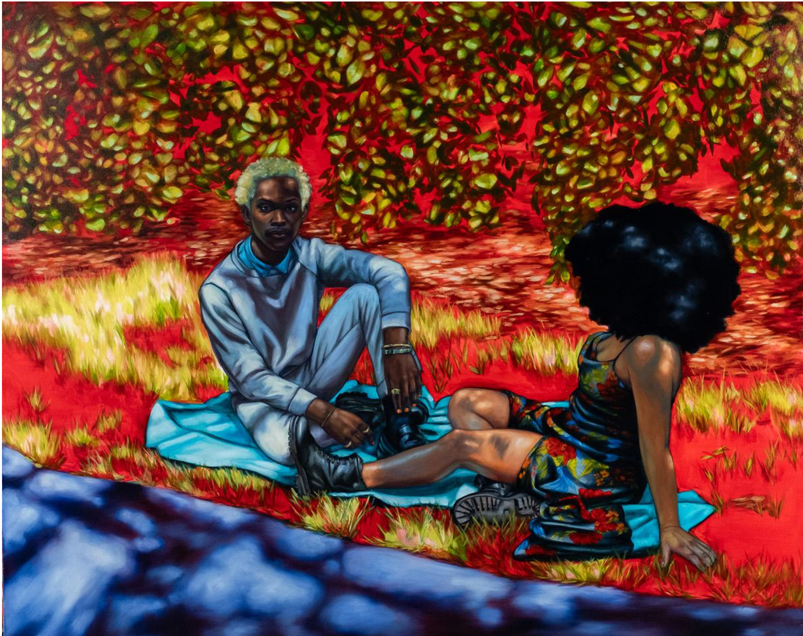
Pathside, 2024 Oil on Canvas 50" x 60"