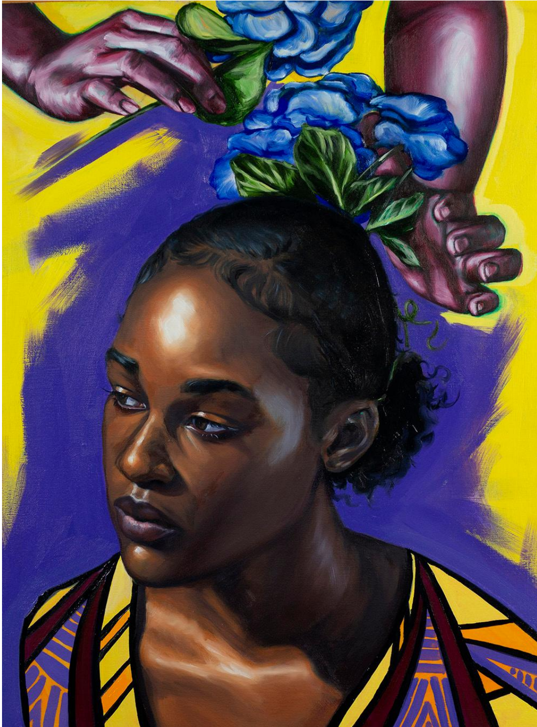
Guardian, 2023 Oil and Acrylic on Wood Panel 16" x 12"