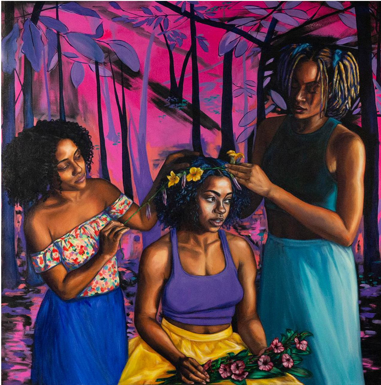
The Bride, 2023 Oil and Acrylic on Canvas 50" x 50"