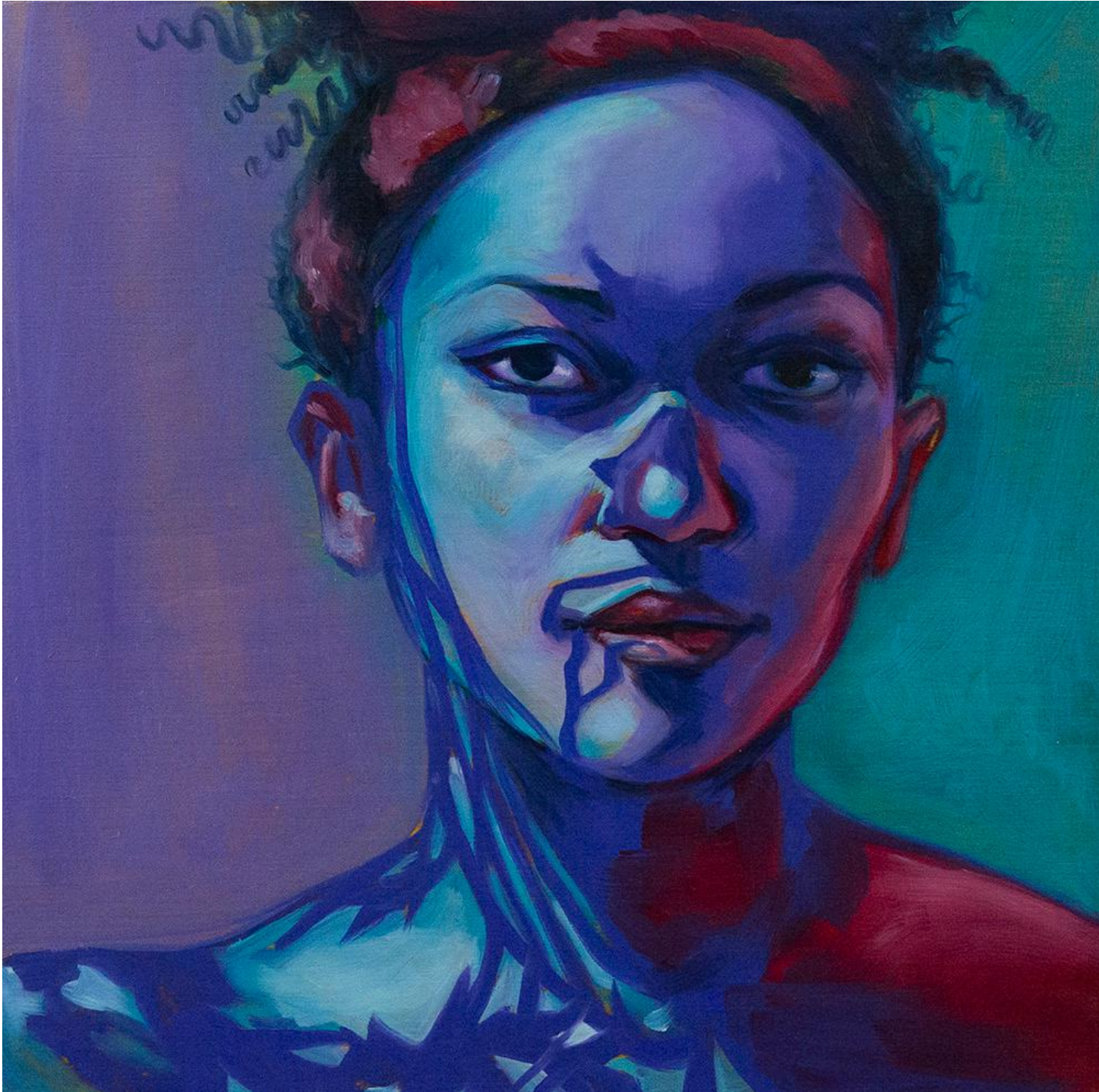
Color Study #1, 2021 Oil on Wood Panel 10" x 10"