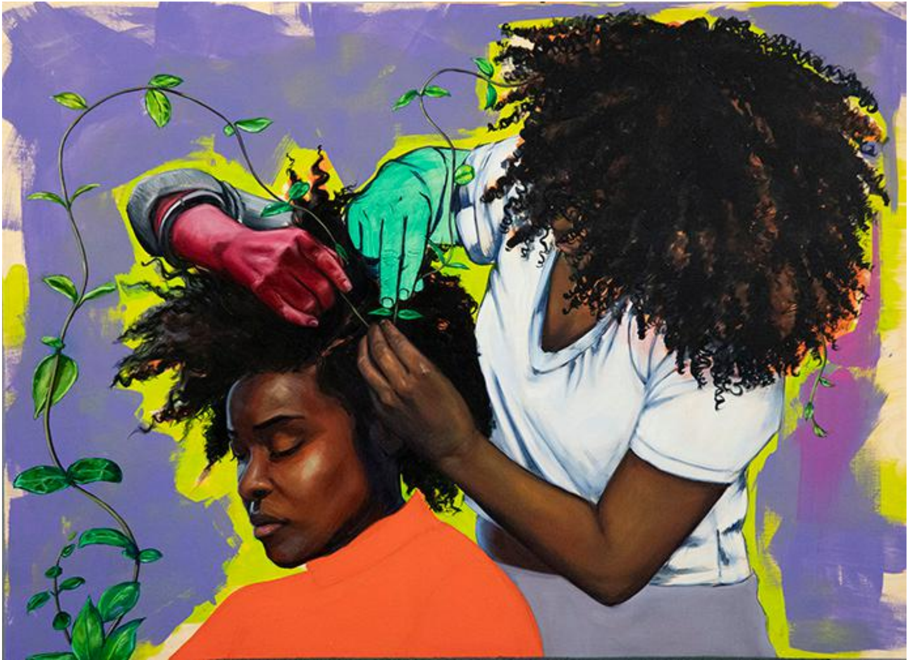
Sections, 2022 Oil and Acrylic on Panel 22" x 30"