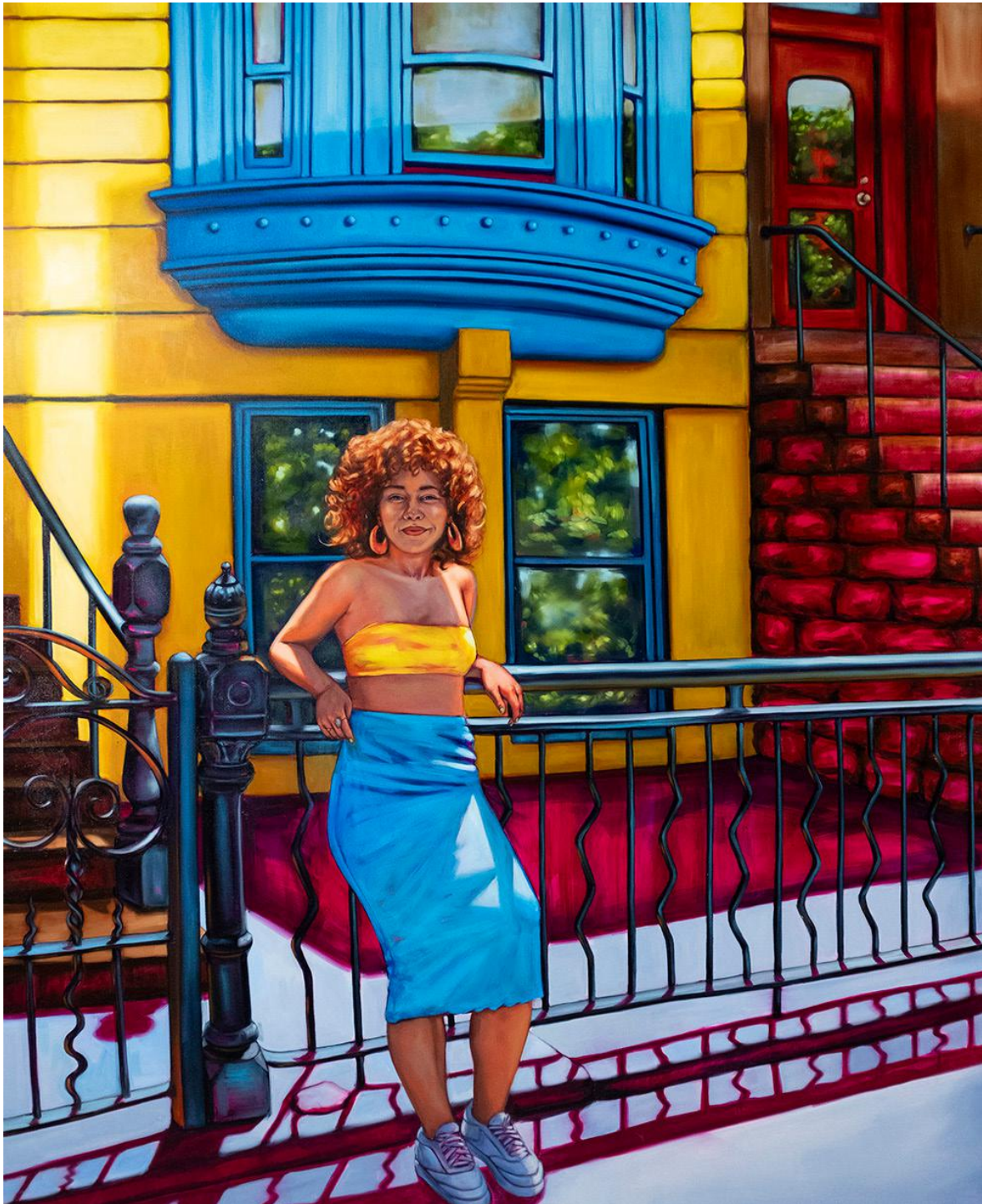
The Block, 2024 Oil on Canvas 60" x 48"