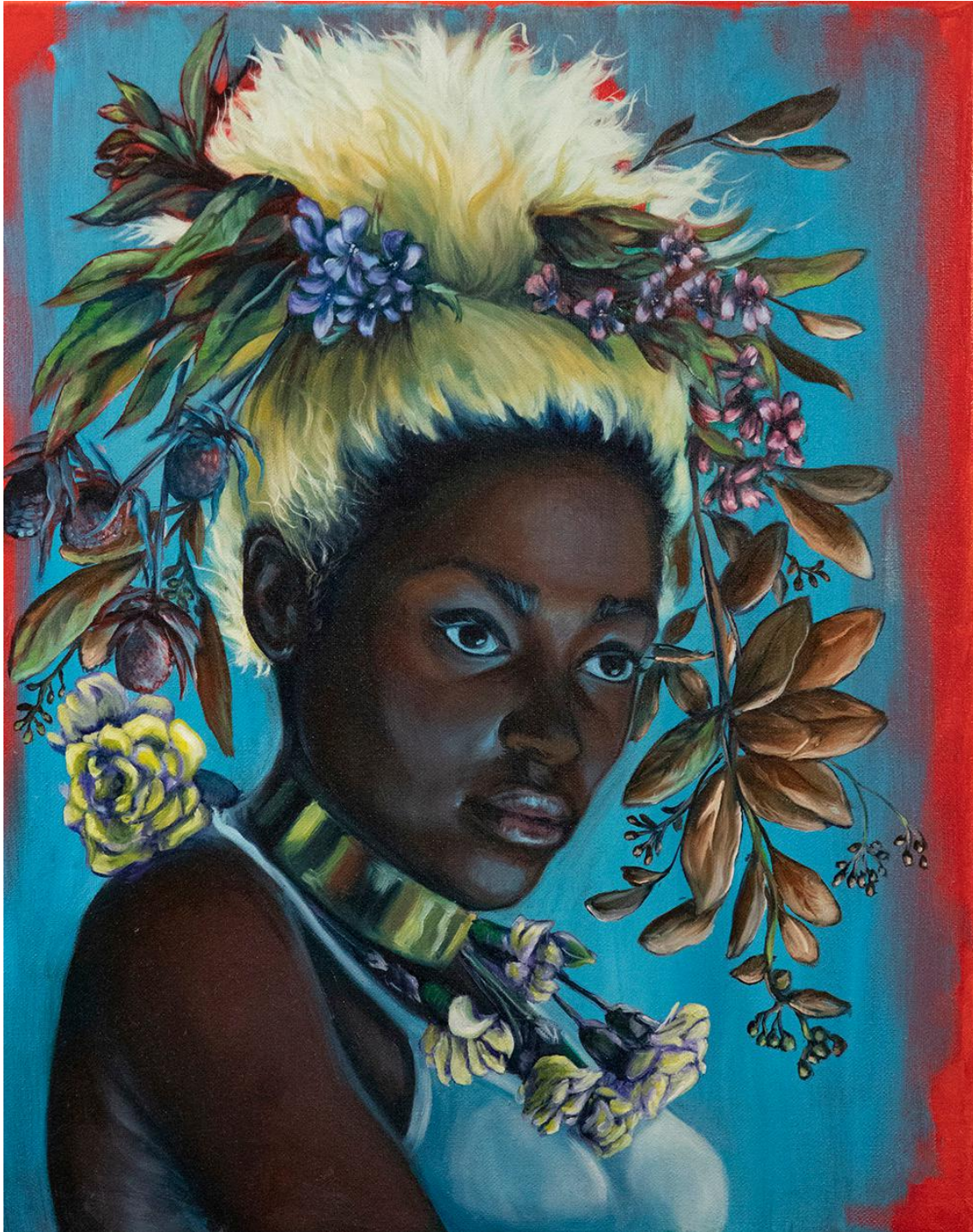
Effia, 2017 Oil and Acrylic on Canvas 20" x 16"