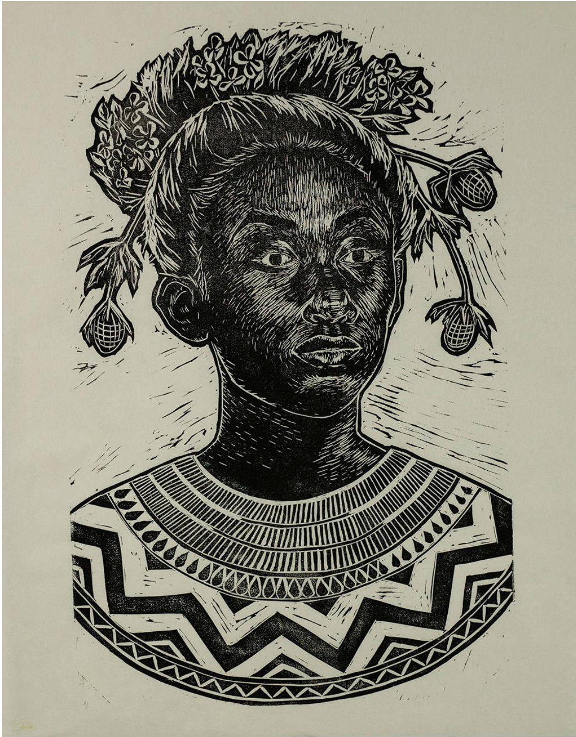
Akua, 2017 Linocut Print 20" x 16"