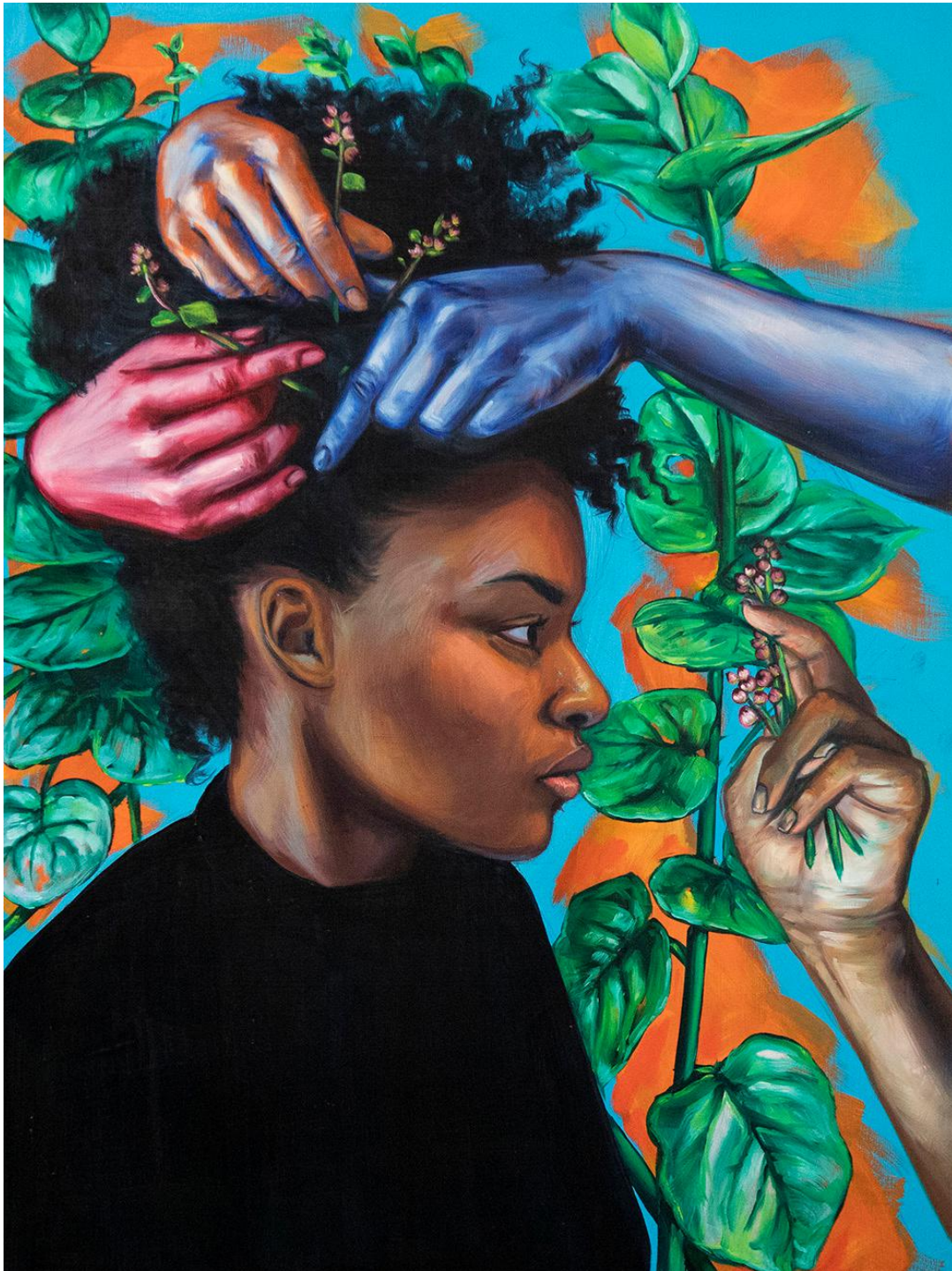
Malabar, 2022 Oil and Acrylic on Wood Panel 24" x 18"