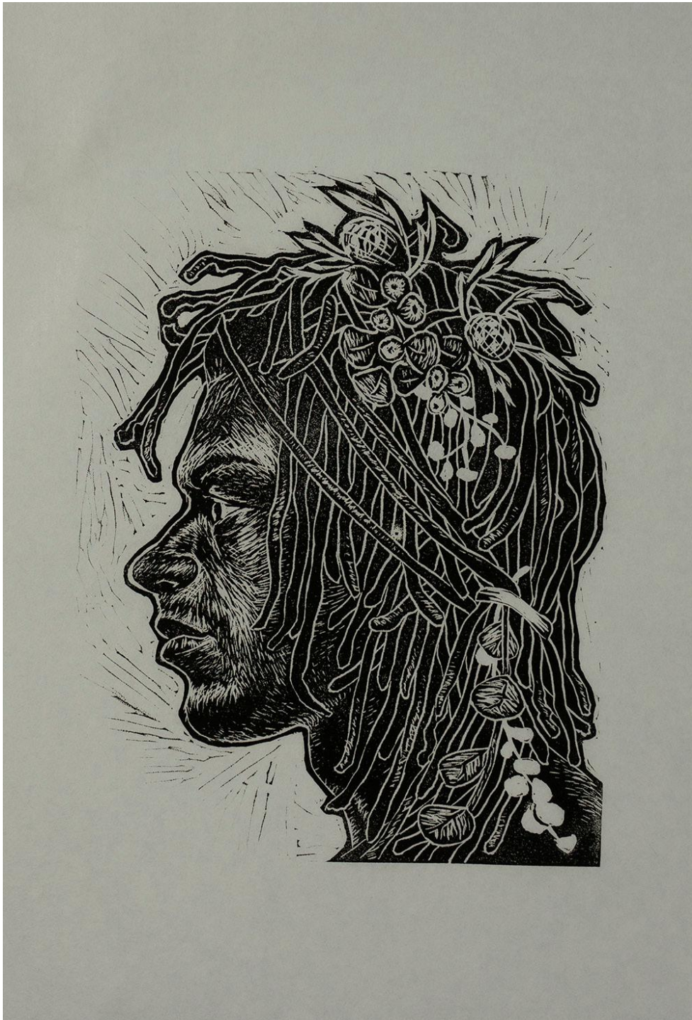
Bo, 2019 Linocut Print 19" x 12"