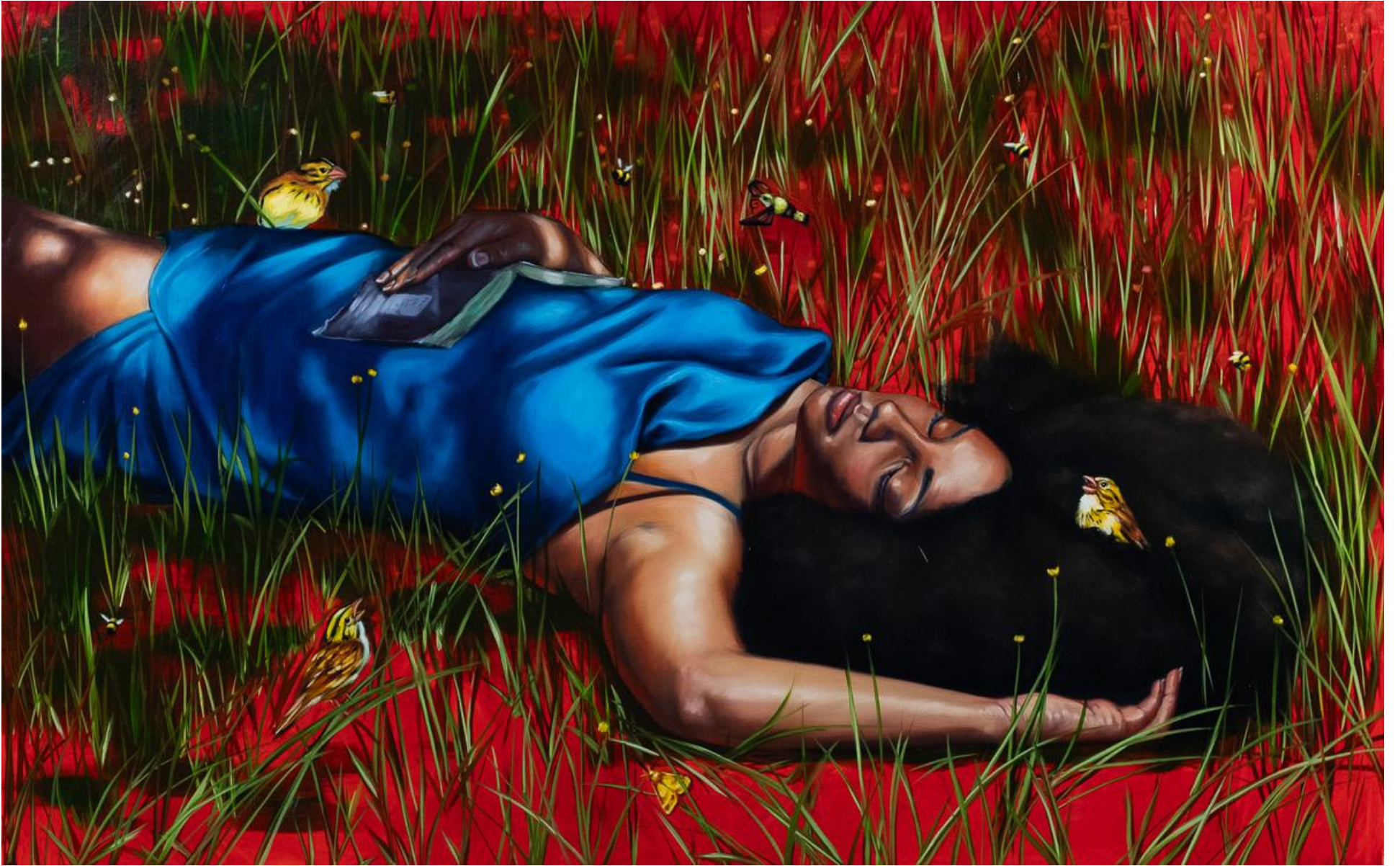
Shelly, 2024 Oil on Canvas 26" x 42"