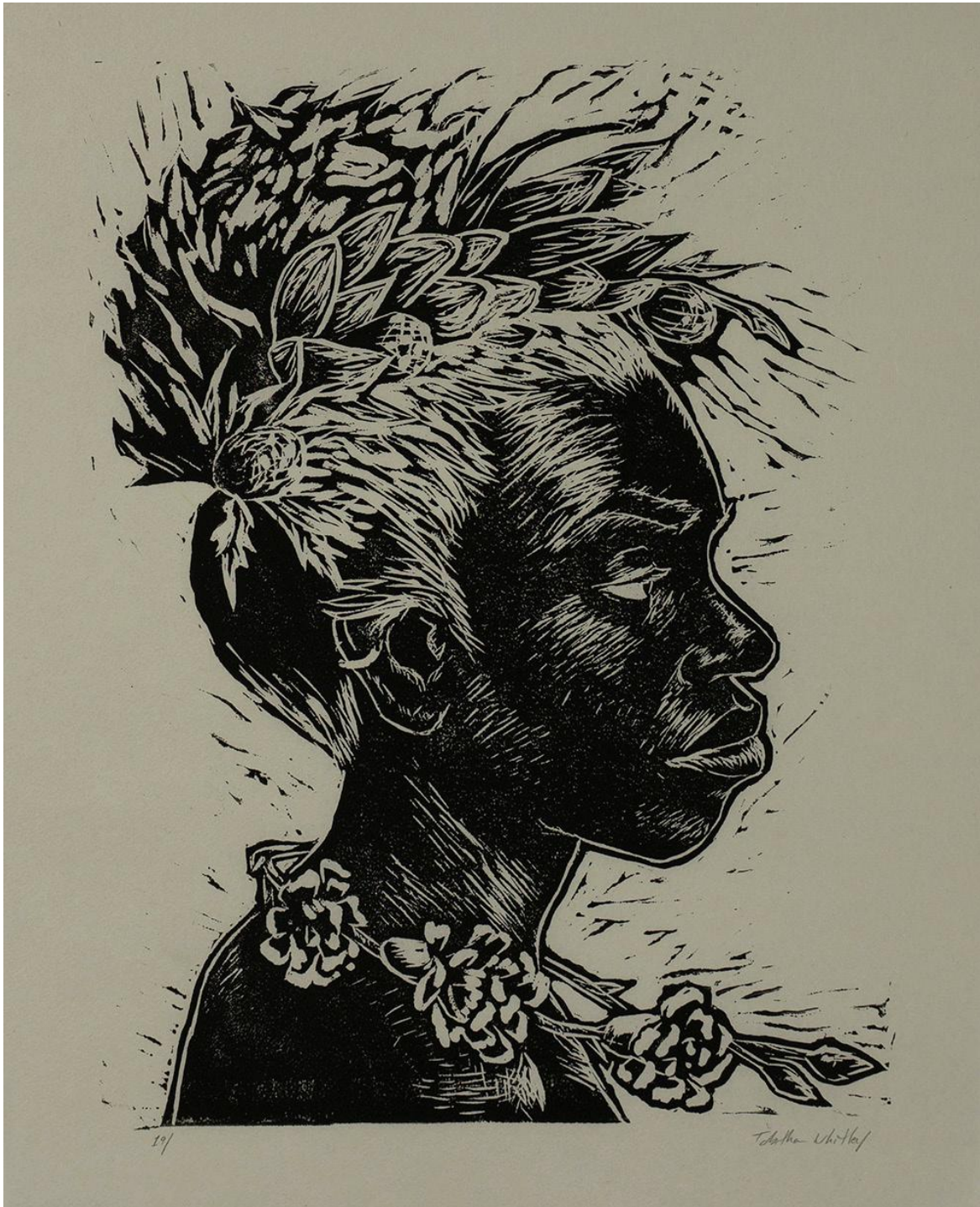
Esi, 2018 Linocut Print 12" x 9"