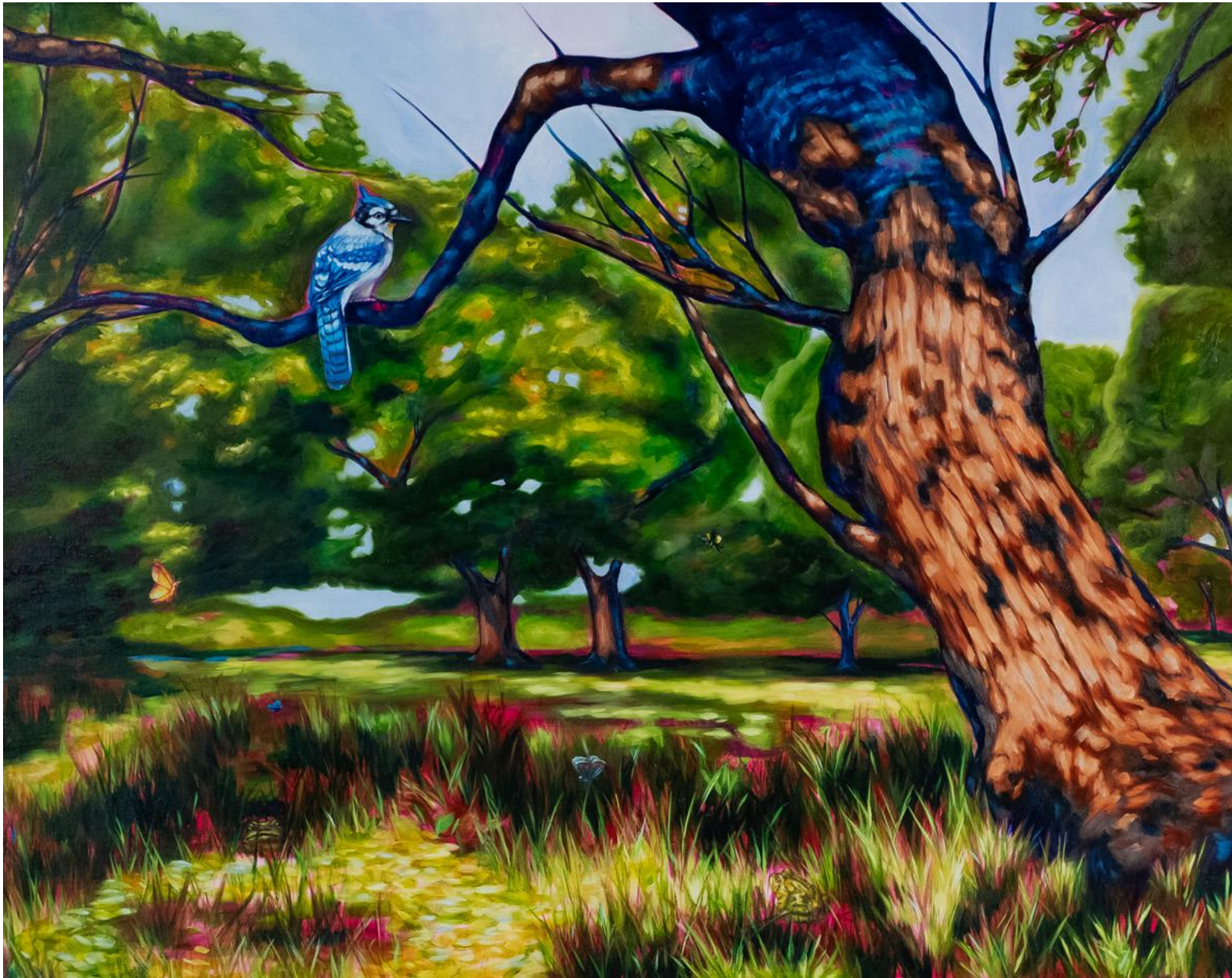
BlueJay, 2024 Oil on Canvas 34" x 36"