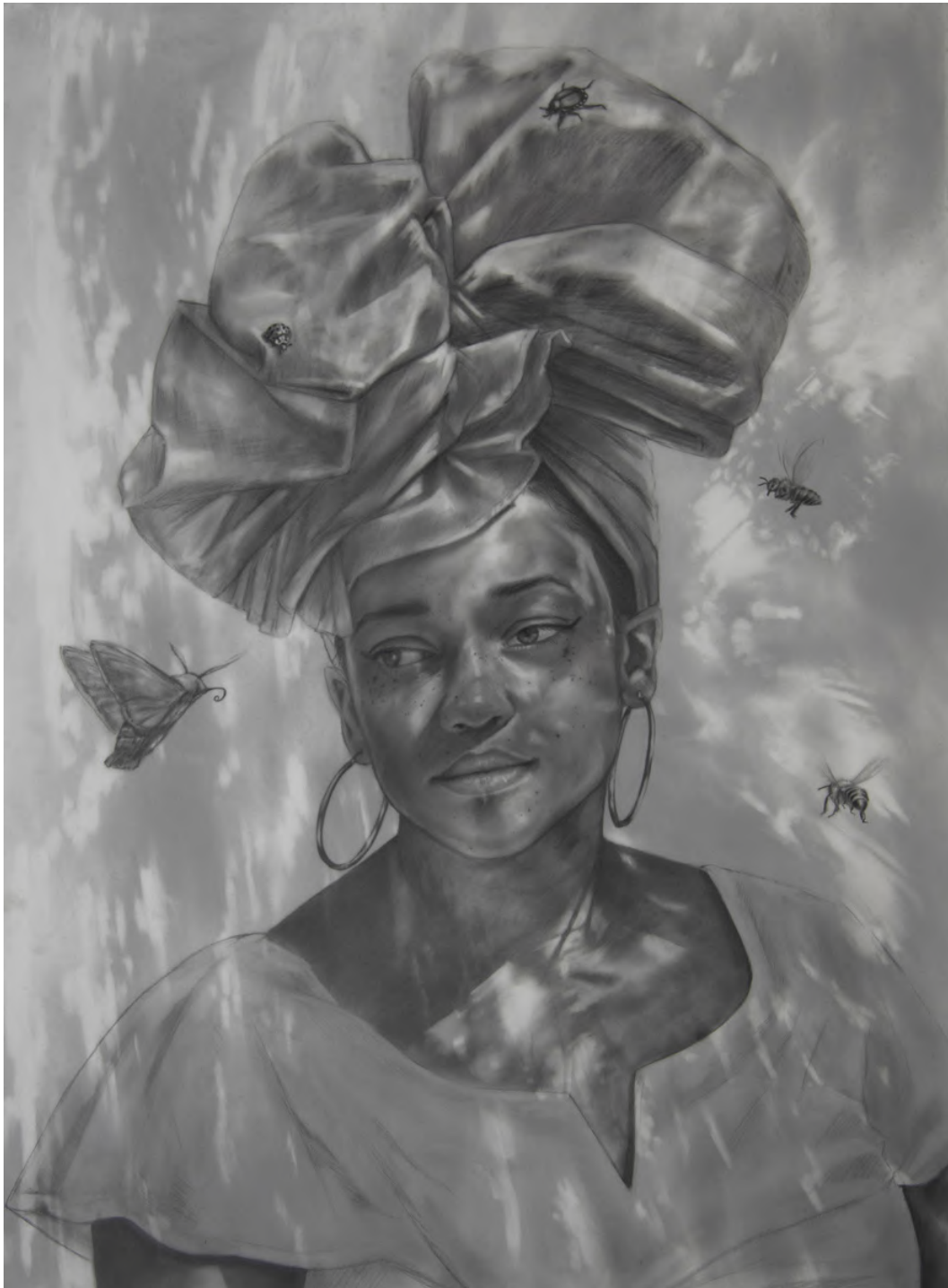
Moth, 2024 Graphite on Drafting Film 24" x 18"