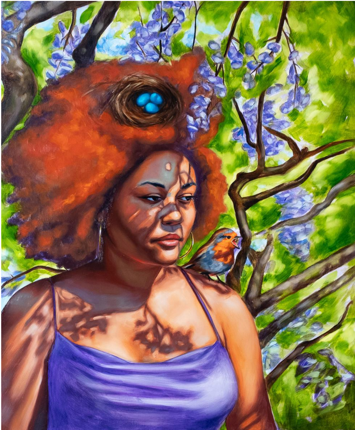
Robin, 2024 Oil on Canvas 24" x 20"