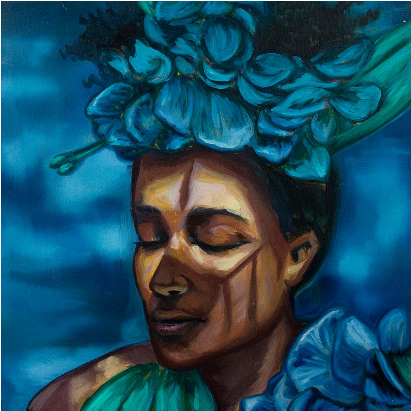
Color Study #2, 2021 Oil on Panel 10" x 10"