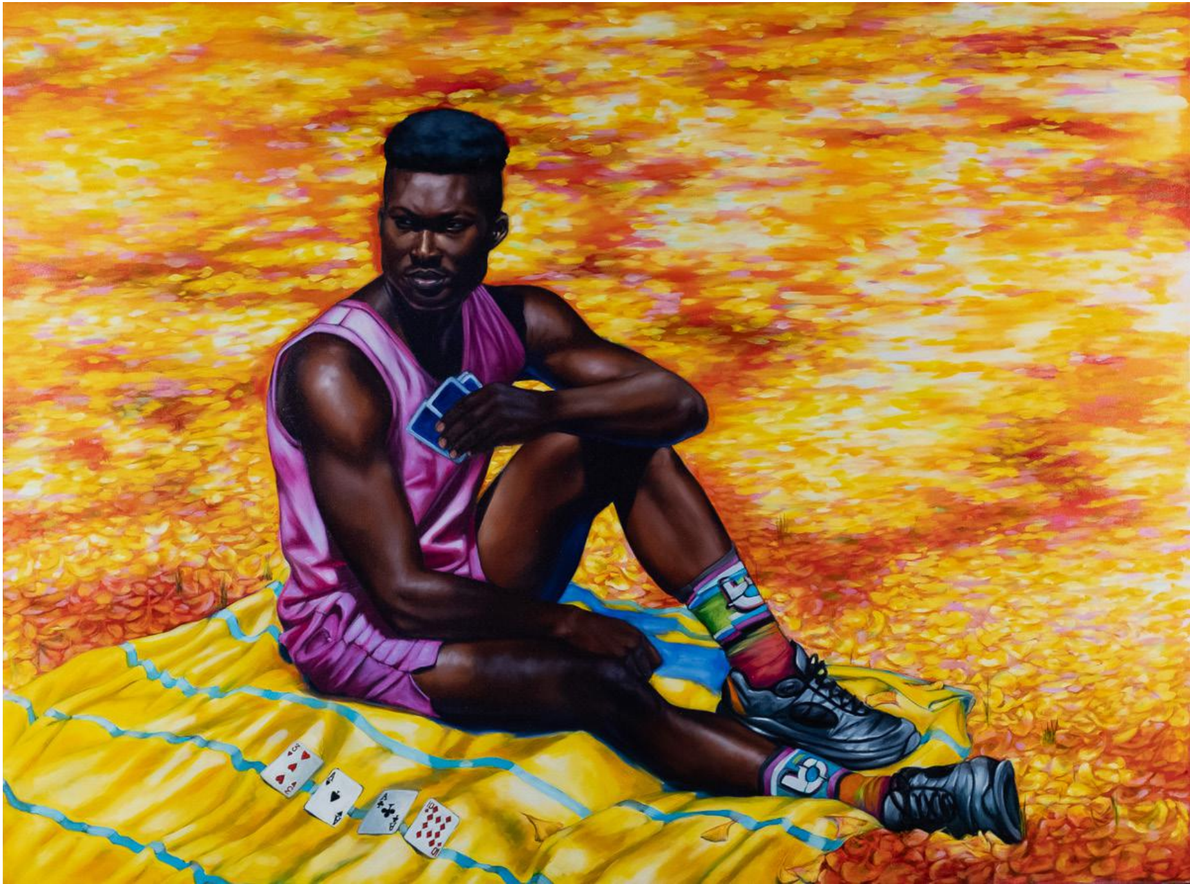
Casino, 2024 Oil on Canvas 42" x 56"