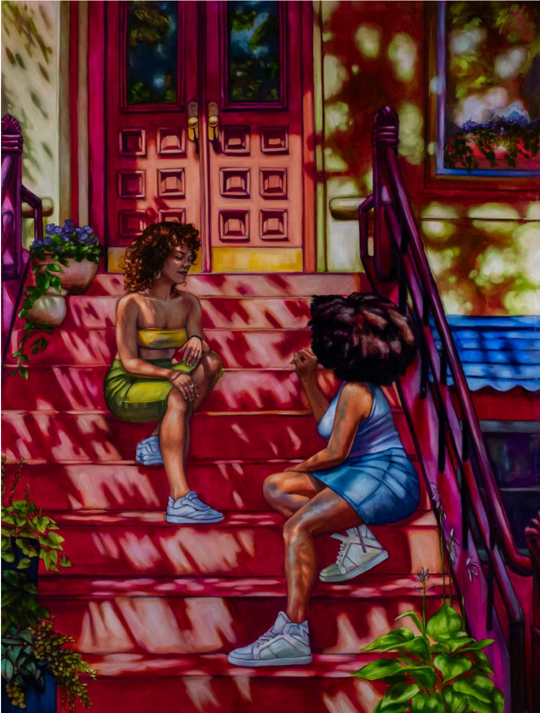
The Stoop, 2024 Oil on Canvas 64" x 48"